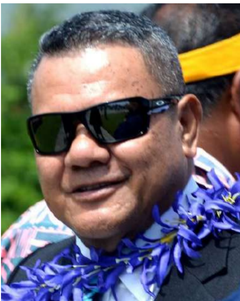
Minisita o Pisinisi Alamanuia ma Leipa

I le mae'a ai o le fonotaga a Minisita ma le Komiti Faatonu a le Pulega ile Aso Tofi 17 Fepuari 2022, ua tuuina atu le mataupu ile Komiti Faatonu mo le su'esu'eina. O le a toe fofogaina le atunu'u ile taunuuga o lenei su'esu'ega ise aso o i luma.