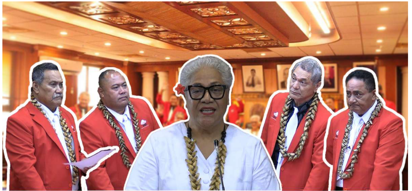
Honorable Prime Minister Fiamē Naomi Mataafa flanked by; L - R: Fuiono Tenina Crichton, Maiava Fuimaono Tito Asafo, Faleomavaega Titimaea Tafua & Laumatiamanu Ringo Purcell