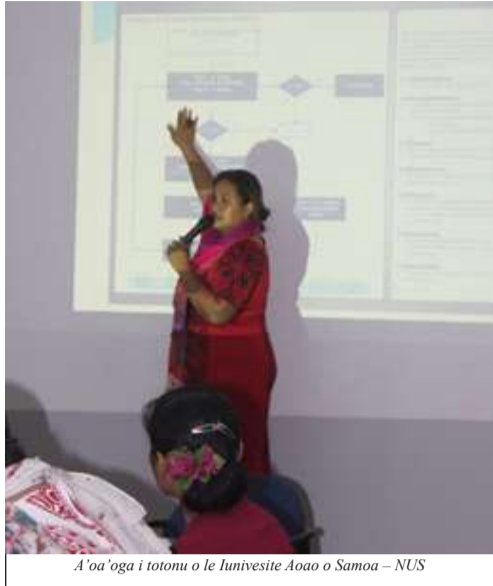
A'oa'oga i totomu o le Iunivesite Aoa o Samoa - NUS

I le fa'atupulā'ia o le malaga mai pea o fanau mai Savai'i mo Upolu nei i a'oa'oga i le Iunivesite Aoa o Samoa pe a mae'a a'oa'oga i Kolisi, o se tasi lea o vaega o lo'o lauālua i le silasila a le Minisitā o le Matāgaluega o 'Āoga, Ta'aloga ma Aganu'u fa'apea ai le Pule Sili ma le Pulega a le Iunivesite.