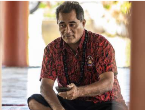
Minisita o le Pulega o Tagata Tafafao mai Fafo

Ua taulimaina e le Minisita o Faalapotopotoga a le Malo, ma le Minisita o le Pulega o Tagata Tafafao mai fafo ni tusi fa'aseā mai ia'i latou o galulue, ma nisi sa galulue ile Pulega e faasinotonu i aga tausili ma agava'a o le Ofisa Sili o le Pulega.