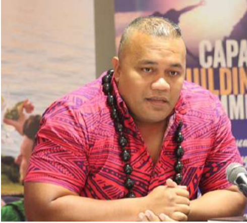
Ofisa Sili o Pulega a le Pulega o Tagata Tafafao Maimoa mai Fafo ia Fa'amatu'u Suifua Fa'amatu'u.

Ua taulimaina e le Minisita o Faalapotopotoga a le Malo, ma le Minisita o le Pulega o Tagata Tafafao mai fafo ni tusi fa'aseā mai ia'i latou o galulue, ma nisi sa galulue ile Pulega e faasinotonu i aga tausili ma agava'a o le Ofisa Sili o le Pulega.