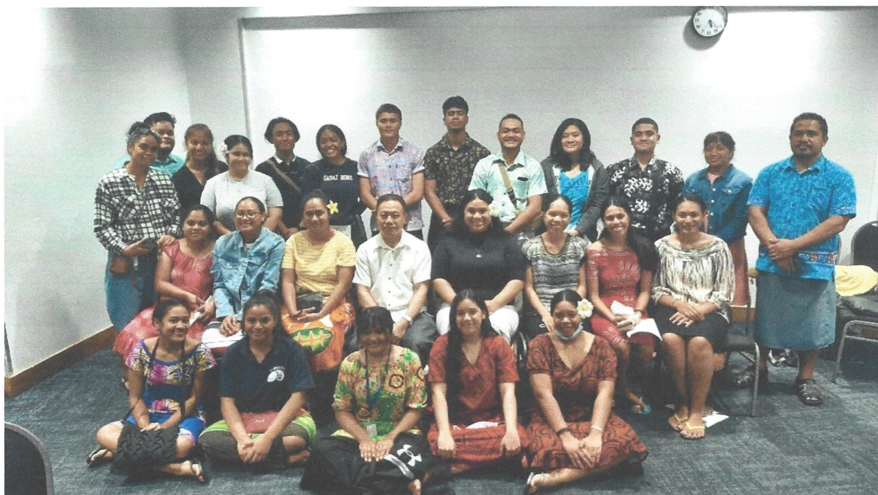
USP Samoan 1 st year students during a Welcoming meeting with Samoa High Commission representatives on the students first Sunday [20 March 2022] while in quarantine in hotels following their arrival in Fiji.

Light refreshments were served following the conclusion of the meeting.