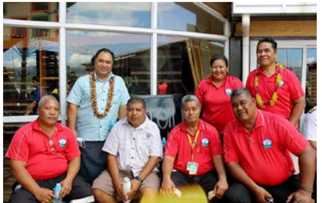
Fa'amanatu i Samoa le sao tāua o seila Samoa