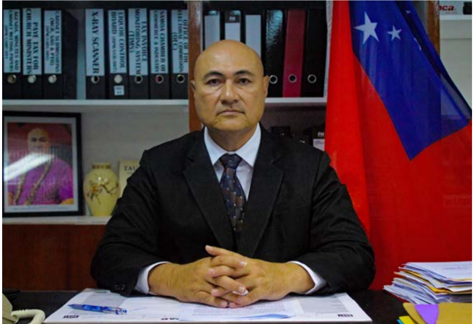
Afioga i le Sui Palemia ia Tuala Tevaga Iosefo Ponifasio.

“O le aso ananafi (Aso Gafua, 27 Iuni 2022) na iloilo ai e le Kapeneta isi la'asaga mo Poloā'iga o vavao mo le atunu'u. O vaega tupito sa iloilo toto'a e le Kapeneta, na fa'avae i le tulaga ua i ai nei le fa'agasologa o a tatou tui puipui ma le tu'uitiitia ua mātua, io tatou tagata e a'afia i le pipisi o le fa'ama'i. O le tu'uitiitia o i la-12 - Savali Wednesday 29th June 2022