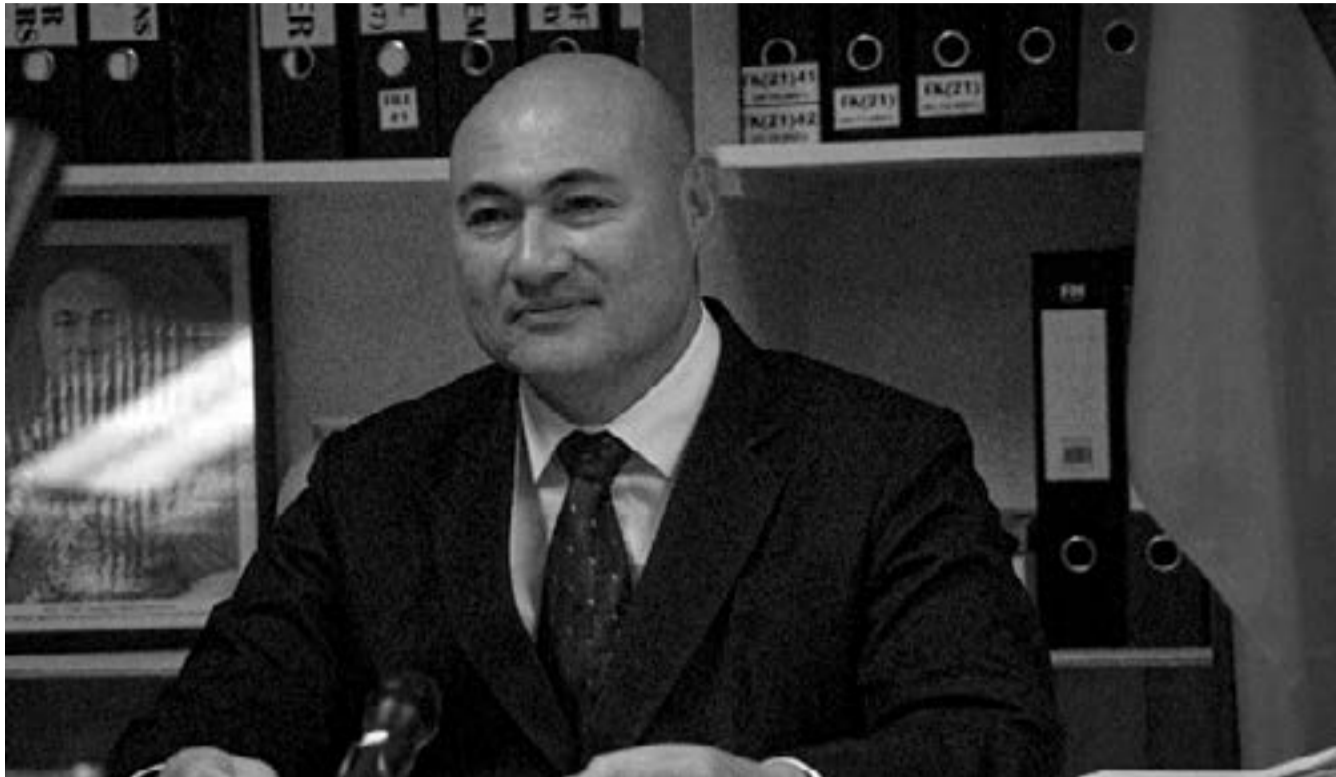
Acting Prime Minister Tuala Tevaga Iosefo Ponifasio