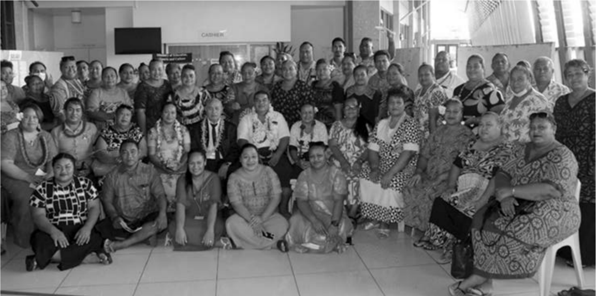
Nisi o Sui mai 'āoga ua lautogia mo lea fa'amanuiaga mai le Mālō e tauala atu i le Matāgaluega o 'Āoga, Ta'aloga ma Aganu'u (M.E.S.C.)