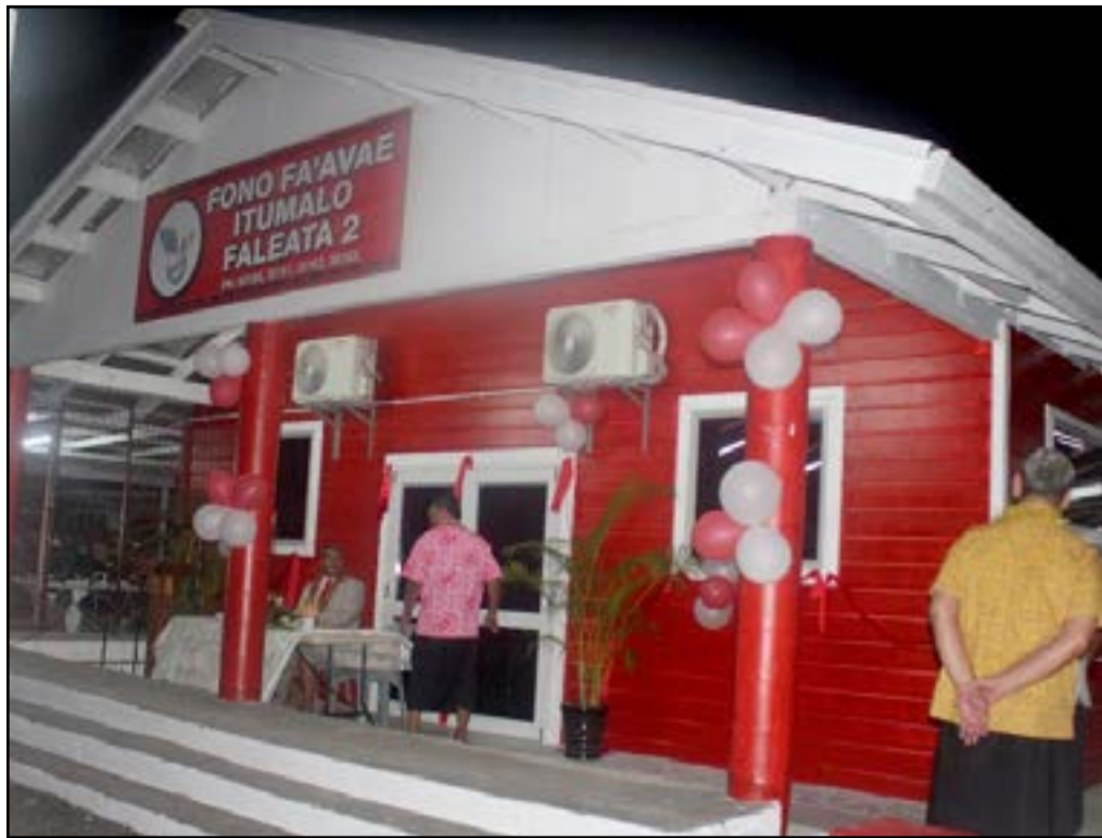
Ofisa Tutotonu o le Fono Fa'avae mo le Itumālō Palota o Faleata #2.