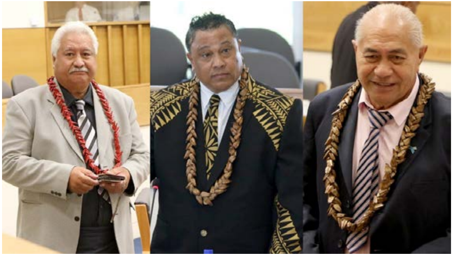
Finagalo fa'aālia o nisi o Faipule o le Palemene e uiga i le gagana Samoa ma le aganu'u fa'aaloalo ina ia tumau le mapo ma le mamalu