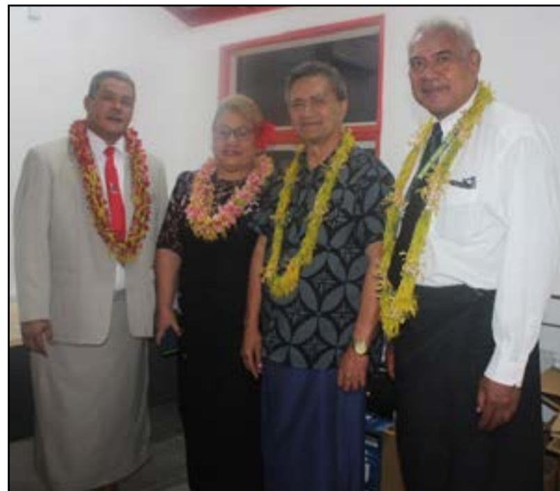
Susuga i le Fa'afeagaiga ma Minisitā o le Kapeneta i le molimauiua o le fa'amoemoe ua tatala āloā'ia