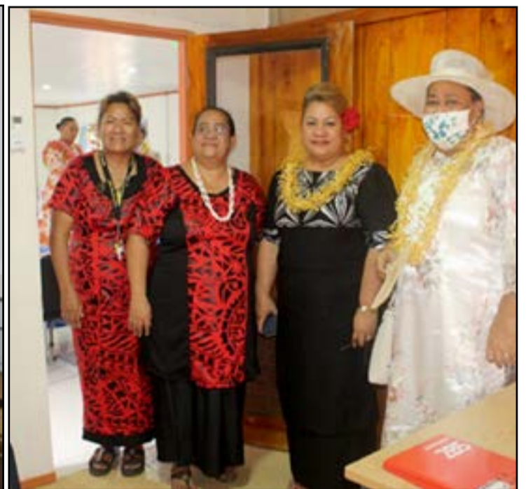
Totonu o le Ofisa Autū o le Itumālō Palota o Sagaga #4