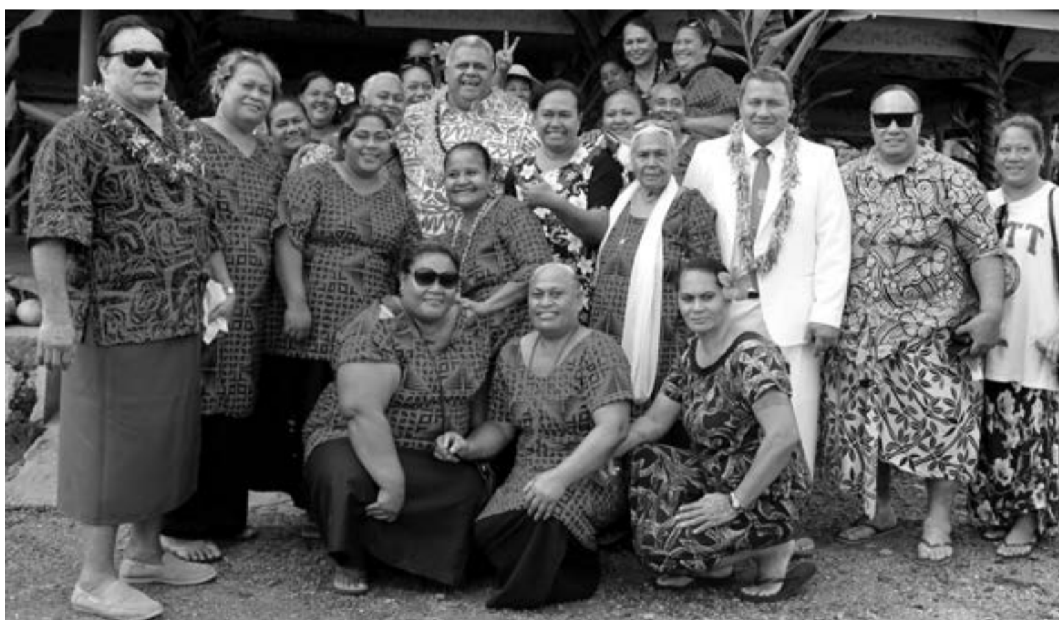
Aleisa i Sisifo

The Aleisa Women's Committee representative relayed their request for improvements