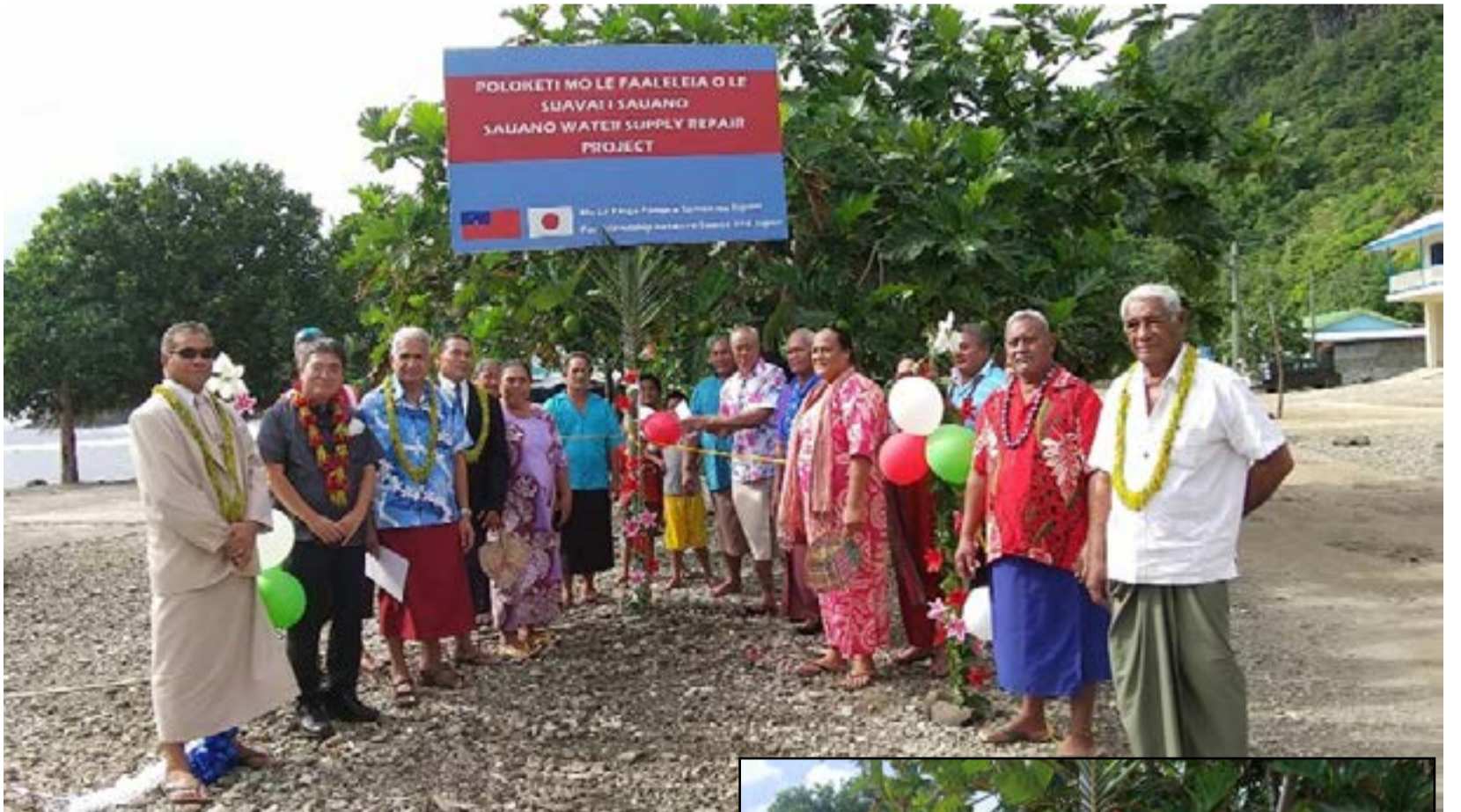
Pāia o le afio'aga o Sauano, Fagaloa ma Sui o le Mālō Iapani

“Sa tuai ona fa'amatu'u mai vaega mo'omia po'o materials mai kamupani ona o nisi o tulaga le