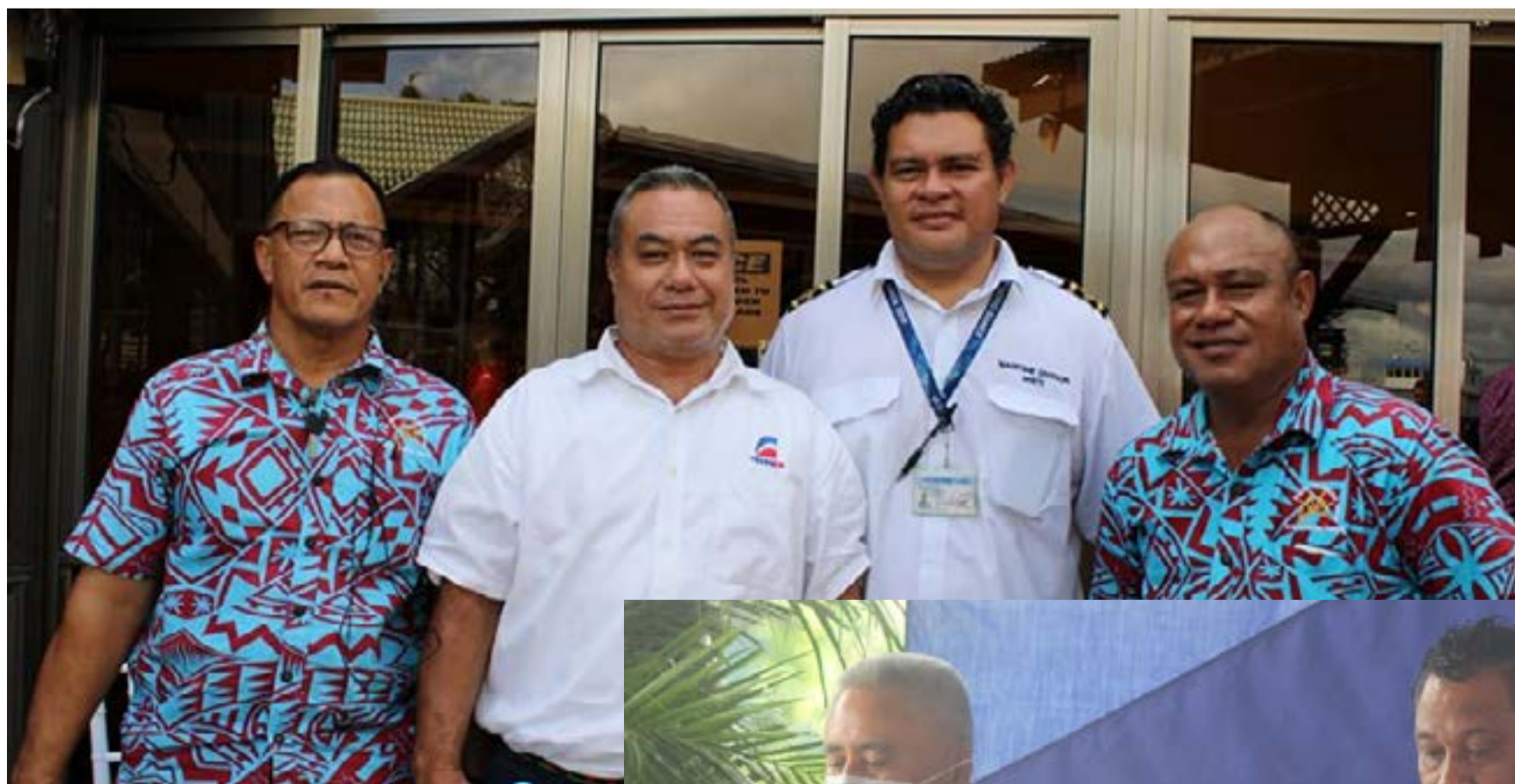
Nisi o tamafanau a le atunu'u o lo'o avea ma ali'i seila.

tua ma galulue i luga o va'a i atunu'u i fafo ma Samoa nei, fa'amālō tautua, mālō galulue."