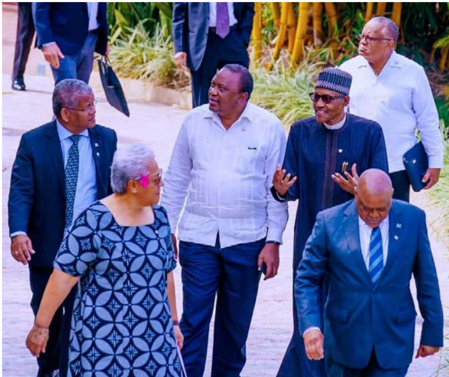
Samoa's Prime Minister Fiame Naomi Mataafa

Before Rawanda last week, the United Kingdom hosted the Commonwealth in 2018, where Samoa’s bid to host the 2024 meeting and presented by former Prime Minister Tuilaepa Sailele Malielegaoi.