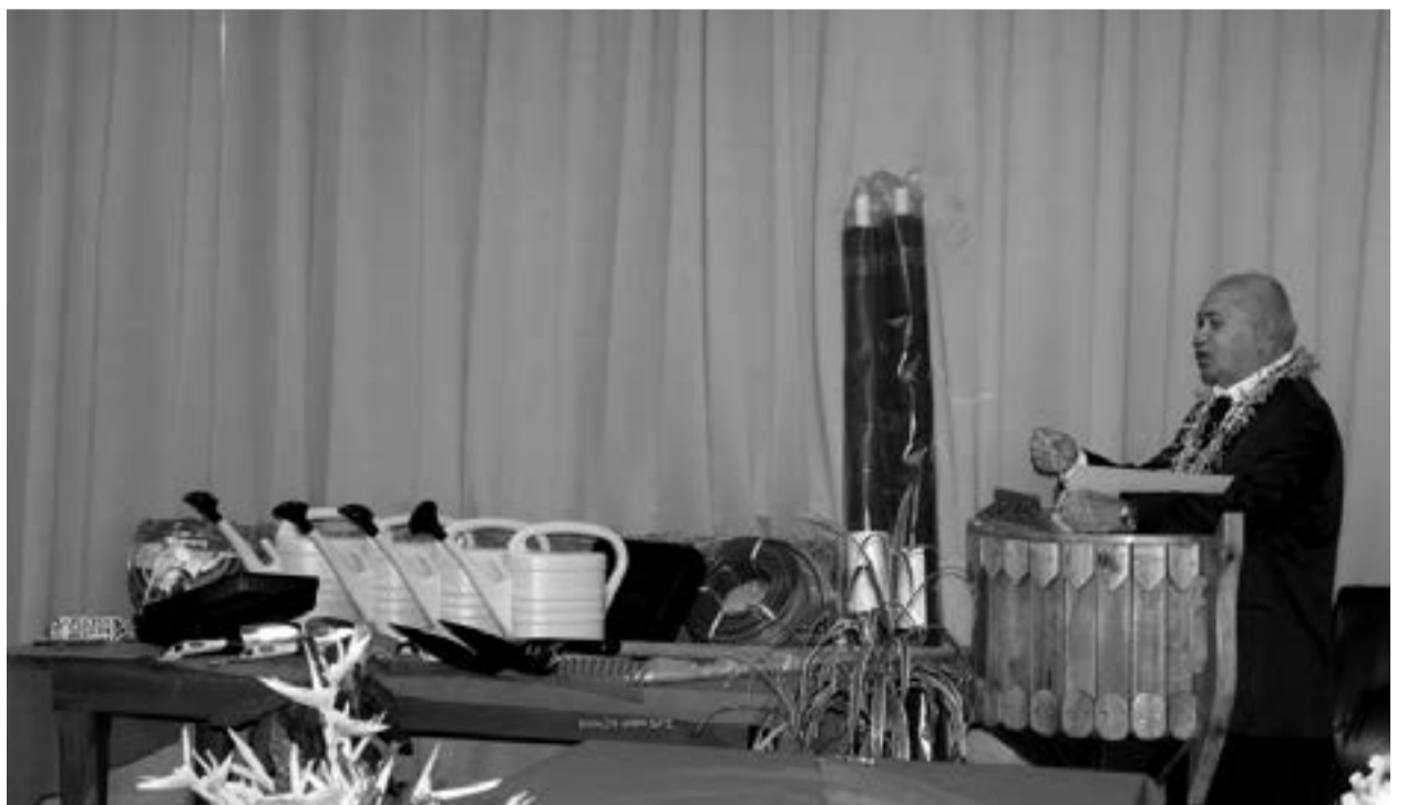
Meafaigaluega mo togālā'au 'āina a nisi o 'āoga e 60 i totonu o le atunu'u ua mafai ona fa'amatu'u atu ai le fesoasoani a le Mālō

O ia 'āoga e 60 o lo'o aofia ai 'āoga i totonu o Upolu ma Savai'i.