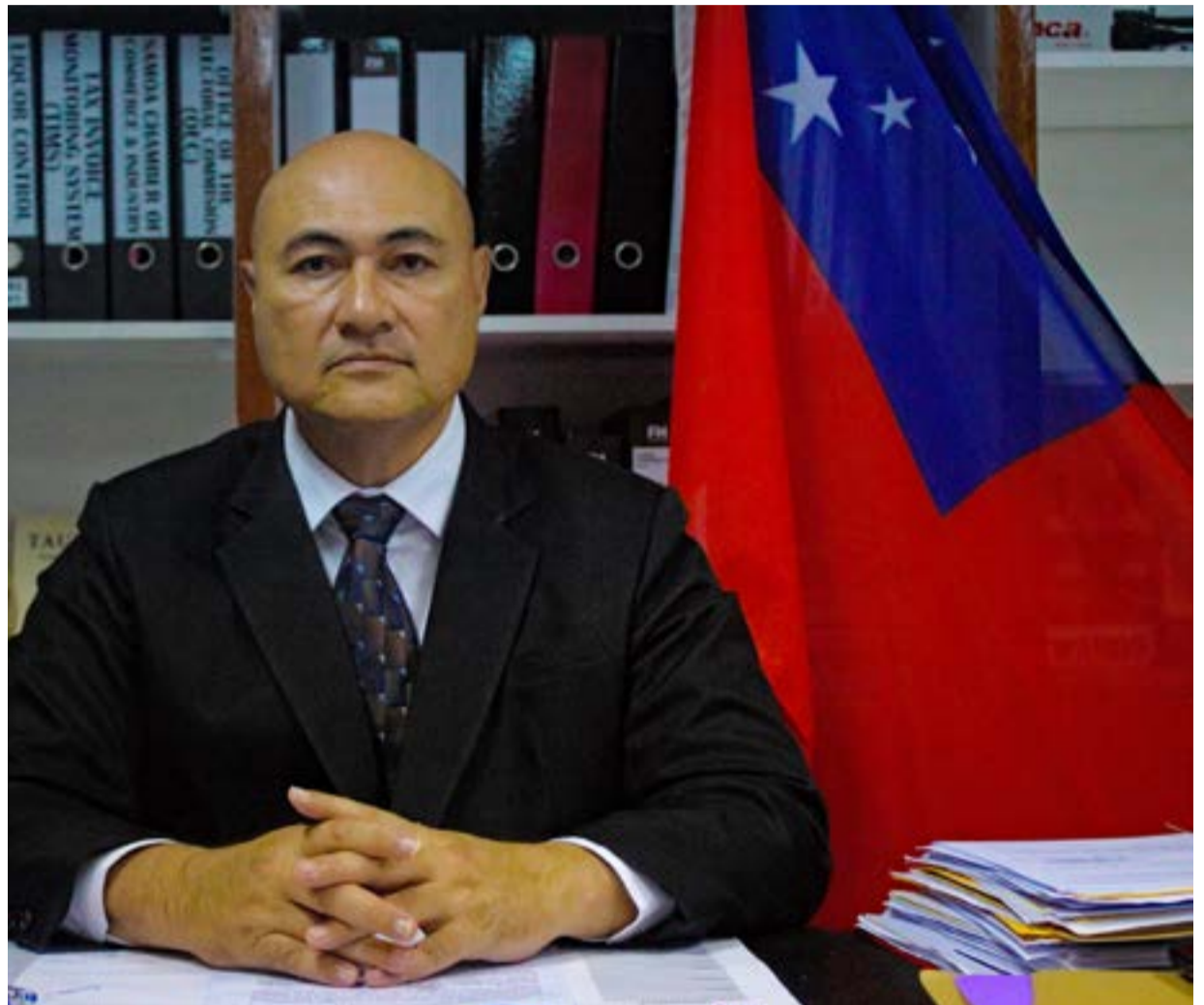
Acting Prime Minister Tuala Tevaga Iosefo Ponifasio