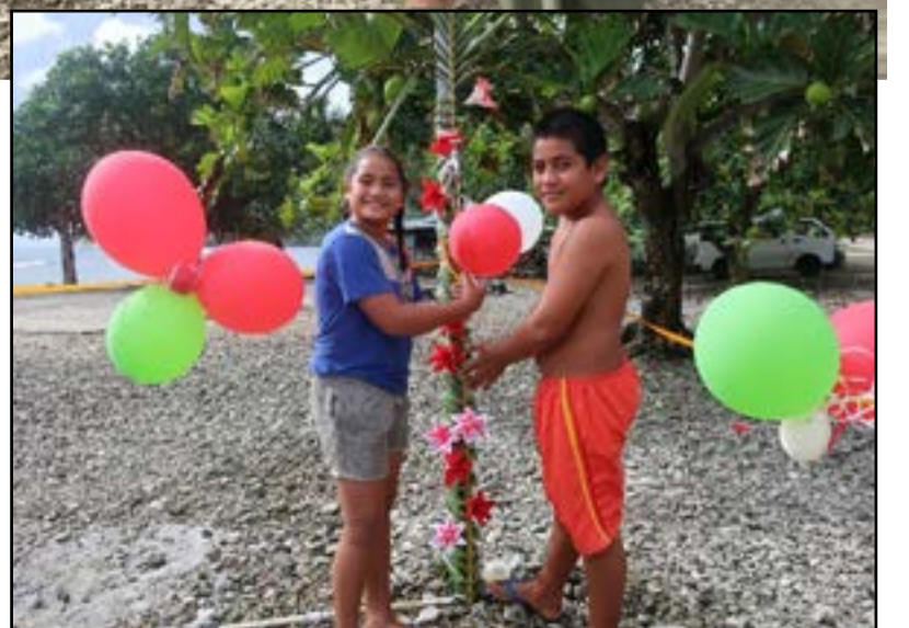
Fanau mai le afio'aga o Sauano, Fagaloa.

E silia ma le 300 le mamalu o le atunu'u o lo'o alala ma pāpā'ao i totonu o Sauano i Fagaloa.