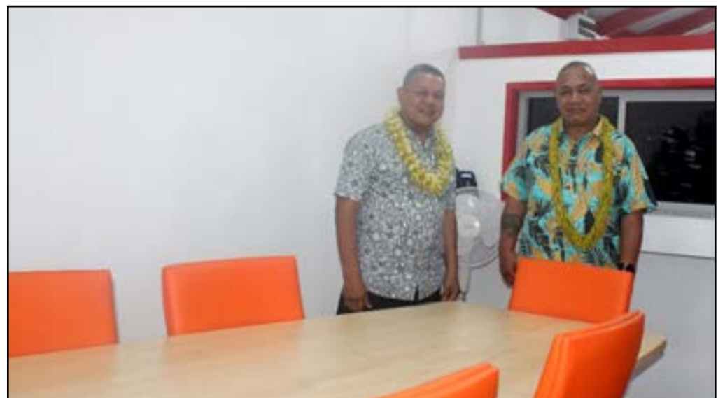
Molimauiua e afioga i Minisitā o le Kapeneta le Ofisa Tutotonu o le Fono Fa'avae mo le Itumālō Palota o Faleata #2

O Komiti fo'i o le a galulue mo le fa'atinoaina o atina'e o Itumālō, o lo'o tofusua uma afio'aga ma o latou sui i totonu o le Komiti.