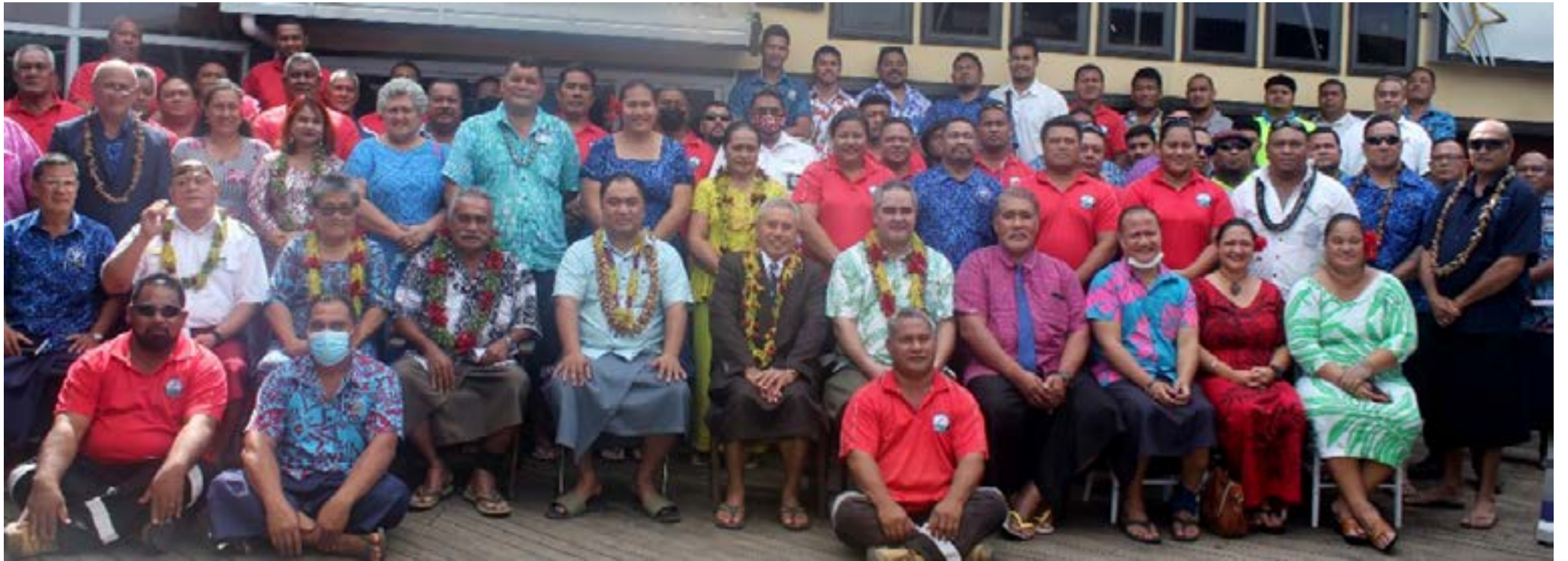
Nisi o tamafanau a le atunu'u ua avea ma ali'i ma tama'ita'i seila o lo'o tautuaina Samoa i lea matātā tāua