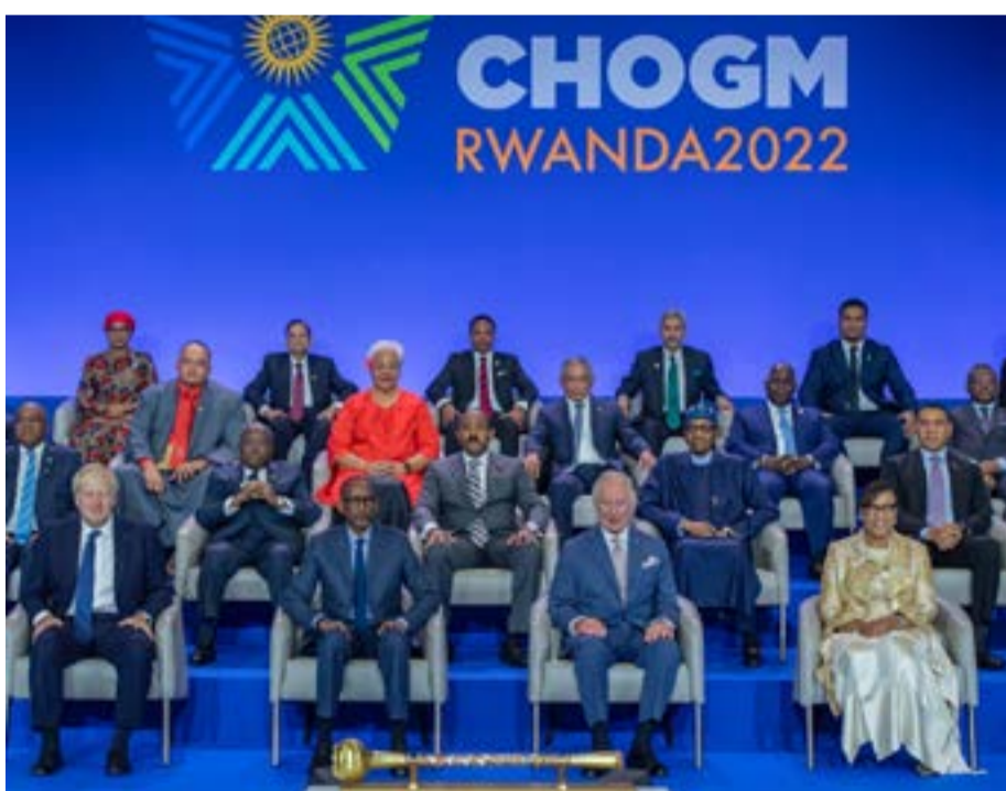
Samoa's Prime Minister Fiame Naomi Mataafa (in red) flanked by her Commonwealth counterparts with the Prince Charles of (second from right front row) at the opening session of the 2022 Commonwealth Head of Government's Meeting in Africa Rawanda earlier this month.