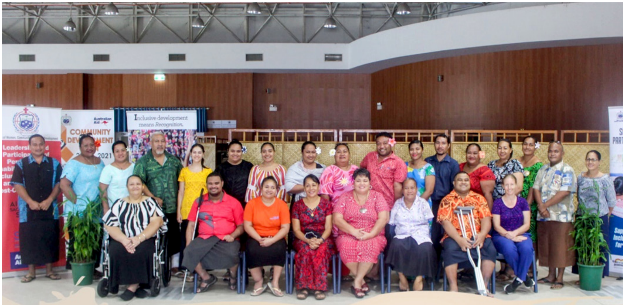
Nisi o i latou e i ai a'afiaga tumau o le soifua ma Sui mai nisi o Fa'alapotopotoga o lo'o patino tonu le latou galuega mo i latou nei fa'apea ai ma Sui o le Matāgaluega o Tinā ma Tama'ita'i, Atina'e o Nu'u ma Agafeso'ota'i.