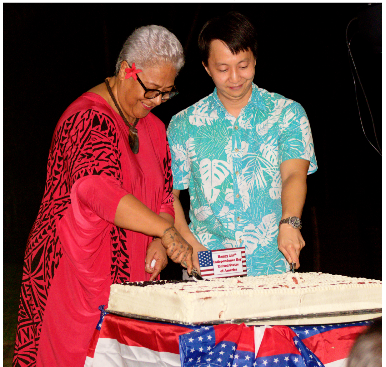
The celebration was held at the US Embassy residence last week.