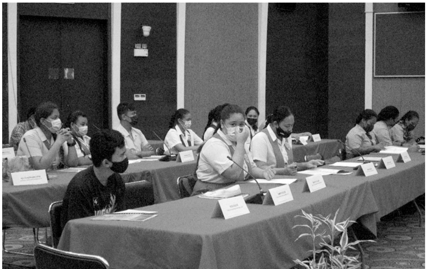
Sa'ili manatu o fanau aga'itonu i o latou aiā fa'a-le-tagata soifua.

Na fesiligia le Komesina po'o i ai se fete'ena'iga i le tulaga o i ai le fa'aleaganu'u ma le matā'upu o lo'o fa'autū ai le fono i aiātatau a le tamaititi?