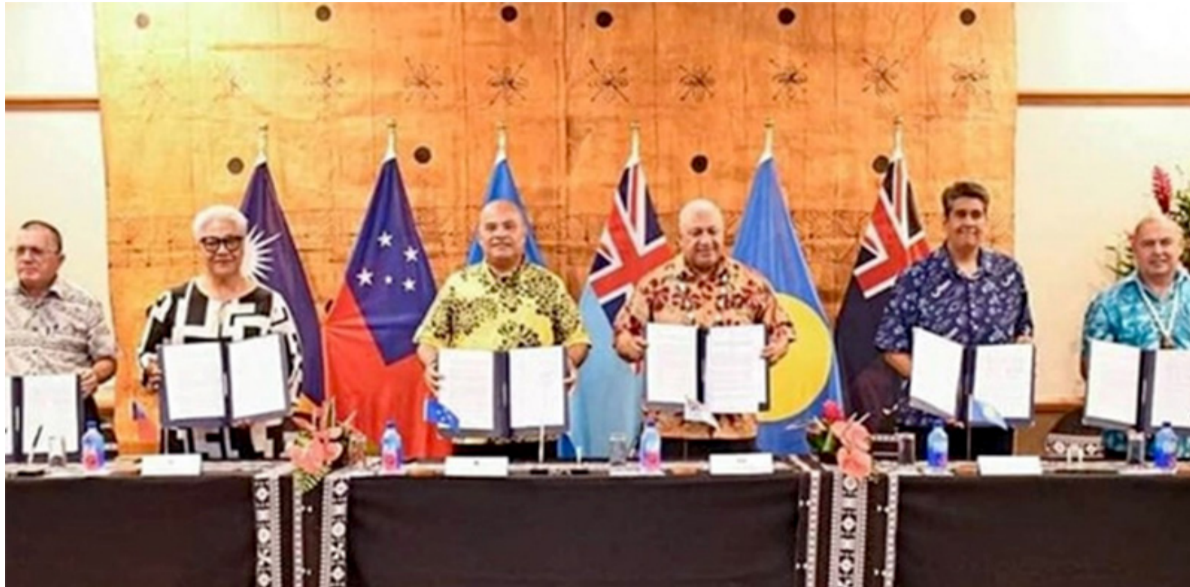
The Suva Agreement was signed by several Pacific nations but did not include Kiribati.

However, Kiribati wasn't part of that pact and now President Taneti Maamau has written a lengthy letter to Mr Puna, declaring that his country cannot sign the Suva agreement and that it will pull out of the forum.