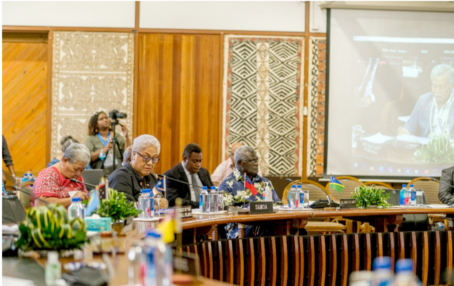
Samoa's Prime Minister Fiame Naomi Mataafa, attending her first Pacific Islands Forum (PIF) leaders meeting in Suva Fiji this week. It's the first face to face brainstorming by the regional leaders after two years due to the COVID 19 pandemic. The PIF Forum comes at a time as the region grapples with a host of issues including the COVID-19 pandemic, climate change and the intensifying US-China rivalry.

Most observers expected the agreement to be endorsed by leaders in Suva this week, allowing Secretary-General Henry Puna to stay in the job while ensuring his replacement would come from Micronesia.