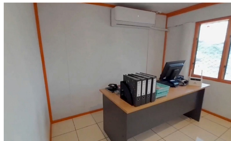
O se va'aiga i totonu o le Ofisa fou o le Fono Fa'avae mo le Itumālō Palota o Aleipata Itupā i Lalo.