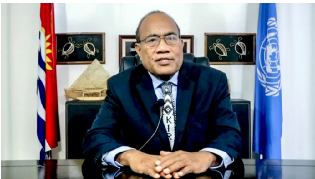
President Taneti Maamau says Kiribati has withdrawn from the Pacific Islands Forum.

The letter was first reported by 1News New Zealand but the ABC has independently confirmed that it is genuine.