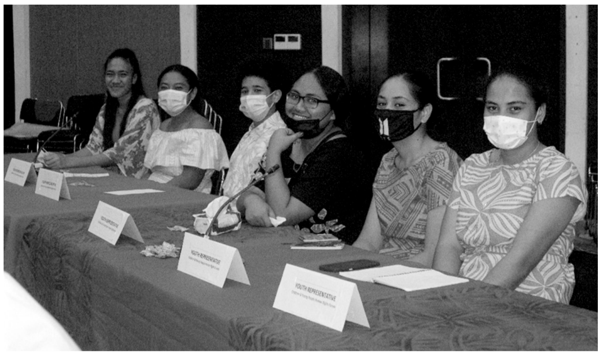
Fanau 'āoga mo nisi o 'āoga i le atunu'u