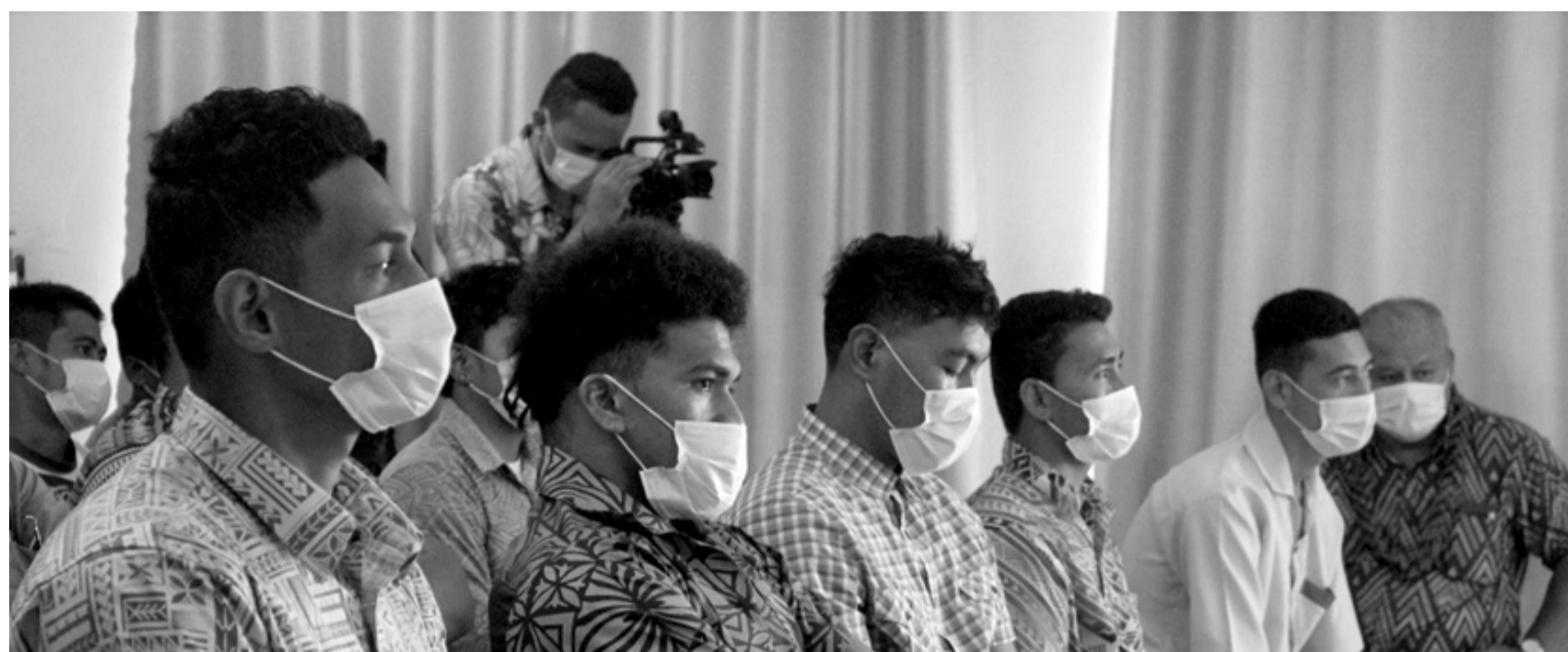
Fanau a le atunu'u ua maua avanoa faigaluega i va'ameli ma va'a la'uoloa i atunu'u i fafo

O ia avanoa faigaluega, o se fesoasoani tele i le tamā'āiga o Samoa aemaise le tausiga o 'āiga ma le tautuaina o nu'u ma ekalesia.