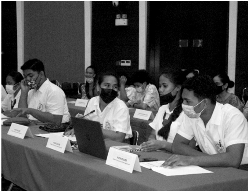
Fa'atāua le aiā fa'a-le-tagata soifua o fanau e 'ā'o'oga ai ma sa'ili ai o latou lunana'i manuia