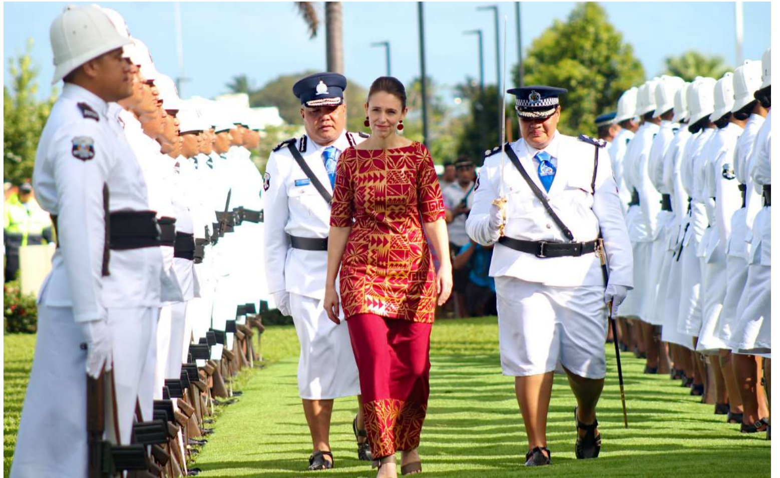
Samoa Guard of Honour & Flag Raising Ceremony on the official visit of Rt. Hon Jacinda Ardern, Prime Minister of New Zealand to Samoa - 02 Aug 2022 - In front of the FMFMII Building, 'Ele'ele Fou.

"That's an area we are pleased to work alongside you in that area of redevelopment," she said.