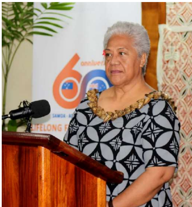
Prime Minister Fiame Naomi Mataafa

No doubt this visit will carve permanence in our minds on the significance of the Treaty of Friendship.