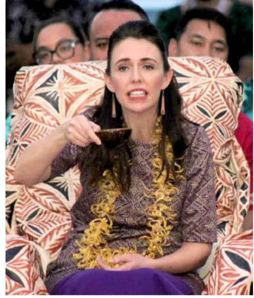
Prime Minister Jacinda Ardern during the cultural Ava Ceremony to welcome her and delegation to Samoa Monday this week.

“Our friendship with its long history that has included bloodshed, pain, reconciliation and progress will always be defined by our people standing before you today with the daughter of the first signatory of the treaty of friendship on behalf of Samoa alongside the New Zealand delegation which includes two Minister of Samoan descent,” – NZ PRIME MINISTER JACINDA ARDERN