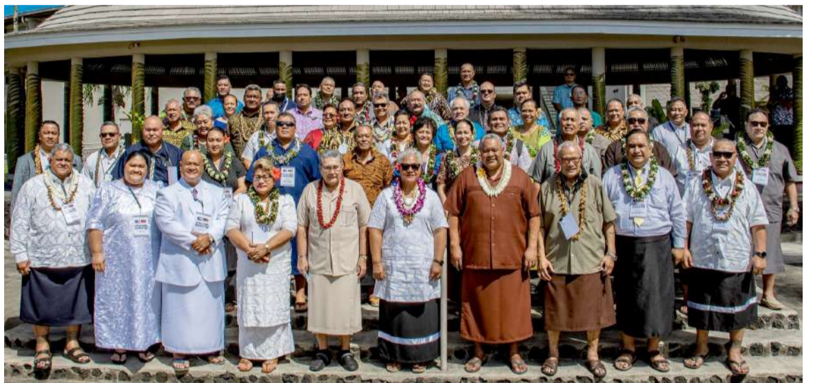
Sui o Samoa ma Tutuila ma Manu'a.