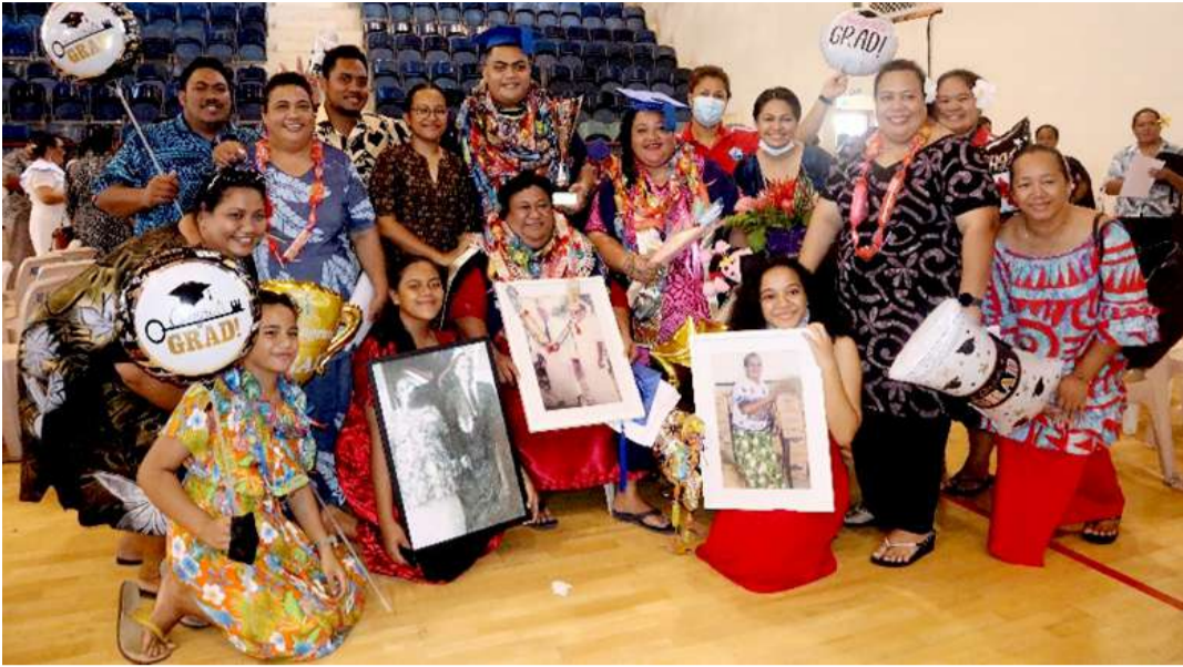
E suamalie le fa'amaoni