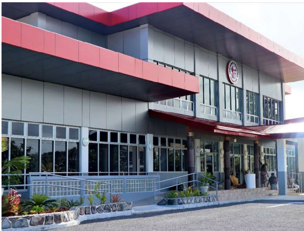
The new SNPF branch in Savaii.