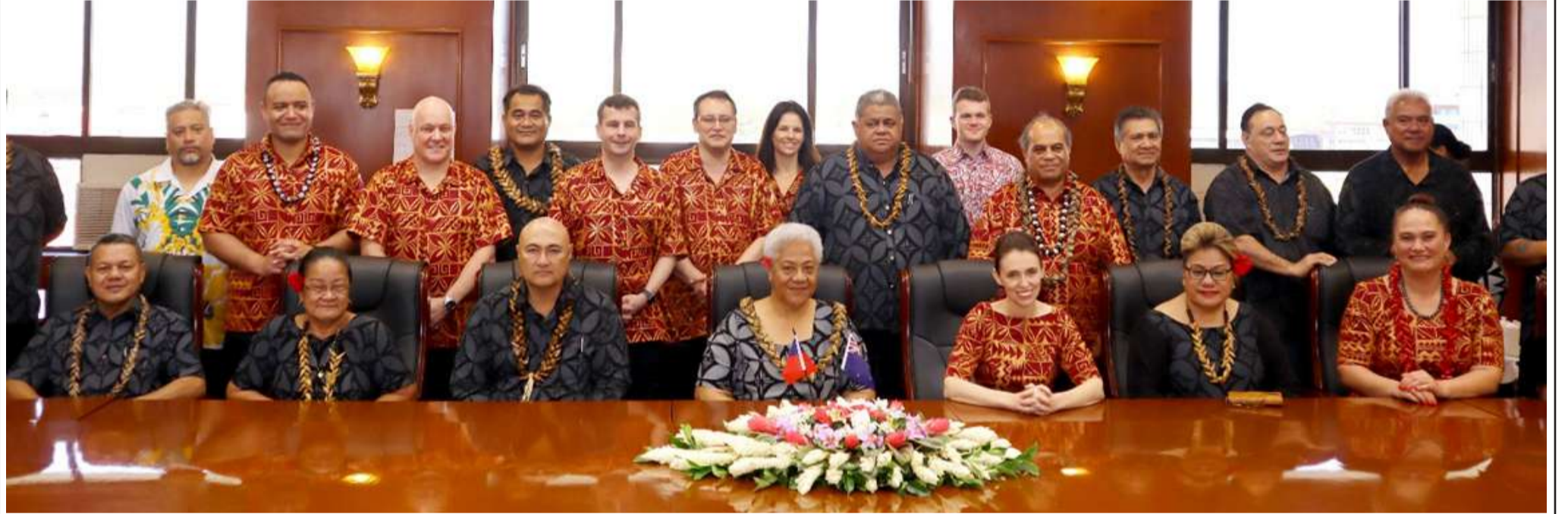
Government leaders from New Zealand and Samoa at the conclusion of closed door talks in Apia this week.