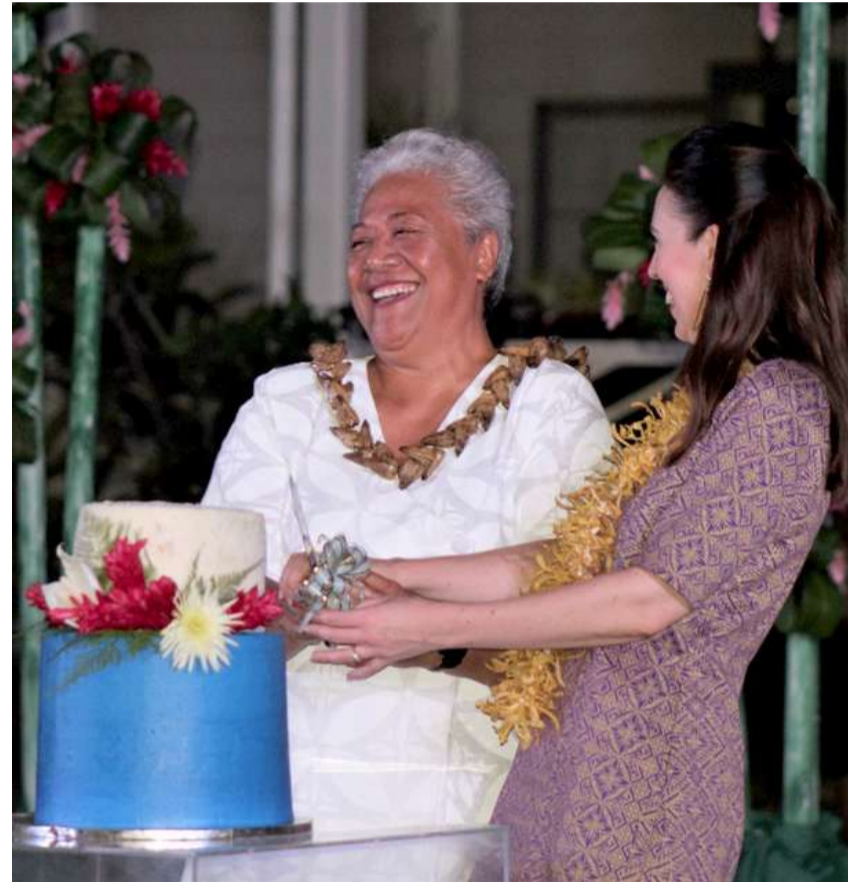
Kipiina o le keke e Palemia o Samoa ma Niu Sila e fa'amanatu ai le 60 tausaga o le faigāuō mamae a Mālō e lua.

O nei matā'upu o le tuliloaina sona taunu'uga ma le tulaga ua o'o i ai i le isi fonotaga o le a soso'o ai i le masina o Setema o le tausaga nei 2022.