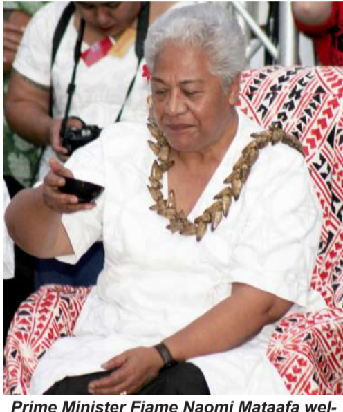
Prime Minister Fiame Naomi Mataafa welcoming her New Zealand counterpart Prime Minister Jacinda Ardern during the traditional Ava Ceremony Monday evening.

“I am confident that our unique friendship will continue to expand and deepen and we recommit ourselves to walk together whatever parts the future, may hold for us both as friends and neighbors in our home and in the Blue Pacific continent.”- PM FIAME NAOMI MATAAFA