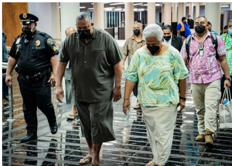
American Samoa Governor Lemanu Palepoi Sialega Mauga (left) and Prime Minister Fiame Naomi Mataafa (right)

The name change proposal tabled by American Samoa Governor Lemanu Peleti Mauga and his Administration during the talks in the territory from July 27th -29th was unanimously endorsed by Prime Minister Fiame leading Samoa’s delegation.