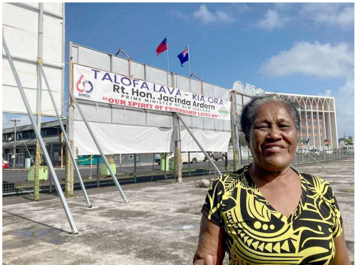
The return of the iconic Savalalo Flea Market

Aside from the bi-lateral talks between the two leaders, Prime Minister Ardern accepted Samoa's invitation to attend as the Guest of Honor in a joint celebrating marking the 60th anniversary of the Treaty of Friendship between the two countries and opening of Samoa's borders.