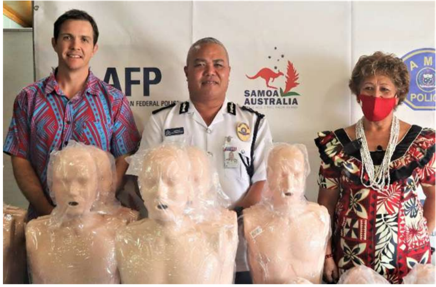
Taulimaina e le Matāgaluega o Leoleo, Falepui-pui ma le Ola Toefuata'ina le fesoasoani a le Ofisa o le Koluse Mūmu ma le Mālō Ausetalia e ala i le a'oa'oga tau fesoasoani muamua mo le aufaigaluega ae fa'apea ai i meafaigaluega e fa'aōga mo le auaunaga