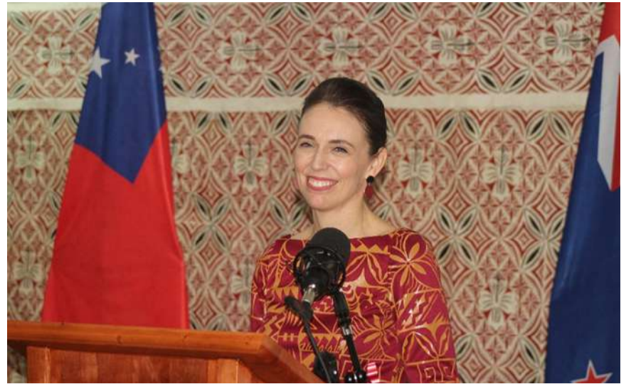
Palemia o Niu Sila iā Jacinda Adern.

E lua aso o lea malaga fa'apitoa i Samoa nei.