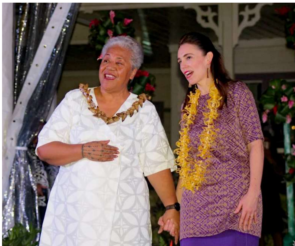
(Left - Right) Prime Minister of Samoa Fiamē Naomi Mata'afa and Prime Minister of New Zealand Jacinda Ardern.

"I think it's good to be here showing the Samoan government and people that across our political spectrum, we're here in friendship," he