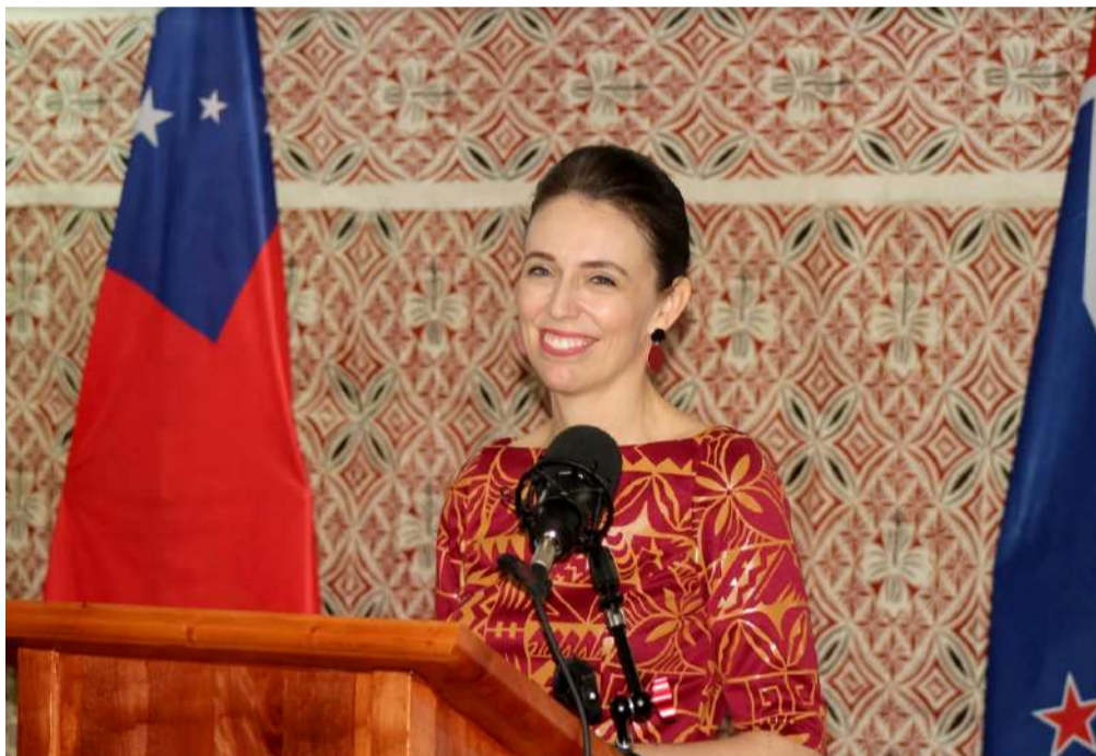
Prime Minister of New Zealand Jacinda Ardern at a Press Conference in Samoa on Tuesday.