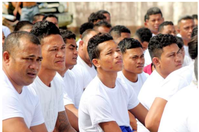
Members of Parliament, and members of the Diplomatic Corps attended the celebration