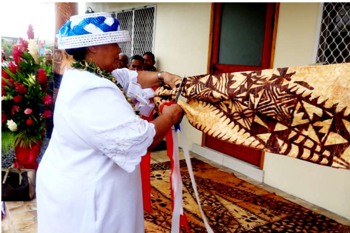
'O'tiina o le Lipine e le Faletua o le Fa'afeagaiga e tatala alo'ia ai lenei galuega täua.