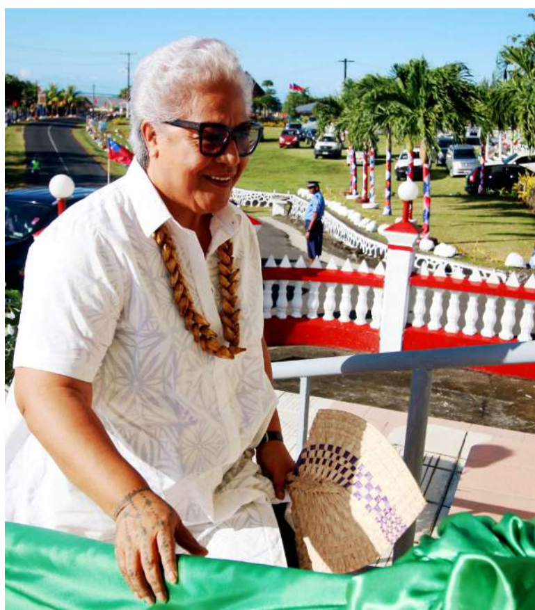
Afioga i le Palemia, Fiamē Naomi Mataafa.