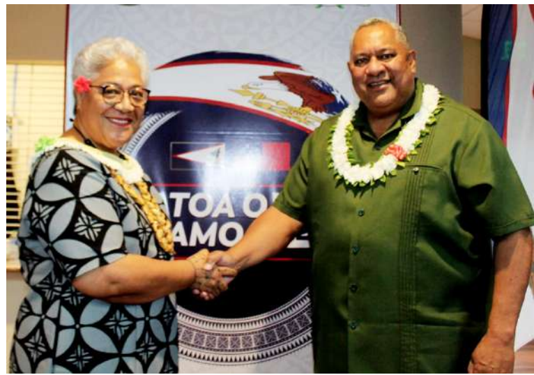
ATOA O SAMOA EXECUTIVE MEETING 2022- Prime Minister Fiame Naomi Mataafa with American Samoa Governor Lemanu Peleti Mauga.

Many of them have been mobilized to assist with displaced villagers and guarantee the safety of all evacuees," said Lemanu in his Executive Order.