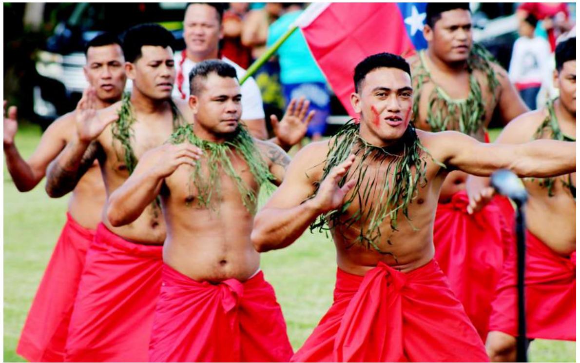
Fa'afiafiaga a nisi o alo o le atunu'u o lo'o galulue i galuega fa'avaitaimi i atunu'u i fafo.

"E talitonu, o se fa'ata'ita'iga sili lea mo nisi o afio'aga ma vaega o lo'o tapenaina polokalame mo galuega fa'avaitaimi i atunu'u e mamao. E le'o toe po le silafia i mea o tutupu ma aliali mai i ia atunu'u,