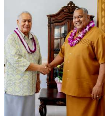
Lana Afioga i le Ao o le Mālō Samoa iā Tuimaleali'ifano Va'aletoa Sualauvī II ma le afioga i le Kovana o Amerika Samoa iā Lemanu Peleti S. Mauga