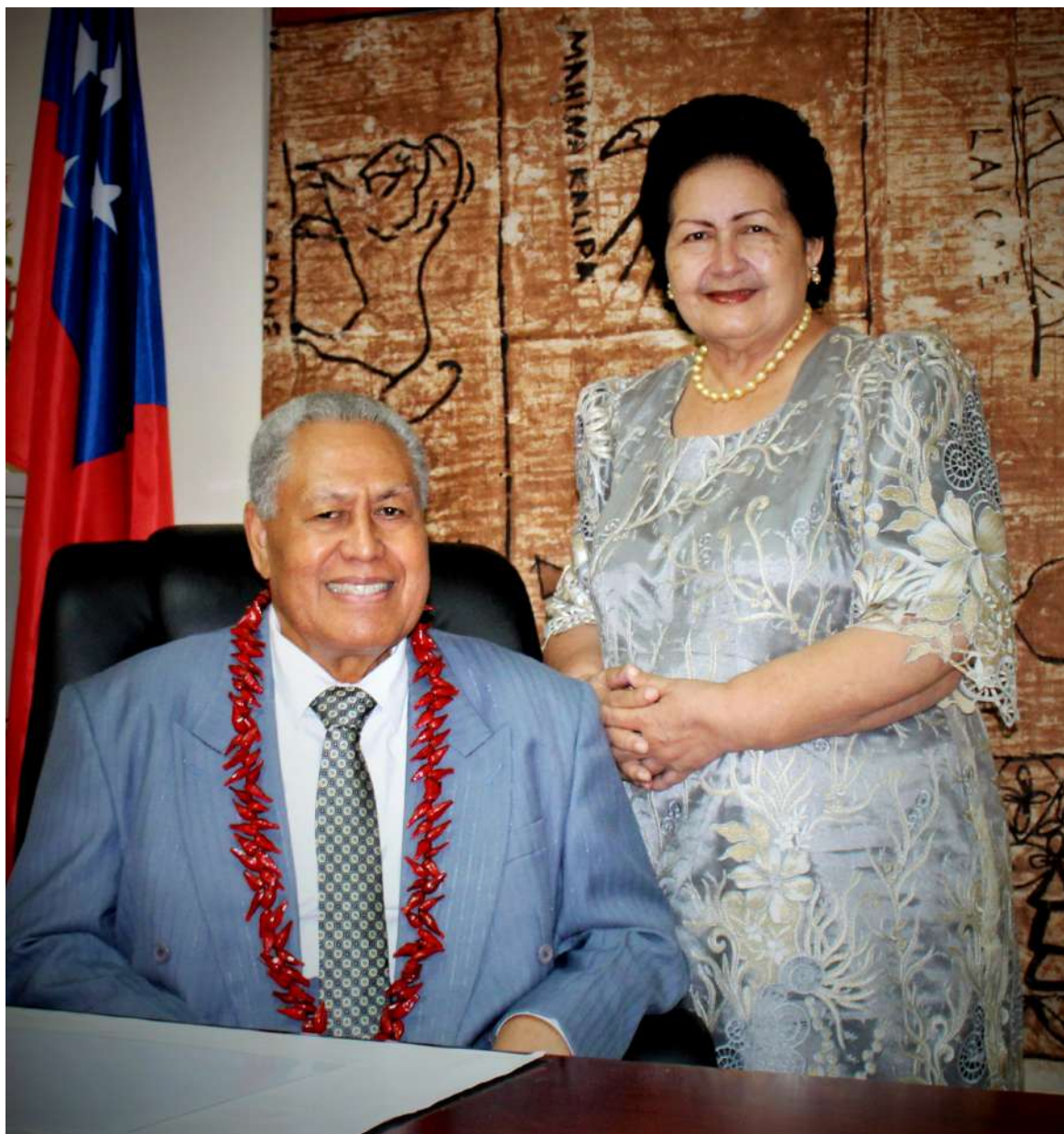
Afiga i le Tui Ā'ana Tuimaleali'ifano Va'aletoa Sualauvī II ma lana Masiofo.

manino ai o so'o se tasi o lo'o i ai agava'a mana'omia, e mafai ona ia tau'aveina tofiga o le Ao o le Mālō, peita'i pe a toe tepa i tua i 'ai latou ua pale mai lenei tofiga, ona manino ai lea, le mauāluga o le fa'aeaea a Samoa aoao iā latou Tama a 'Āiga.