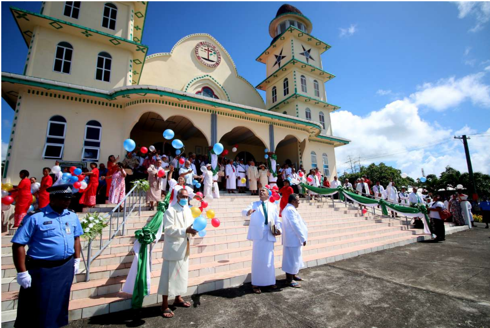
Malumalu tapua'i E.F.K.S. i Sapapāli'i