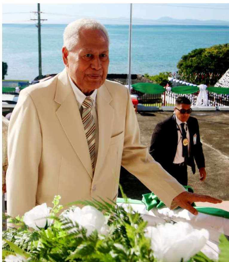
Ao o le Mālō, Afioga i le Tui Ā'ana Tuimaleali'ifano Va'aletoa Sualauvī II.