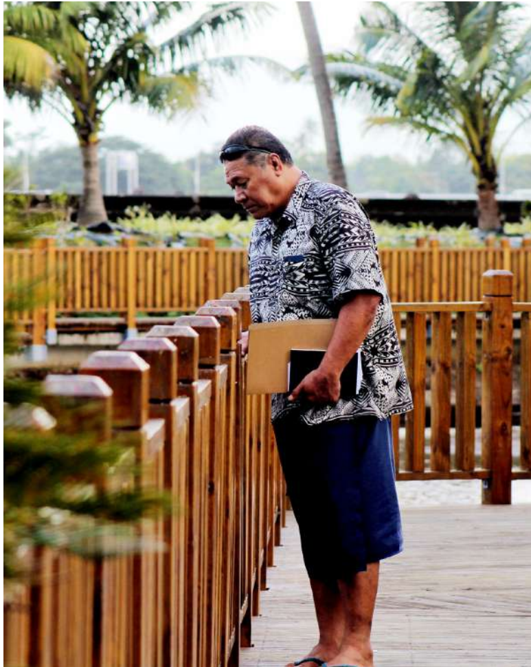
Matagalalua Friendship Park.