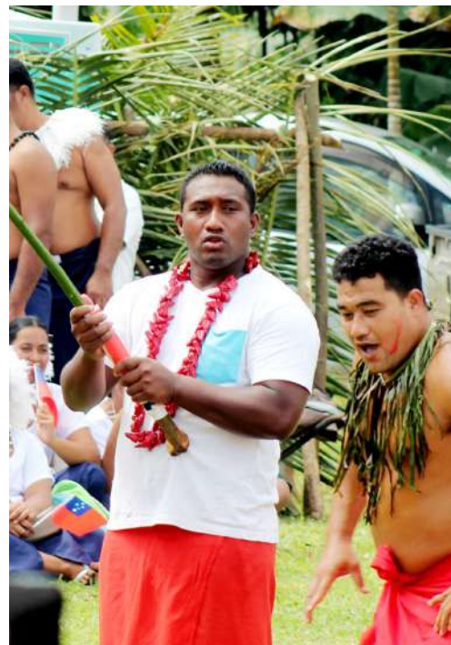
The Poutasi Development Trust Committee held a Falealili Seasonal Workers Programme Open Day on Friday