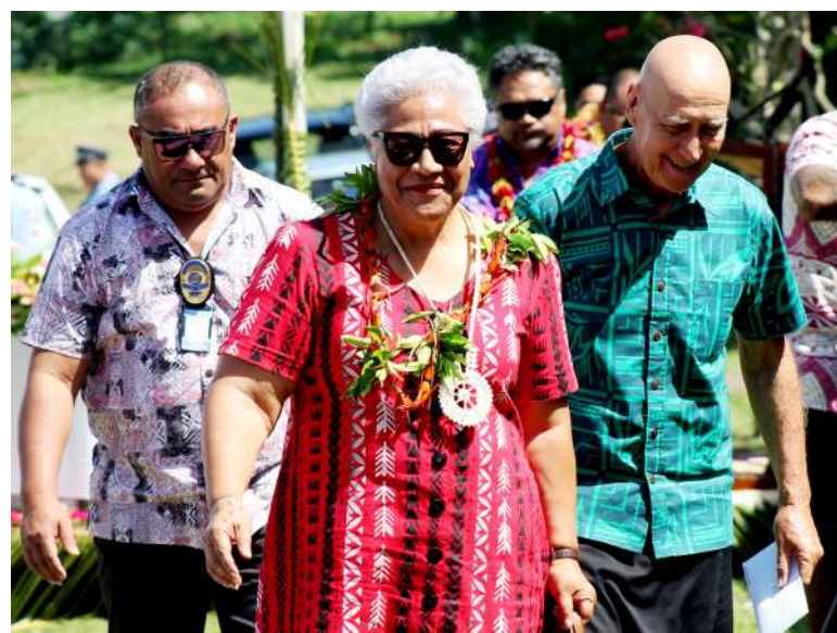
Afioga i le Palemia, Fiame Naomi Mataafa.

e mafua mai i le fa'atuatua'ia i tapenaga lelei.