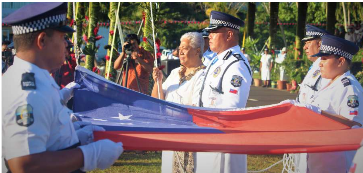
Sisiina a'e o le tagāvai o le Mālō Tuto'atasi o Samoa i le atoa ai o lona 60 tausaga i le tausaga nei 2022.

O le Aso Lua, 06 Setema 2022, o le a faia ai fa'afiafiaga ma nisi o savali fa'aaloalo i Savai'i mo le