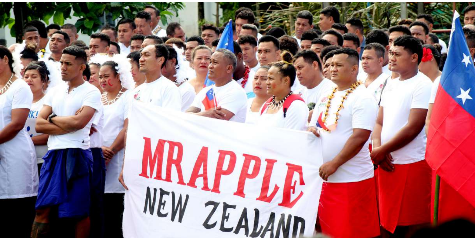
Nisi o alo o le atunu'u o lo'o galulue i galuega fa'avaitaimi i atunu'u i Niu Sila.

"E momoli lava le fa'amälö i lenei afio'aga o Poutasi ona o la outou lagolago ua saga mautü ai lenei fa'amoemoe. E fa'amälö i alo ma fanau o lo'o autova'a atu i lenei polokalame, ona o le usitā'ia o aiaiga ma tulaga uma ua mafai ai pea ona agava'a Falealili e fa'aauu."