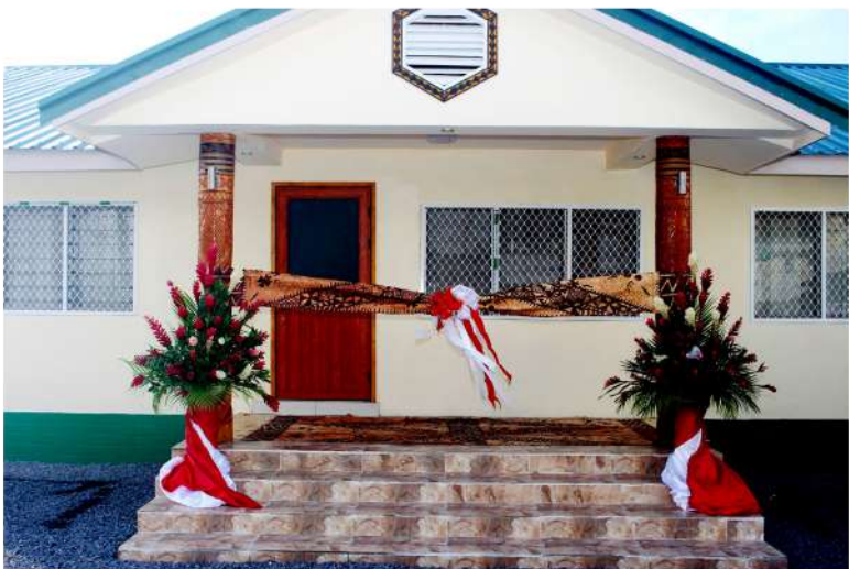
Ofisa o le Fono Fa'avae mo le Itumälö Palota o Fa'asaleleaga #3.