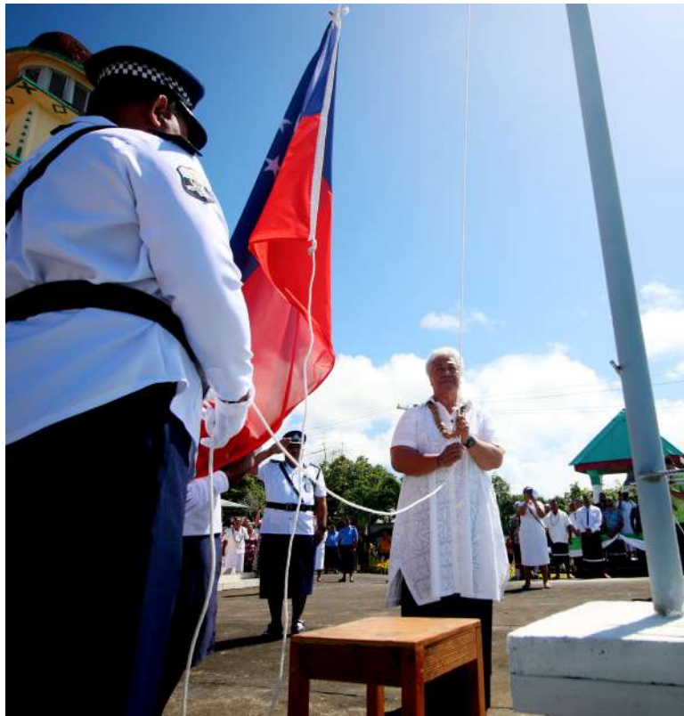
Sisiina o le tagāvai o le Mālō Tuto'atasi o Samoa e le afioga i le Palemia, Fiamē Naomi Mataafa i Sapapāli'i, Savai'i

“A ua tutusa fola, ma matalua le seuga i lenei tausaga, auā le fa'amanatuina o le 60 tausaga o lo