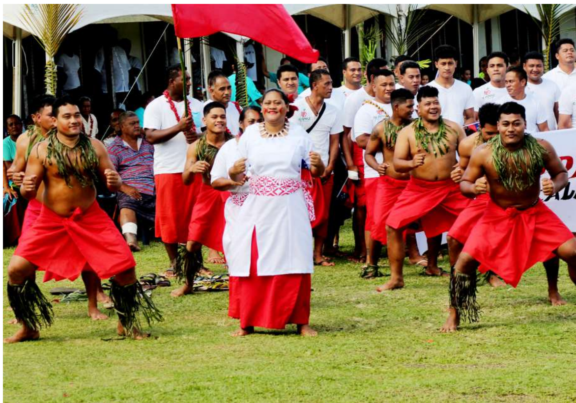
Falealili celebrated 15 years of the Falealili Seasonal Workers Programme on Friday