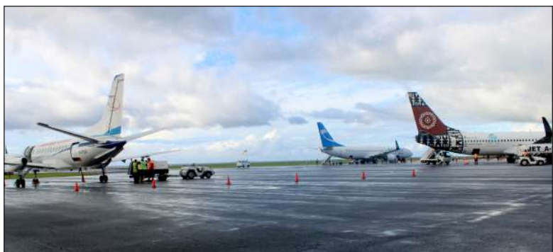
FLIGHTS GALORE: The Air strip at Faleolo International Airport will once again be bustling with abundant air travel as Samoa slowly returns to normal after her Borders officially opened in August this year.

This will allow the parties to tie up loose ends to pave the Faleolo International Airport's runway for the return of Virgin Australia.