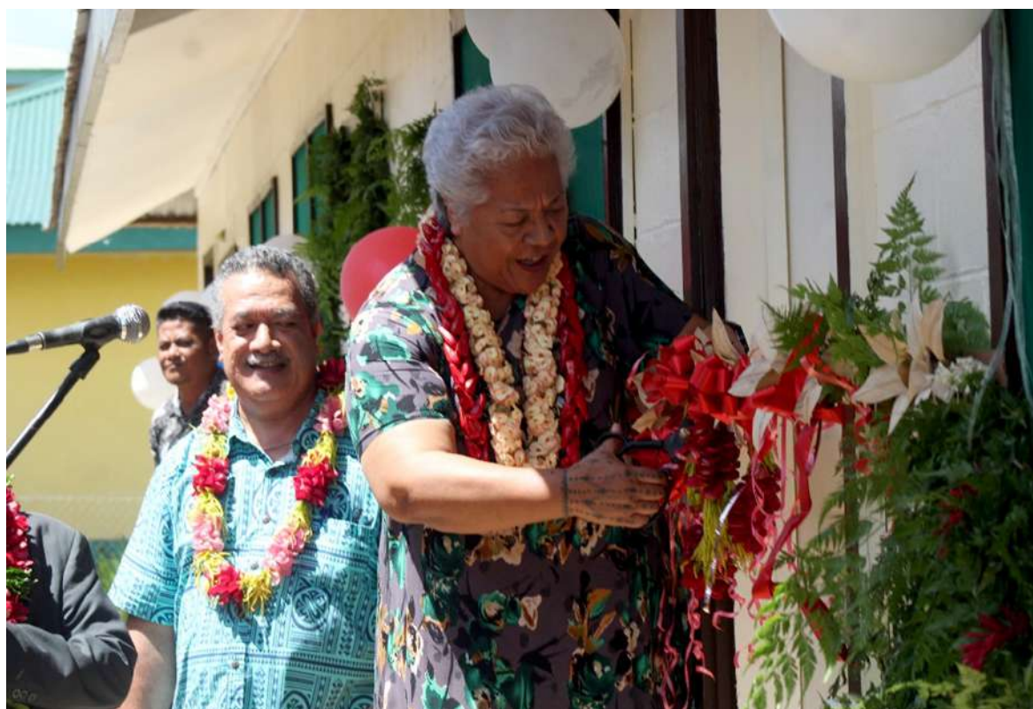
'O'otiina o le Lipine e tatala aloāia ai le Ofisa fou o le Fono Fa'avae mo le Itumālō Palota o Lotofaga, o le Itumālō lea o le afioga i le Palemia, Fiame Naomi Mataafa

"Manatu e fa'apenā se lagona i lenei aso. Fa'amālō le galue!