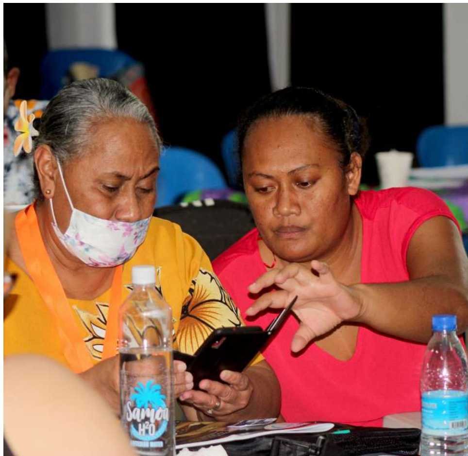
The Pacific Society for Reproductive Health Conference is currently being held in Samoa from August 30 to September 2

She said when you have family planning and sexual reproductive health in place then the economy, country will thrive, less gender-based violence, less teenage