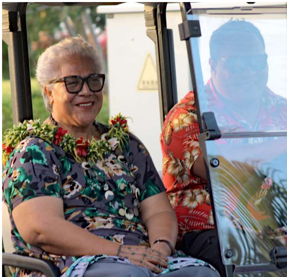
Afioga i le Palemia o Samoa, Fiamē Naomi Mataafa i le molimauina o le tatala ai o le Matagialalua Friendship Park i le 'Ele'ele Fou

fa'amausalī ai mafutaga fa'ale'āiga i se si'osi'omaga fiafia ma le matagofie. Ou te talitonu ua talafeagai tele le tatalaina o lenei atina'e tāua e fa'aopoopo i le polokalame mo le fa'amanatuina o le Tuto'atasi aemaise o le toe tatalaina o tatou tuāoi mo femalaga'iga. Ua o gatasi fo'i lenei galuega ma vaega ua mae'a i lumā maota o le Maota o le Mālō lea na fa'atupeina e le Mālō Niu Sila.