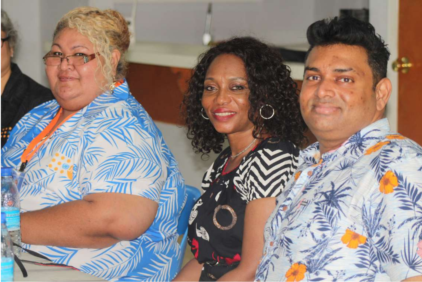
The Pacific Society for Reproductive Health held a workshop at the National University of Samoa on Wednesday