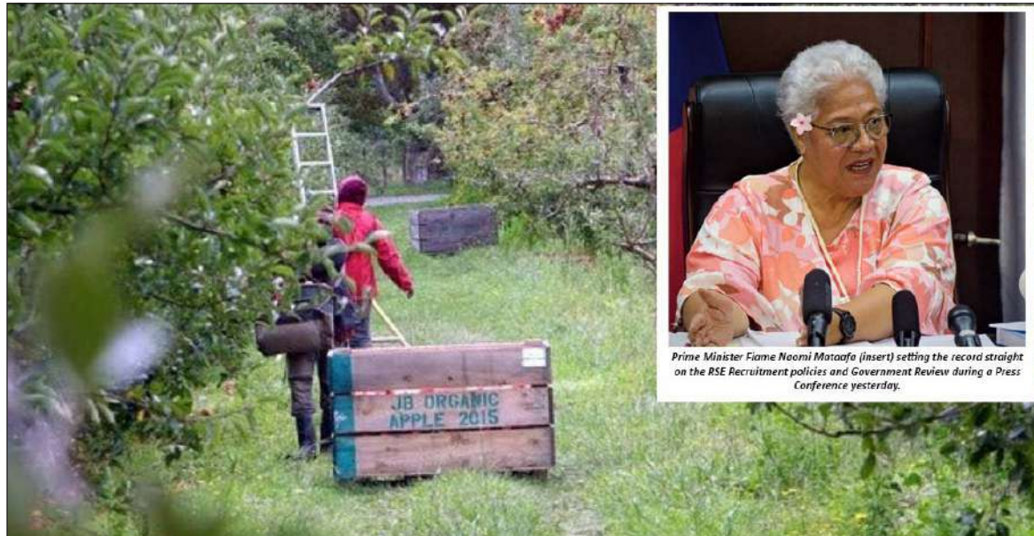
Prime Minister Fiame Naomi Mataafa (insert) setting the record straight on the RSE Recruitment policies and Government Review during a Press Conference yesterday.