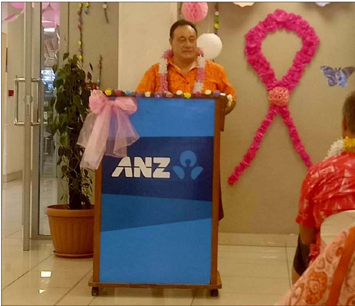
Minister of Health Valasi Tafito Selesele