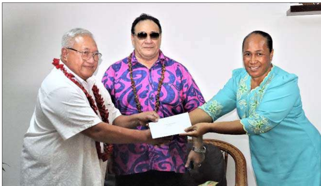
Foa'i e $10,000 a le Au Uso Fealofani a le Ekalesia Metotisi mo le Mālō e ala i le auunaga a le Fa'alapotopotoga Fa'avae Tau Fatuga'o

"E talitonu ua na'o le Atua na te toe fa'atutumu mea ua