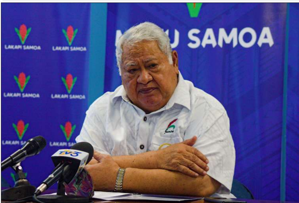
Lakapi Samoa Chairman Tuilaepa Dr Sailele Malielegaoi