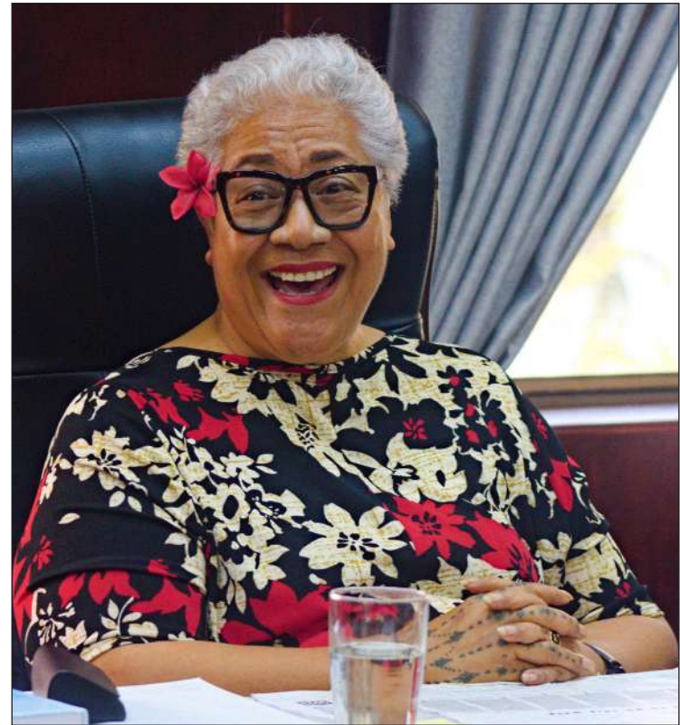
Prime Minister Fiame Naomi Mataafa

She ended her address by thanking all the teachers for their service, and expressed God's blessings upon all areas of the teaching fraternity and those working for its improvement.