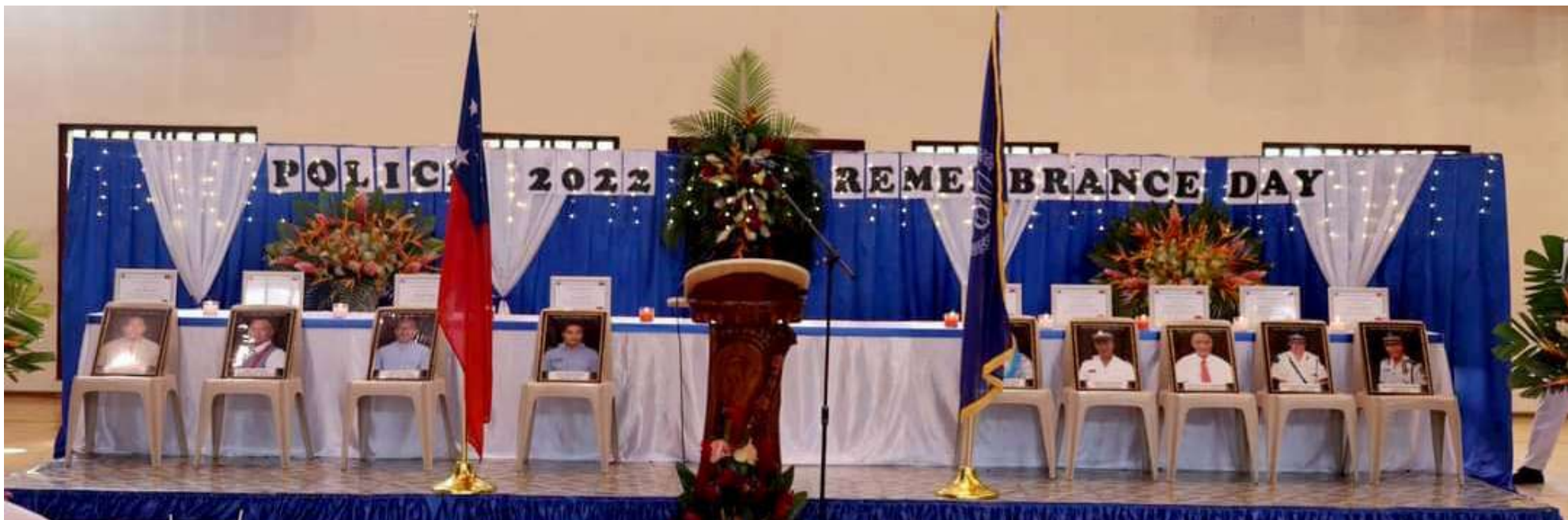
The programme was held at the National University of Samoa Gymnasium