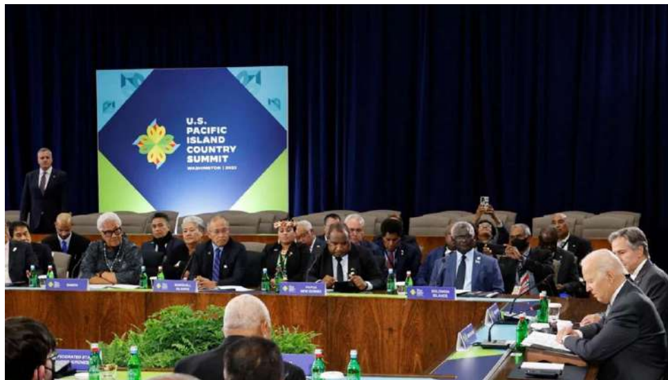
Prime Minister Fiame Naomi Mataafa (second from left) at the US-Pacific Summit.

• Samoa also seeks greater economic development especially in the wake of the