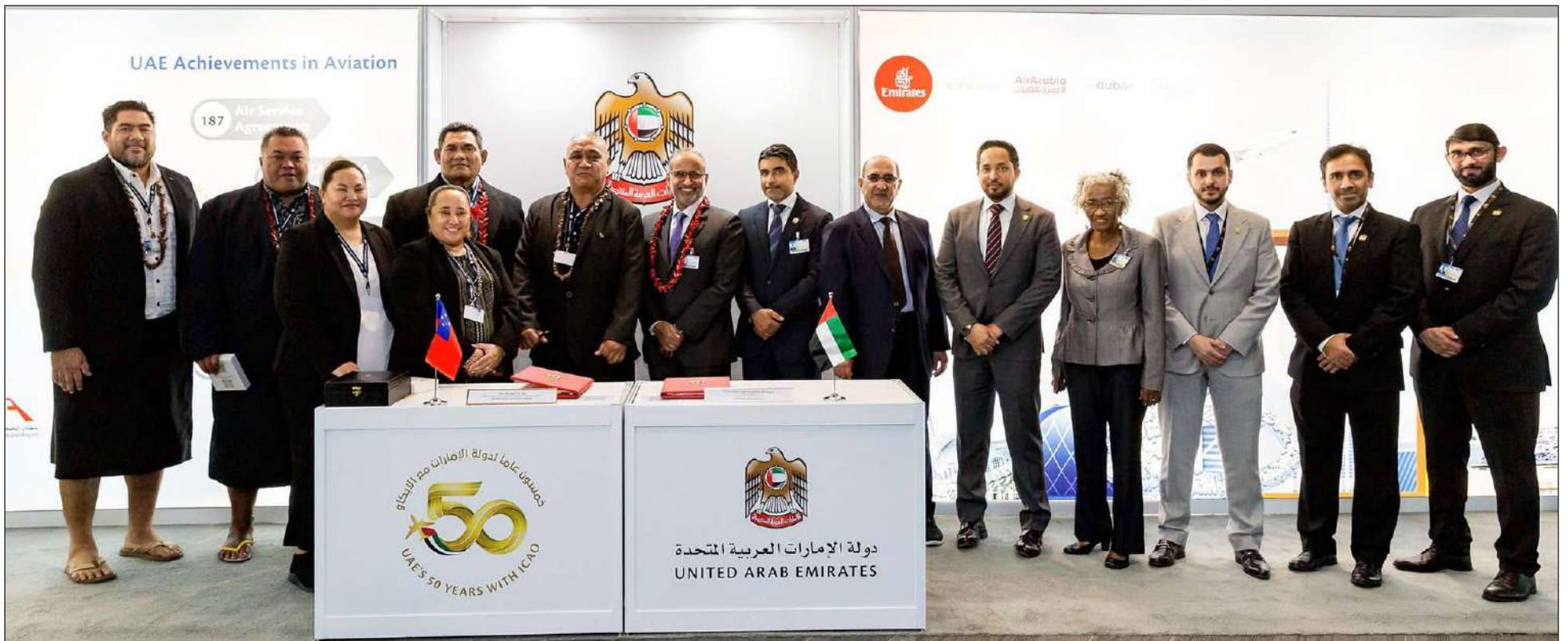
Honorable Minister of Works Transport and Infrastructure, Olo Fiti Afoa Vaai with Samoan delegation pictured with UAE delegation