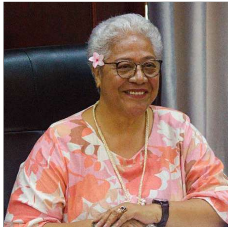
Afioga i le Palemia, Fiamē Naomi Mataafa

"E lē āoga ona tatou nofoa'i, ina ne'i lē toe faia ni mita fa'apea i le lumana'i ona ua saosaoa le malamalama ma auala o feso'otā'iga i nei ona po, ae o le itu'āiga mita fou lea (latest technology) o lo'o maua i luga o le maketi ma o lo'o tatou mulimuli lava ina ia fa'aleleia atili le auauunaga mo le tatou atunu'u."