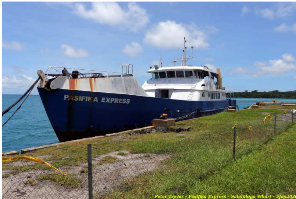
Peter Trevor - Pasifika Express - Salelologa Wharf - 5Jan2020

"Preparations were conducted for legal documentation and permits to sink the vessel