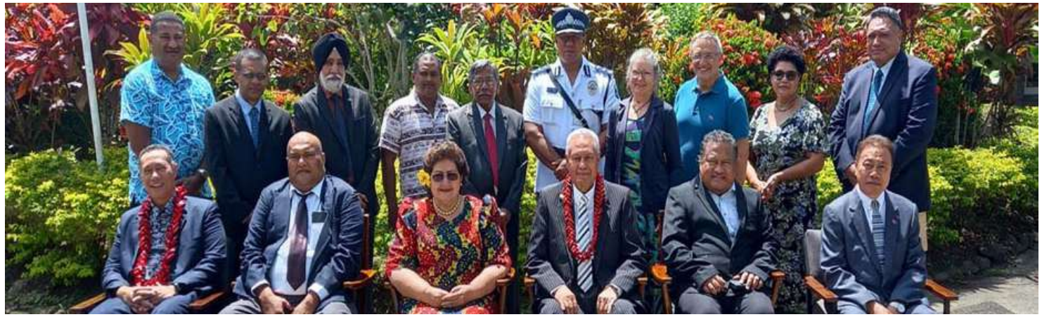
Afioga i le Ao Mamalu o le Malo and Masiofo and USP Deputy Vice Chancellor and USP Senior Management Staff – Laucala Campus, Suva.