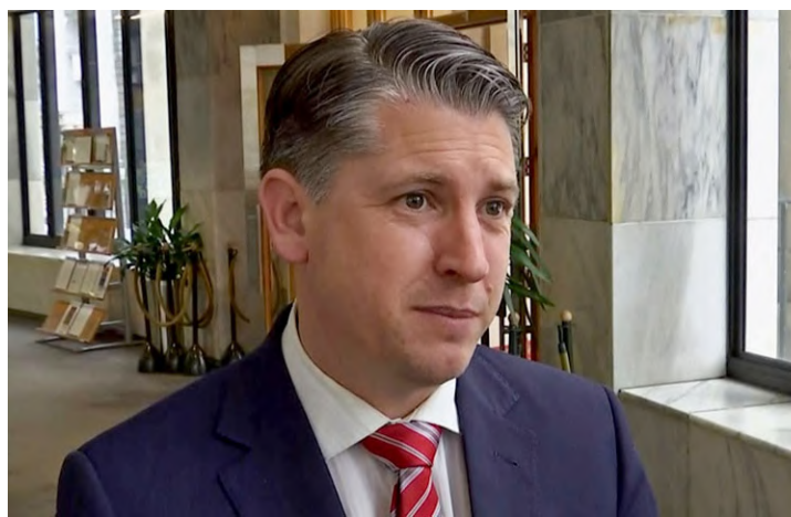
Immigration Minister Michael Wood.

Toeolesulusulu Cedric Schuster as well as senior officials from the Ministries of Foreign Affairs & Trade, Natural Resources and Environment, Women Community & Social Development, Agriculture & Fisheries, MINISTRY OF FOREIGN AFFAIRS & TRADE