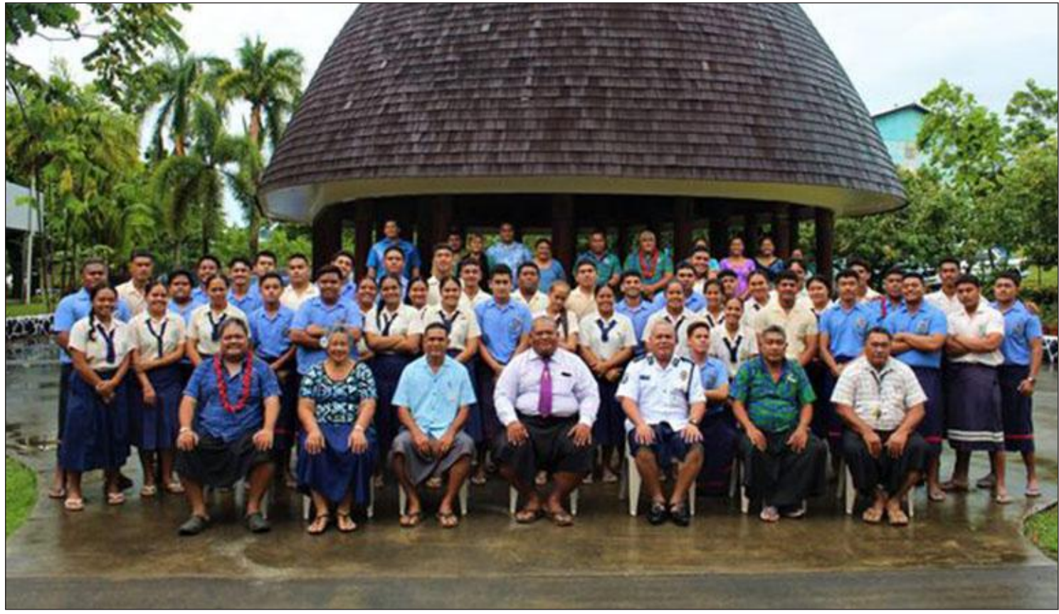
Kolisi o Leiffi ma le Kolisi o Sagato Iosefo i le sauniga o le fa'aleleiga.

"Manatua lelei, a a'afia lou talavou i nei