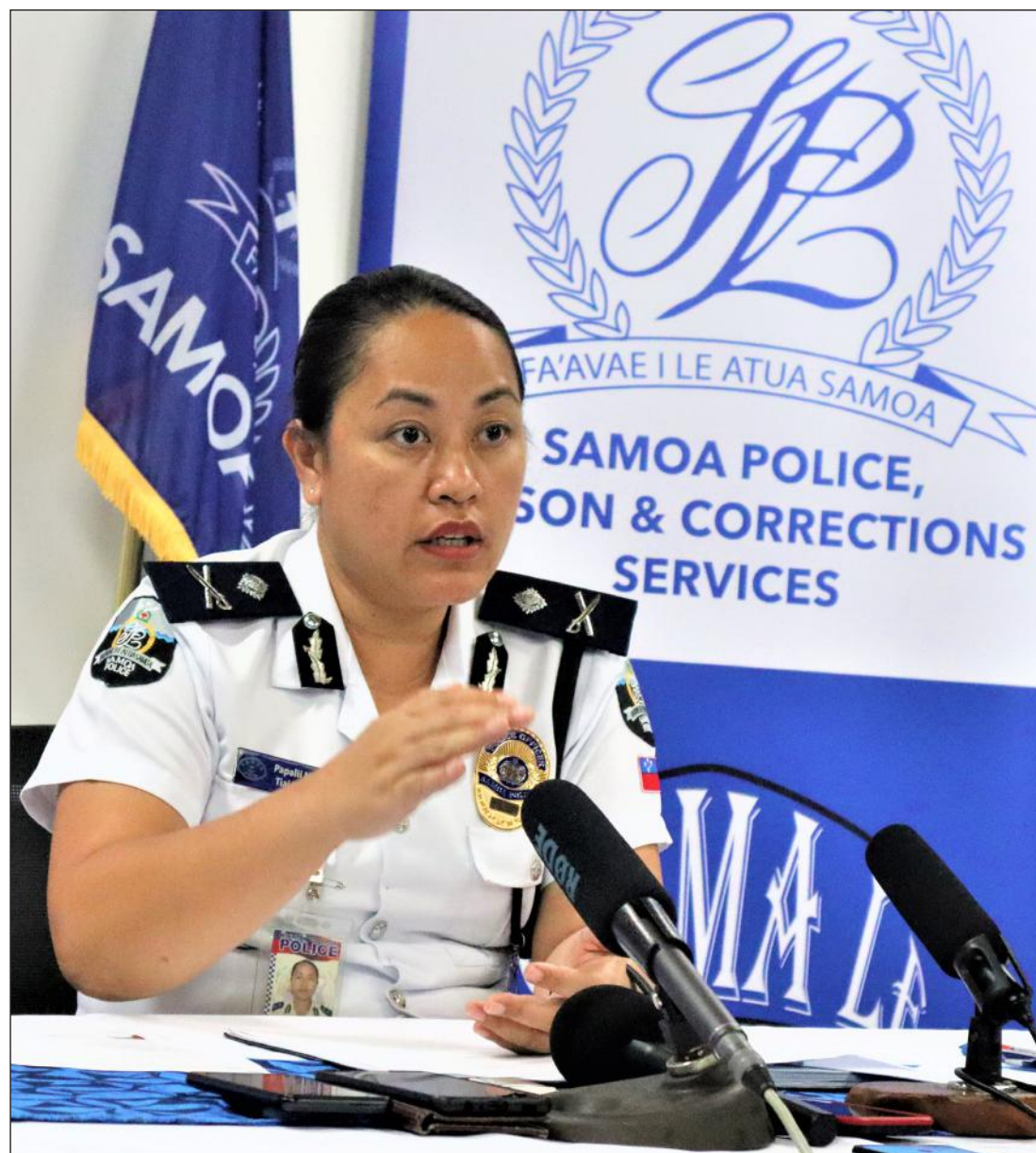
Deputy Police Commissioner Papali'i Monalisa Tiai-Keti

This is all to ensure that safety and protection is adhered to by celebrators if any parades happen on Sunday.