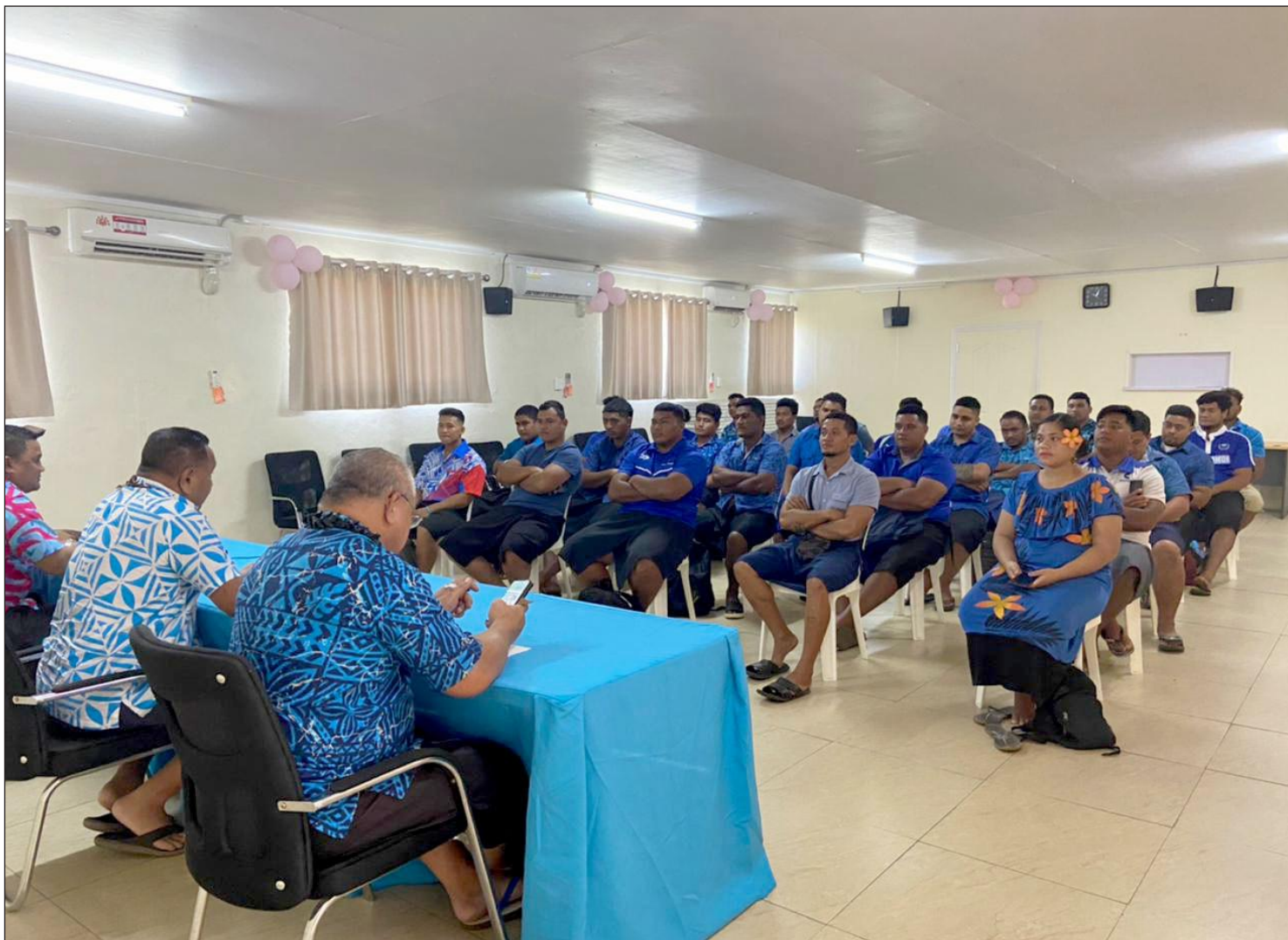
Nisi o seila Samoa o lo'o fa'asauni le malaga atu e galulue i luga o va'a meli i atunu'u maa.

"O nisi sa tutuli mai ona o a'afiaga māmā e pei o le fa'atamala ma le tuai i galuega, e ono