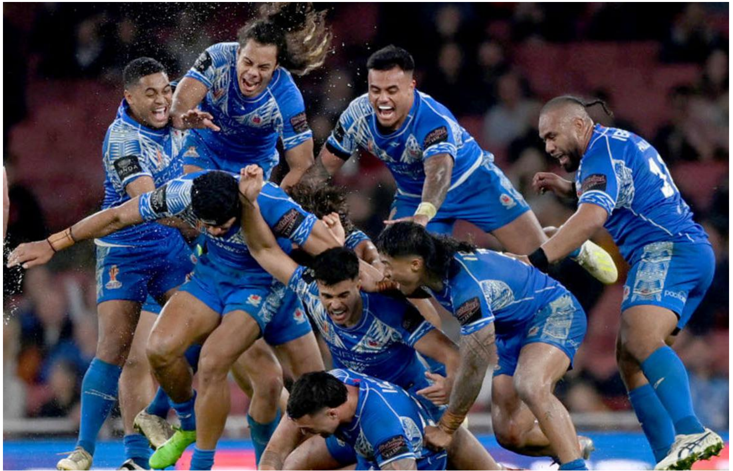
HISTORY MAKERS: Samoa has become the first Pacific nation to make it into a Rugby League World Cup Final after the Toa Samoa won their semifinal match against England on Sunday.