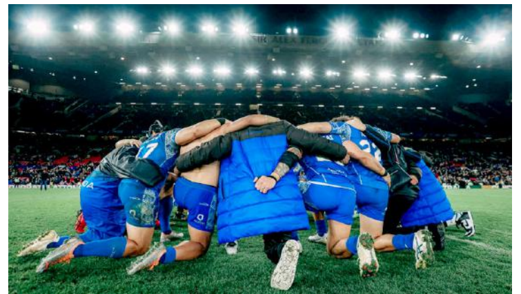
O le masani lea i le Toa Samoa e fa'ai'u ana ta'aloga uma i le vi'iga ma le fa'afetai e fo'i i lo tatou Matai Sili oi le Lagi, ona ua i'u manuia le fa'agatama sa feagai ai