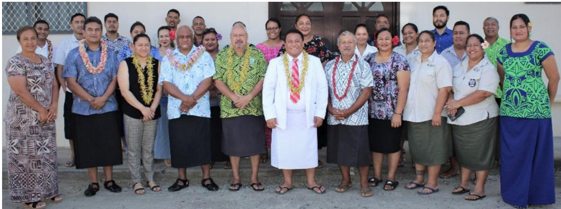
Sui o le Mālō o Niu Sila ma Samoa i auunaga tau fa'ato'aga ma le vaega o fa'aasu