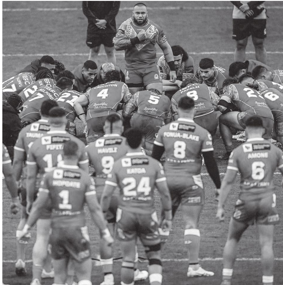
Toa Samoa Captain Junior Paulo leads the Toa Samoa in a Siva Tau in their quarter final match against Tonga

"Although we have a busy schedule throughout the year, we need to find a way on how we can block these games out for international rugby league moving forward