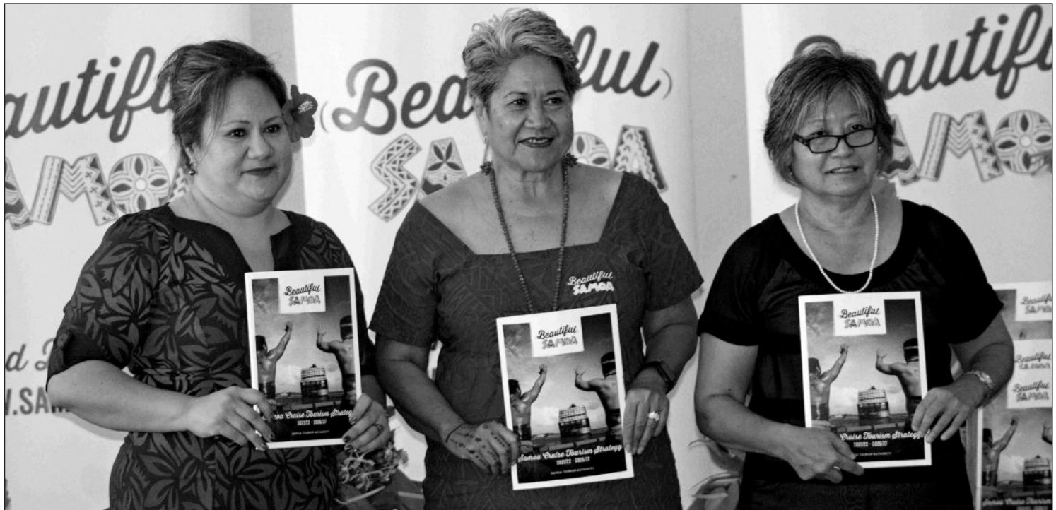
The strategy was launched last week Friday