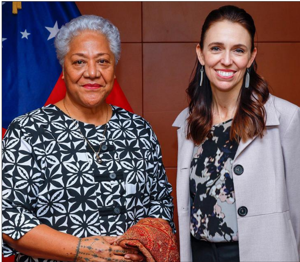
Honourable Prime Minister Fiamē Naomi Mataafa and New Zealand Prime Minister Rt Honourable Jacinda Ardern.

The Prime Minister is overseas on official duties and will be returning home early next