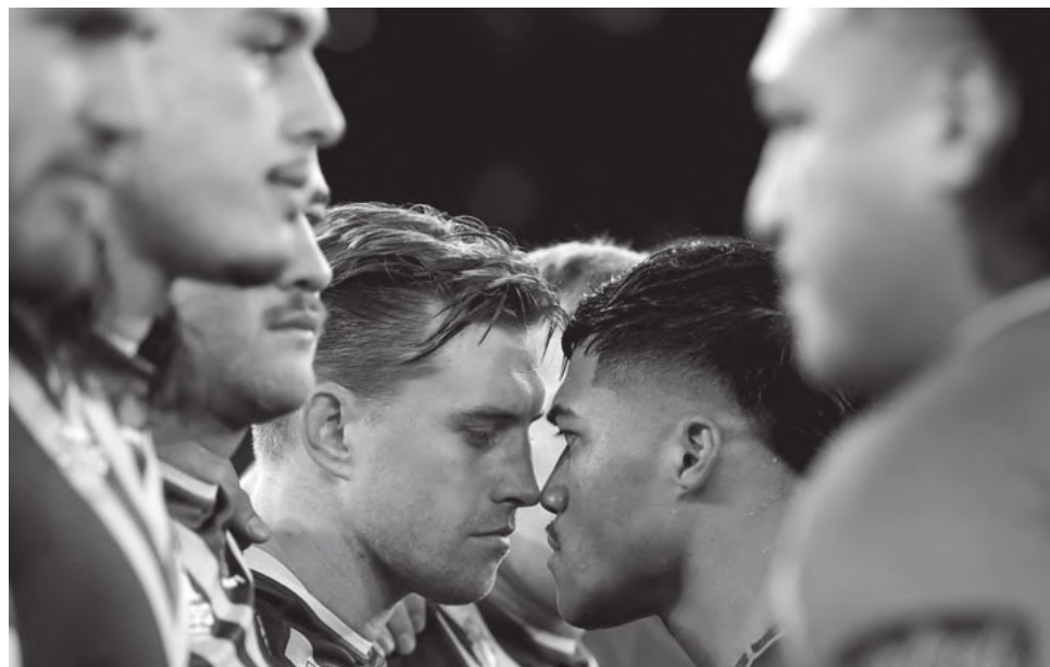
Siva Tau a Samoa i le la ta'aloga fa'ai'u mo le lpu o le Lalolagi i leni tausaga ma le au malosi a Ausetalia

O Ausetalia ua fa'amaui, ua atoa ai nei le 12 o ana siamupini i le lpu o le Lalolagi i le Lakapi Liki talu ona fa'avaeina lea ta'amilosaga.