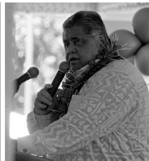
Minister of Agriculture and Fisheries Laauli Leuatea Polataivao Fosi