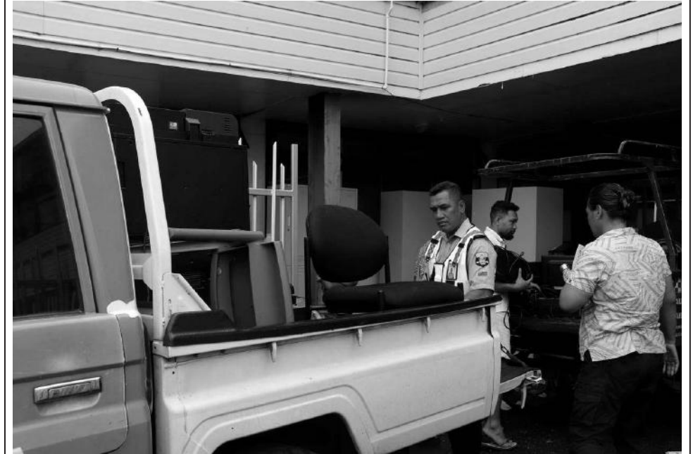
Laufo Meti Building now location for Traffic Division of the Ministry of Police, Prisons and Corrections Services