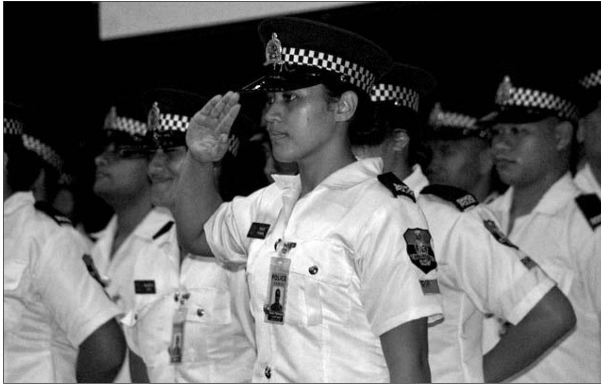
Fanau a le atunu'u ua fa'au'uina ma aloäia le avea ma Malu o le Mälö

"O le Matägaluega o Leoleo e i ai lava le