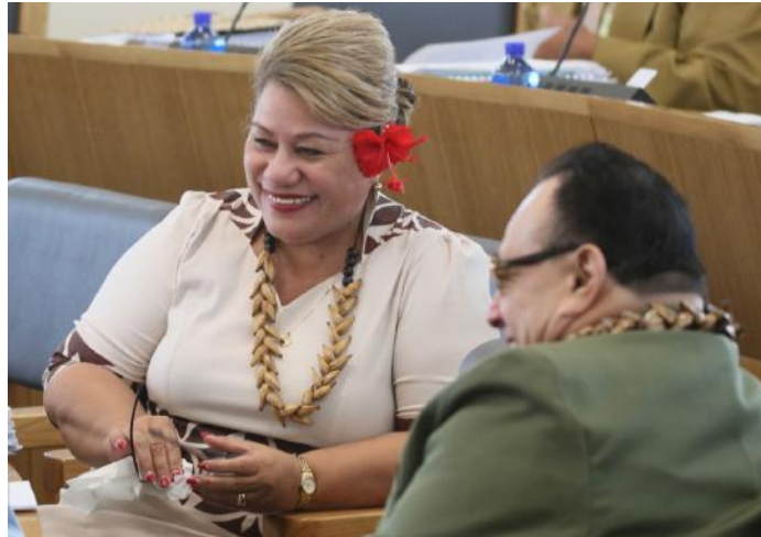
Finance Minister Mulipola Anarosa Ale Molio'o

Valued at approximately 19 million tala, this payout will be made available 100% in-cash for all members. This is in addition to the payouts already done in early July and December 2022, within this Financial Year.