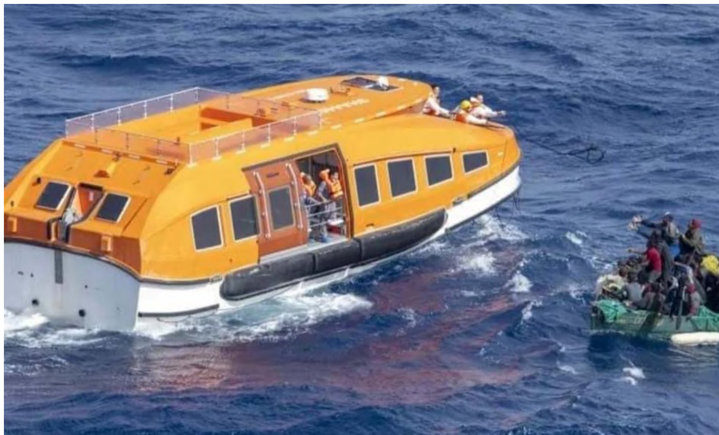
Galuega alofa ma le fa'aaloogia sa fa'atinoina e nai tamafanau a le atunu'u, e ala i le laveā'ia o soifua o nai tagata sulufa'i Cuba lea sa maua i luga o le sami.

"O se tasi lenei o galuega e nafa ma seila, o galuega lavea'i i so'o se taimi e mo'omia ai pe a a'afia ma lamatia le soifua o tagata lautele i luga o va'a ma le vasa.