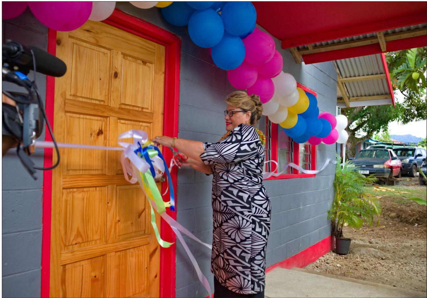
Minister of Finance Mulipola Anarosa Ale Molioo

"It is equipped with desks, computers, machines and internet connection has been established to start serving the constituency,"