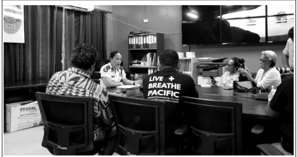
Ministry of Police, Prisons and Corrections Services weekly Press Conference

The Ministry performs its own selection and recruitment processes and is executed under its Human Resource Division.