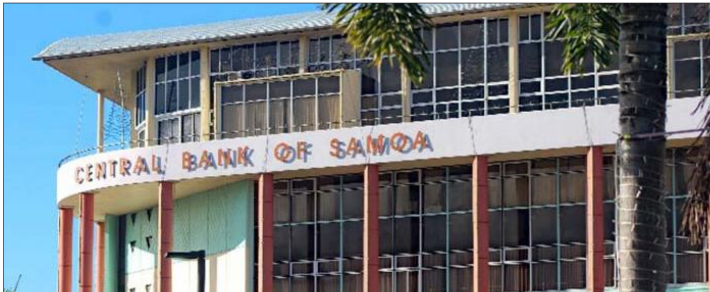
Tusia: Tusiga Taofiga

Ua fa'aitiitia i le $6.3 miliona tusa lea ma le 9.2% tupe fa'amomoli mai atunu'u i fafo i le masina o Oketopa 2022.