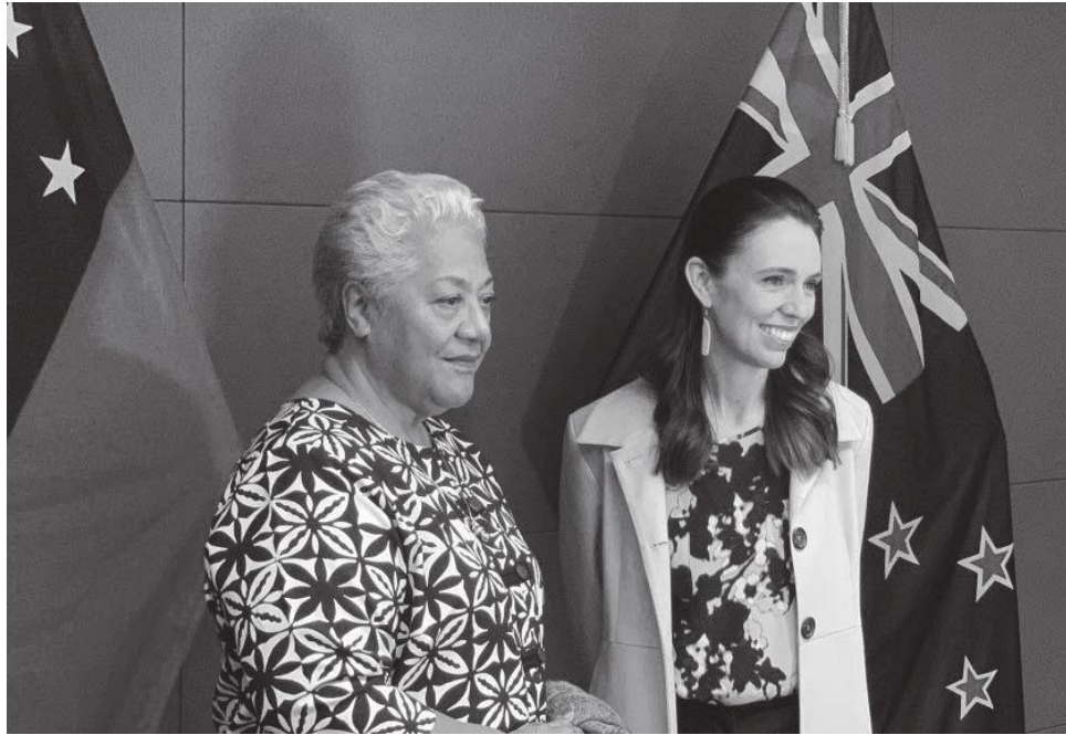
New Zealand Prime Minister Jacinda Ardern with Prime Minister Fiame Mataafa in Wellington.

She has already taken the matter up with the Governor-General to inform of her decision.