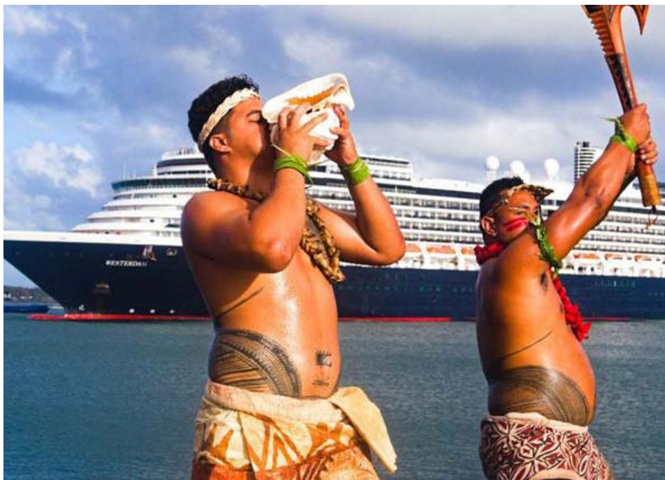
Turisi sa āfea Samoa

Mai i 'ai latou uma nei sa āfea Samoa, na fa'amauina ai e $27.7 miliona le seleni sa mafai ona maua mai iā Setema o lo'o fa'ata'avili i lo tatou tamāō'āiga i so'o se auunaga, e tauala mai i 'ai latou nei.