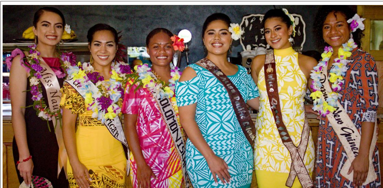
WHO WILL IT BE? The 5 contestants from Nauru, American Samoa, Solomon Islands, Papua New Guinea and Samoa who will be vying for the crown of Miss Pacific Islands at Gym 1 Tuanaimato tonight. Profiles of each contestant are featured in today's edition.