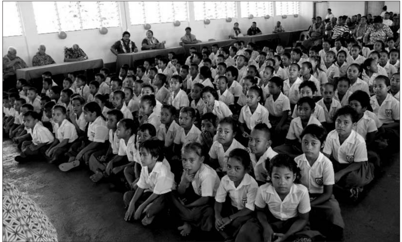
Fanau 'Āoga a le 'Āoga Tulagalua a Satapuala

"O le Kuata muamua, lua ma le tolu e ta'i 10 vaiaso e fa'agasolo ai 'āoga ae ta'ilua vaiaso e