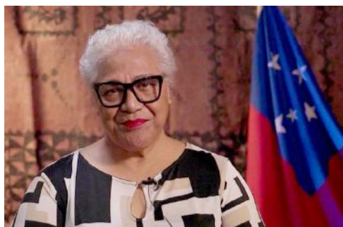
Samoan Prime Minister Fiamē Naomi Mata'afa

(SAINT JOHN, FEB 1ST 2023): Samoa leads the Alliance of Small Island States (AOSIS) to amplify marginalized voices and defend common interests on the world scenario, after the transfer of power from Antigua and Barbuda.