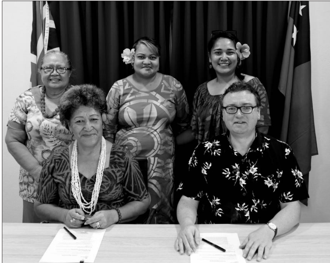
Mae'a le sainigālila a le Fa'alapotopotoga o le Koluse Mūmū ma le Ofisa o le Hai Komisi o Peretania Tele i Samoa nei.

E lē fa'a'ititia le agaga fa'afetai o le Koluse Mūmū i le sao tāua o le lea Mālō e pei ona