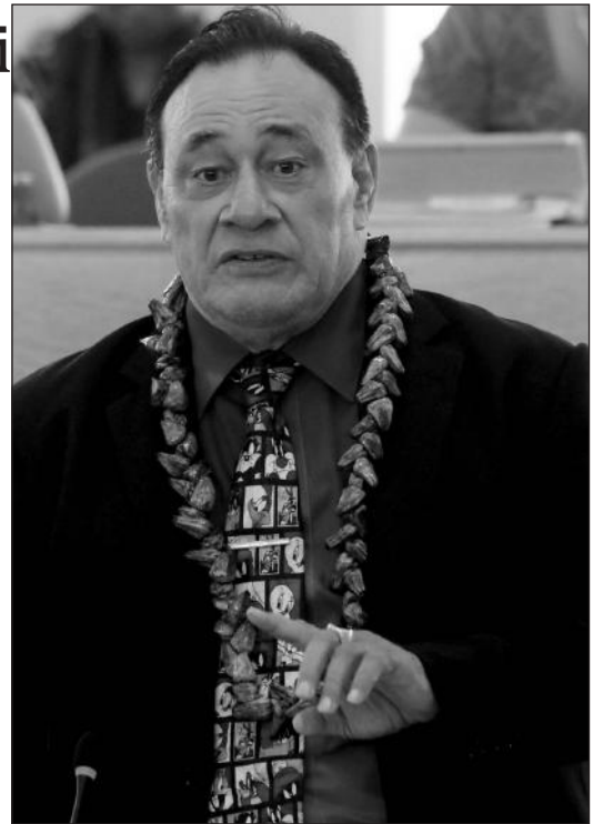
M.O.H Minister Valasi Tafito Selesele

Without a doubt, the country also is keeping a vigil that COVID19 will not be returning to Samoa.