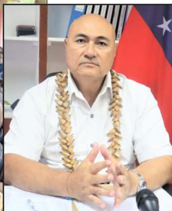
Acting Prime Minister Tuala Tevaga Iosefo Ponifasio