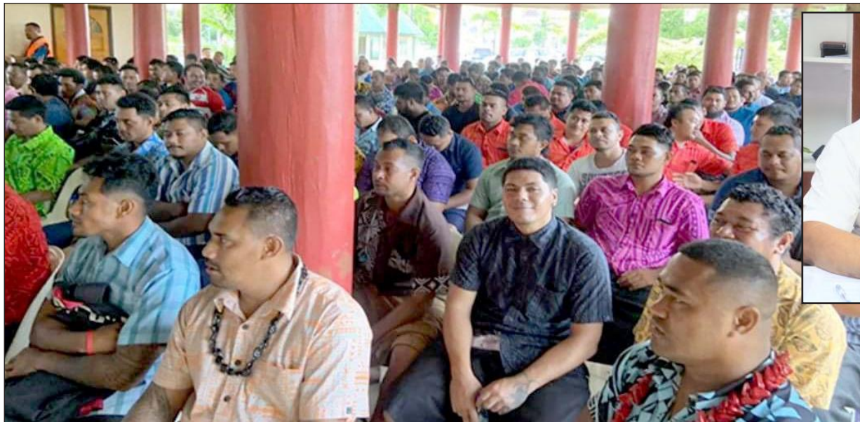
Successful candidates of the R.S.E scheme.

FREE Published by the Ministry of the Prime Minister & Cabinet (M.P.M.C.)