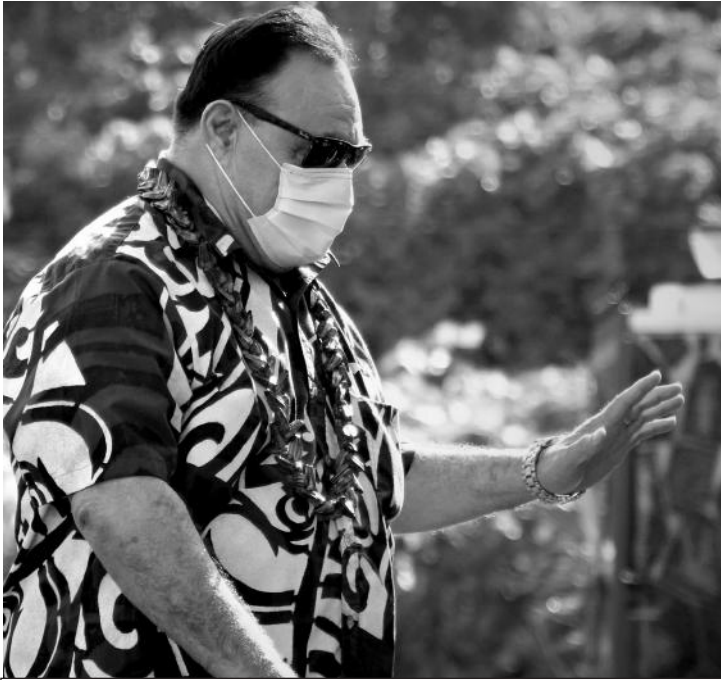
Minisitā o le Matāgaluega o le Soifua Mālōlōina iā Valasi Luapitofanua To'ogamaga Tafito Selesele