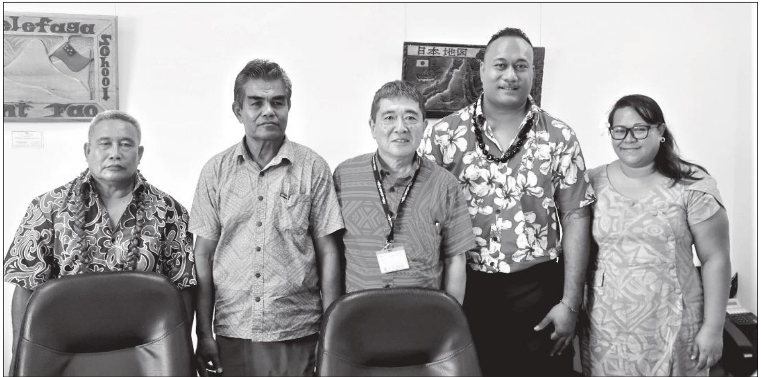
Laufofoga fiafia o le Amapasa aemaise o sui o le Aoga Tulagalua a Salua Manono-tai i le maea ai o le sainigalima.