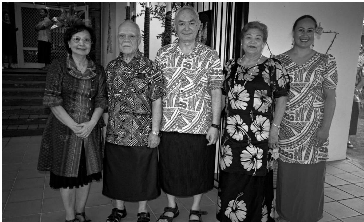
The ceremony was held at the New Zealand High Commissioner's residence on Monday

Samoa and New Zealand continue to work in strategic partnership to address Samoa's aspirations and priorities, he says, as outlined in the Pathway for the Development of Samoa