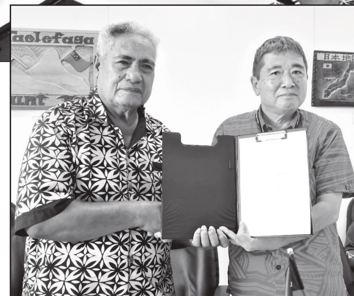
Maea ai o le sainigalima.

Ua i ai le fa’amoemoe o se aso o lenei masina po’o le masina fou, o le a fa’agasolo ai lea galuega tele.