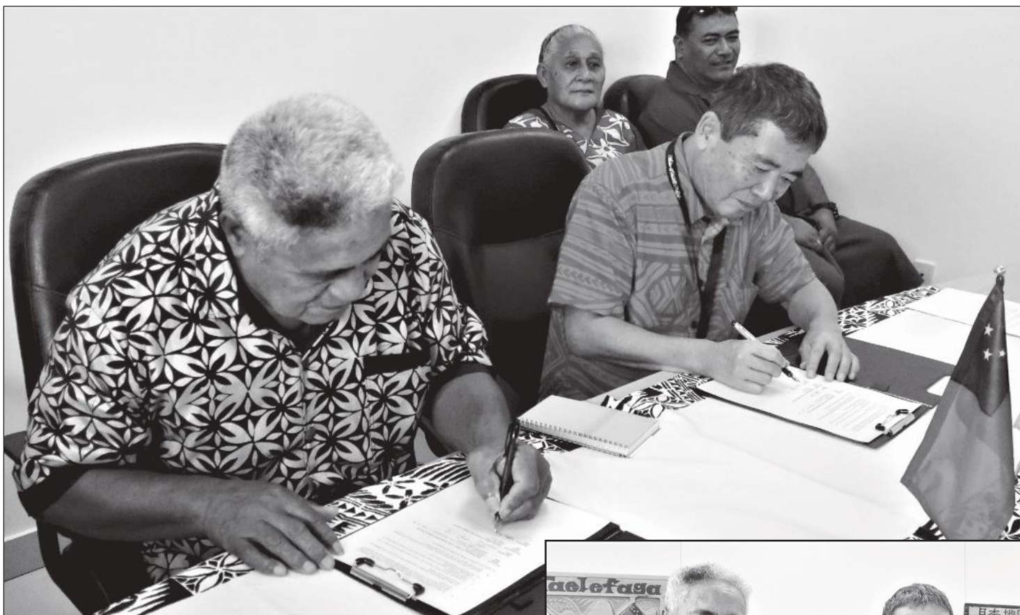
Sainigalima a le Sui o le Nu’u o Apilima -tai ma le Amapasa o le Malo o lapani i Samoa nei.

“E filēmū lava si o matou nu’u e leai se mea