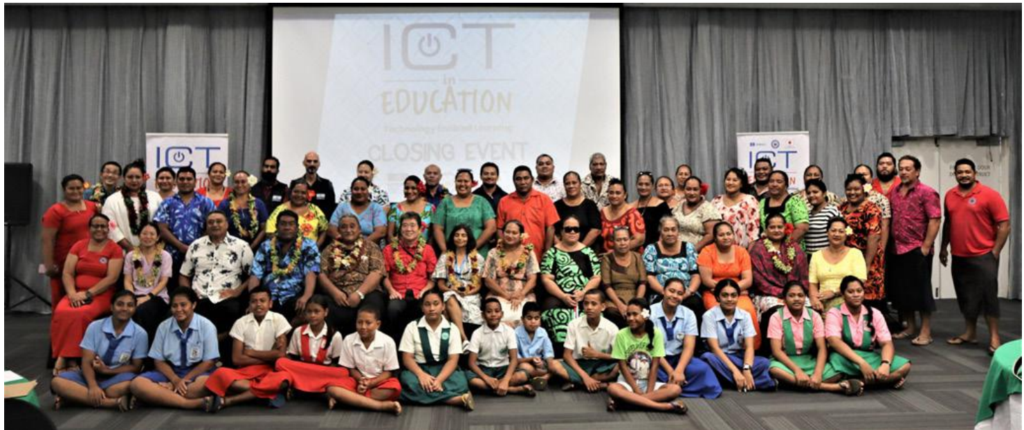
ICT making a difference in the lives of students across Samoa.