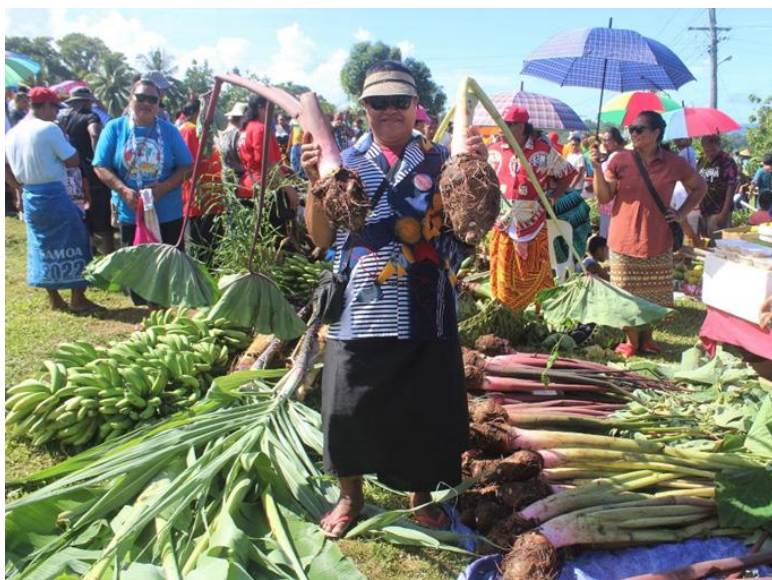
O se tasi o faifa'ato'aga mai le Itumālō o Salega #1.

Fa'aailoa manino e La'auli, o se tasi lea o folafolaga sa o latou ta'utino ai a'o lumana'i ai le Palota Tele 2021, lenei ua fa'ataunu'uina ma le manuia.