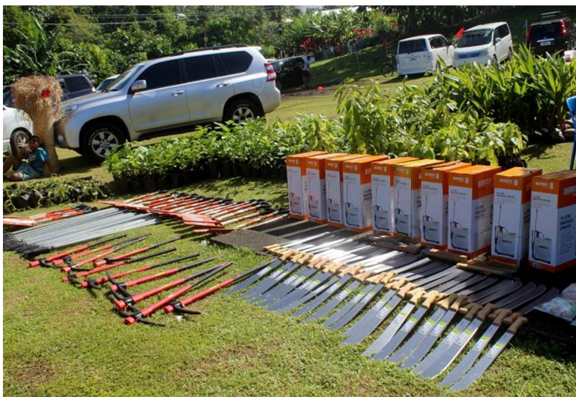
Meafaigaluega sa tapenaina e le Matāgaluega o Fa'ato'aga ma Faigāfaiva mo le Itumālō o Salega #1 (Ata Pu'eina: Leaosā Fa'aifo Fa'aifo).