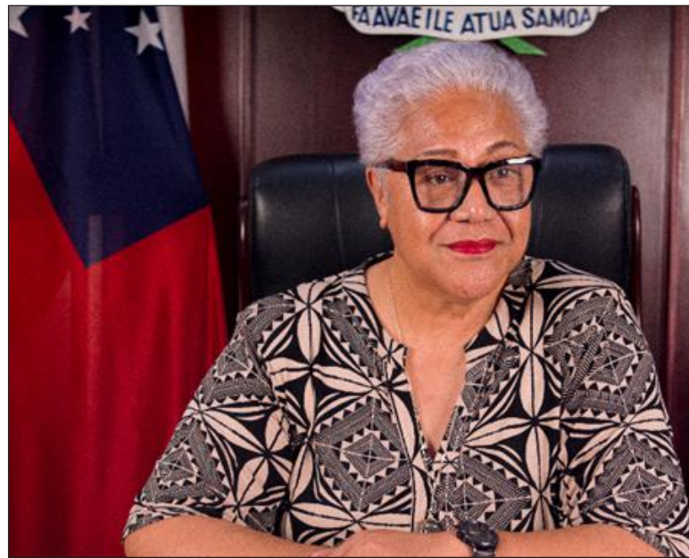
Afioga i le Palemia, Fiamē Naomi Mataafa.