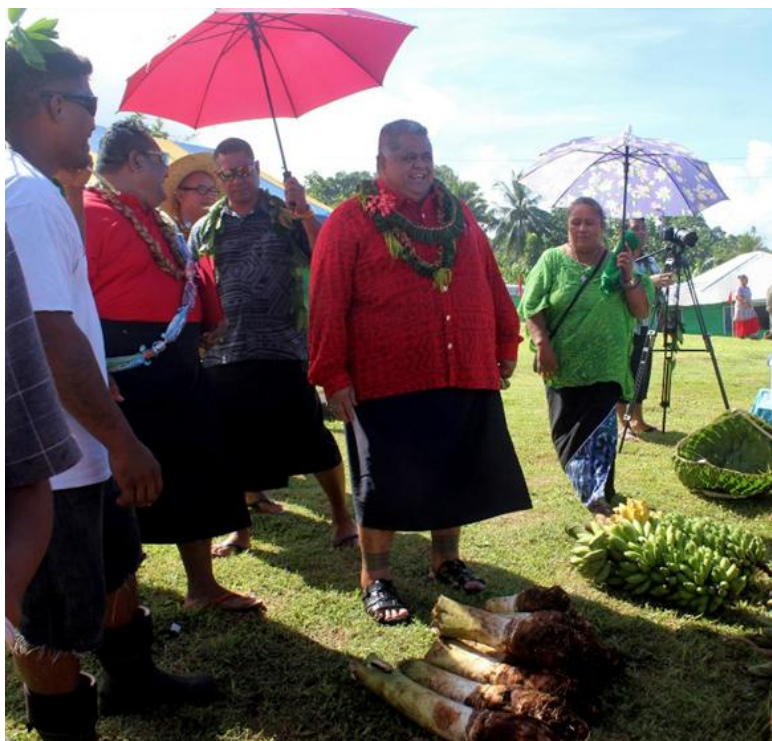
Āsia e le afioga iā La'auli Leuatea Polāta'ivao Fosi o le Minisitā o le Matāgaluega o Fa'ato'aga ma Faigāfaiva le Ulua'i Seleselega mo le Itumālō Palota o Salega #1 (Ata Pu'eina: Leaosā Fa'aifo Fa'aifo).