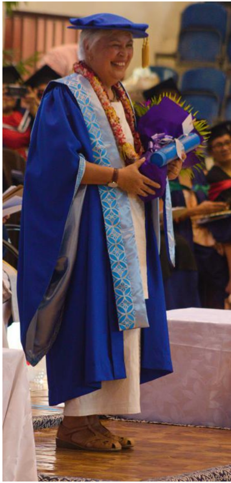
Luamanuvao Dame Winnie Laban