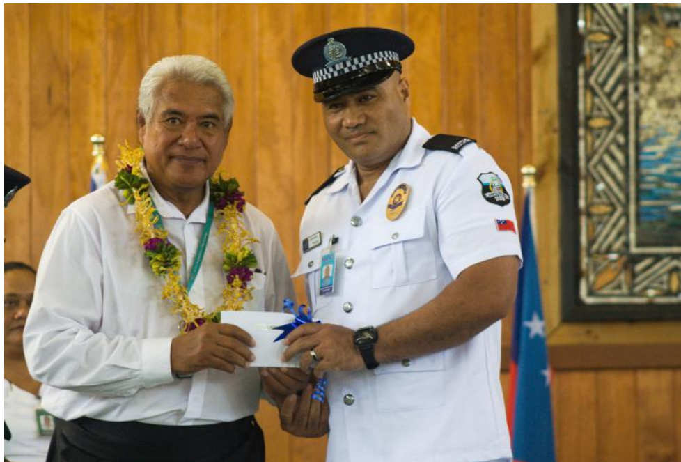
The promotion ceremony was held at the EFKS Hall Sogi