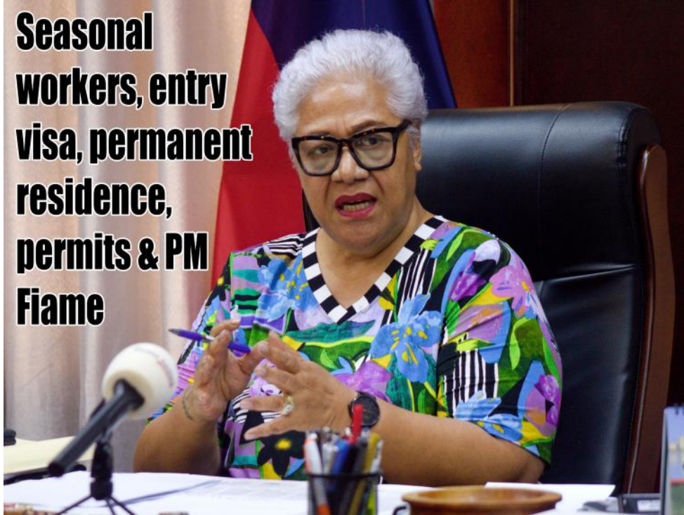
Prime Minister Fiamē Naomi Mataafa