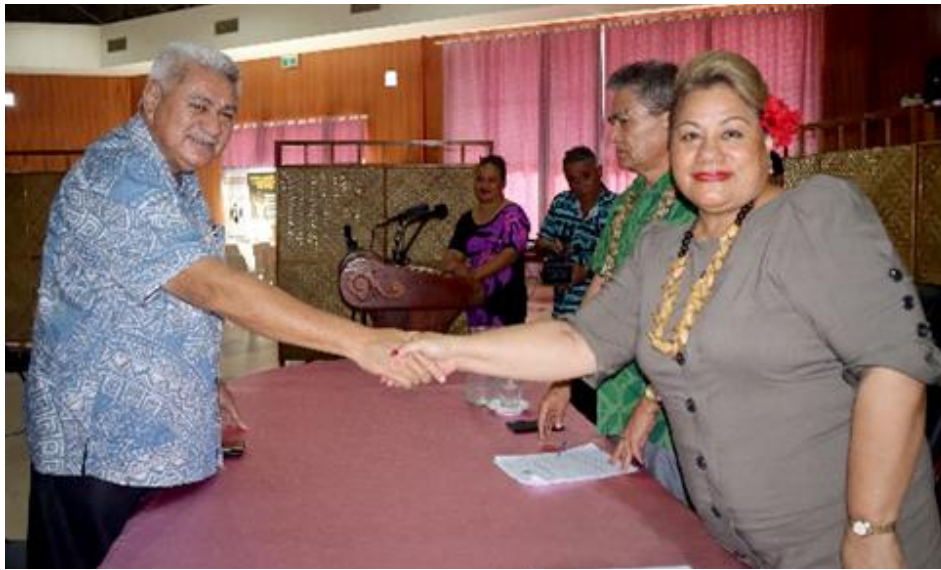
Minister of Finance Mulipola Anarosa Ale Molioo and Member of Parliament of Anoaama 2 Lauofo Fonotoe Nuafesili Pierre Lauofo