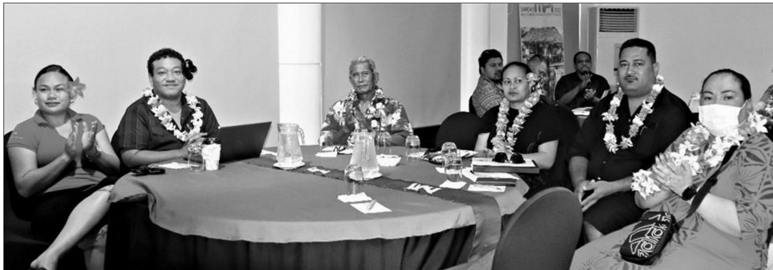
Sui mai Matāgaluega ma nisi o Fa'alapotopotoga ma Pisinisi Tumā'oti i le atunu'u, sa molimauina leni fa'amoemoe tūa.