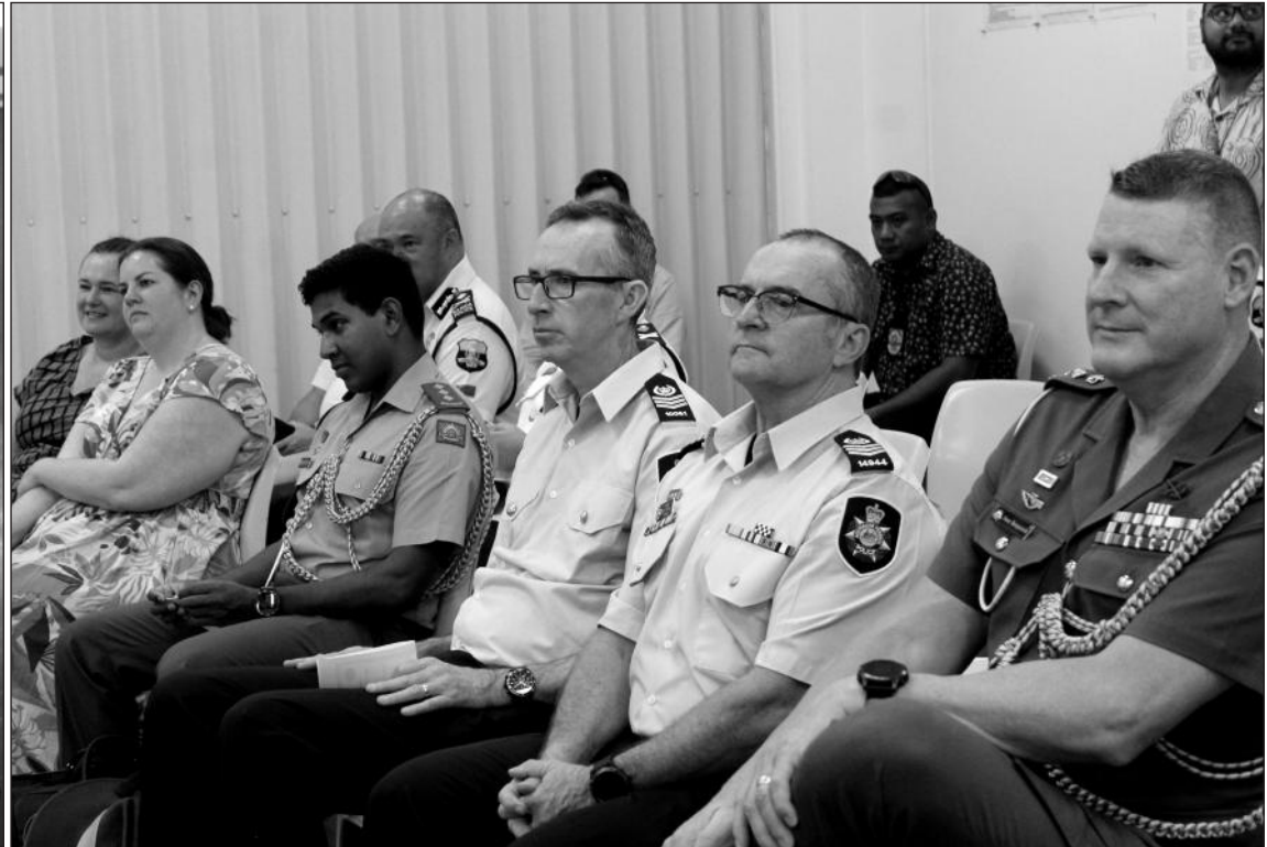
The official launch of the Police Training Facility funded by the Government of Australia.