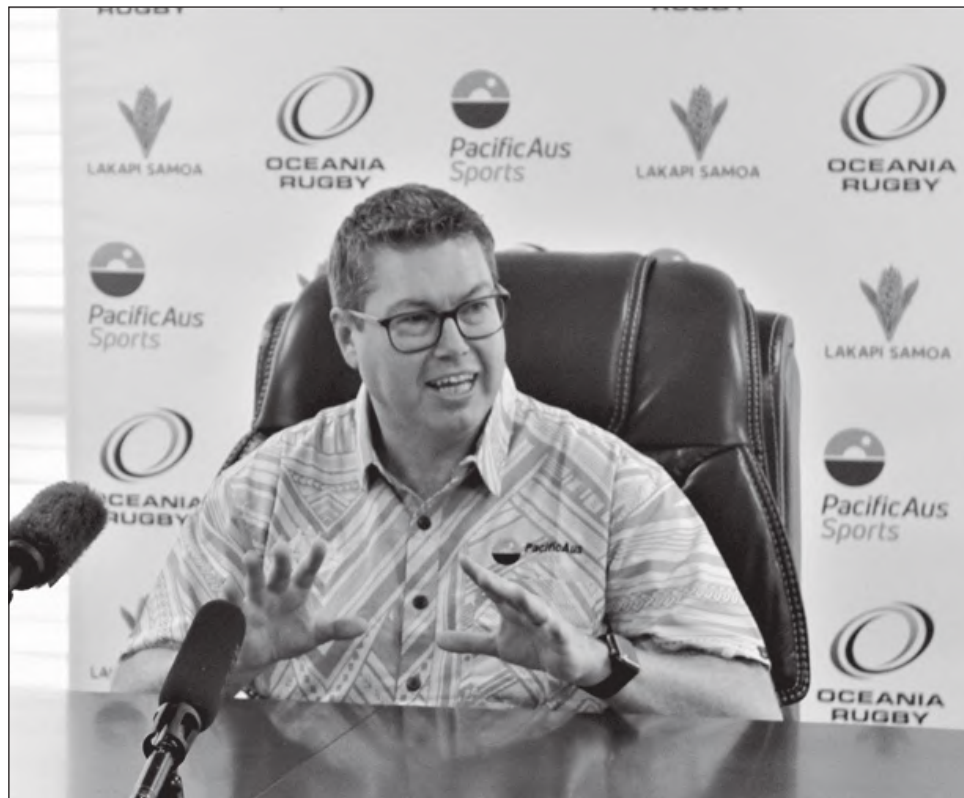
Minister of International Development and the Pacific Pat Conroy in Samoa last week.

Aside from the Pacific Labour Mobility, the Seasonal Workers Program which provides temporary employment of up to 7 months for Down Under horticulture and viticulture