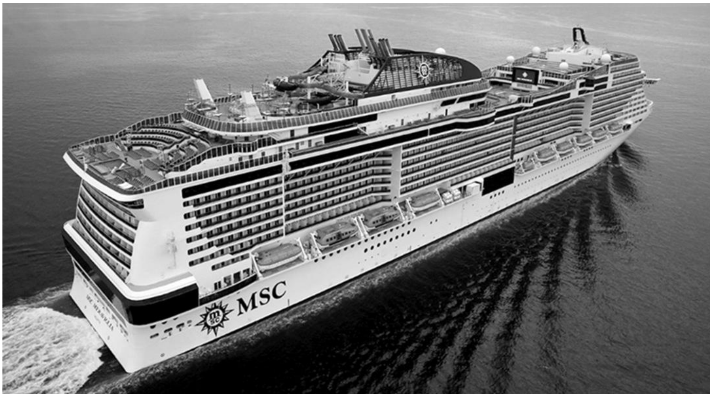
Le Kamupanī Va'a tele a le M.S.C. o lo'o latou fa'afagaluegaina le to'atele o tatou tamafanau seila, i luga o va'a meli ma va'a la'u oloa i le tele o tausaga ua mavae se'ia o'o mai lava i le taimi nei.