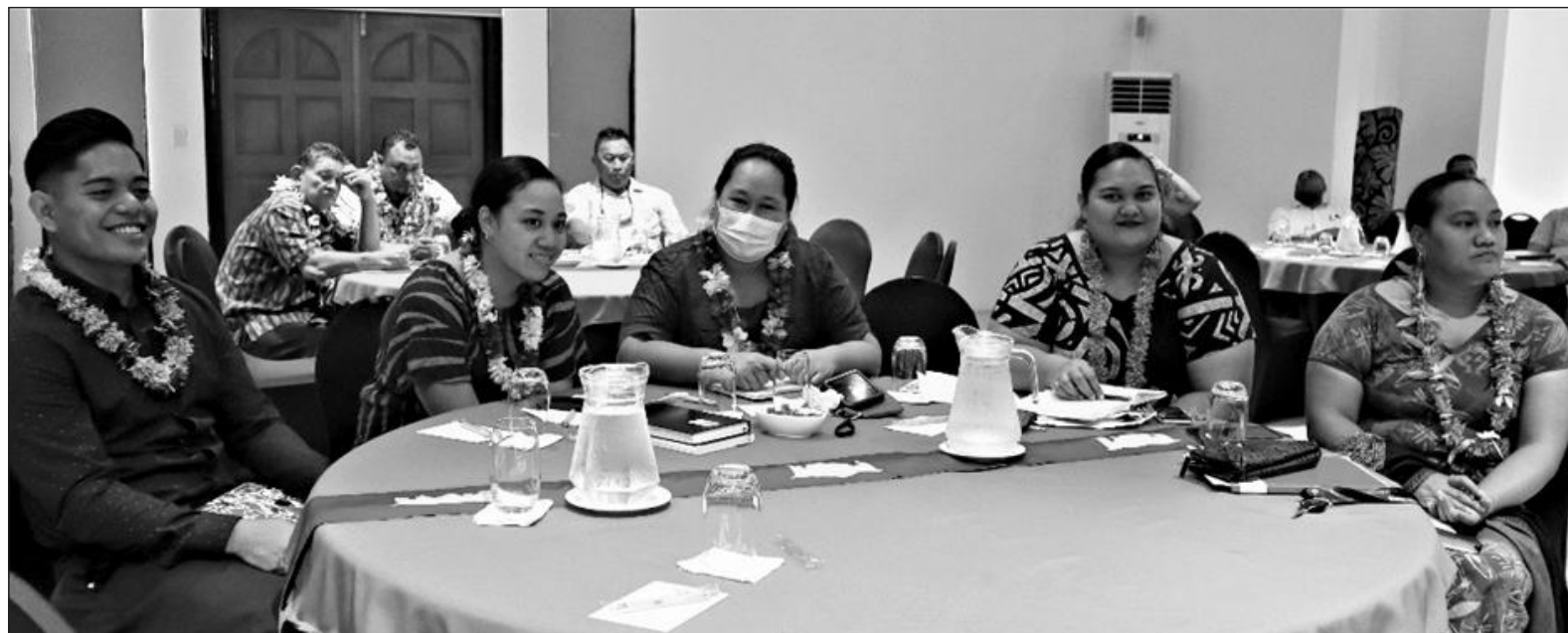
Sui o Matāgaluega ma Ofisa a le Mālō sa molimauina leni fa'amoemoe tūa.