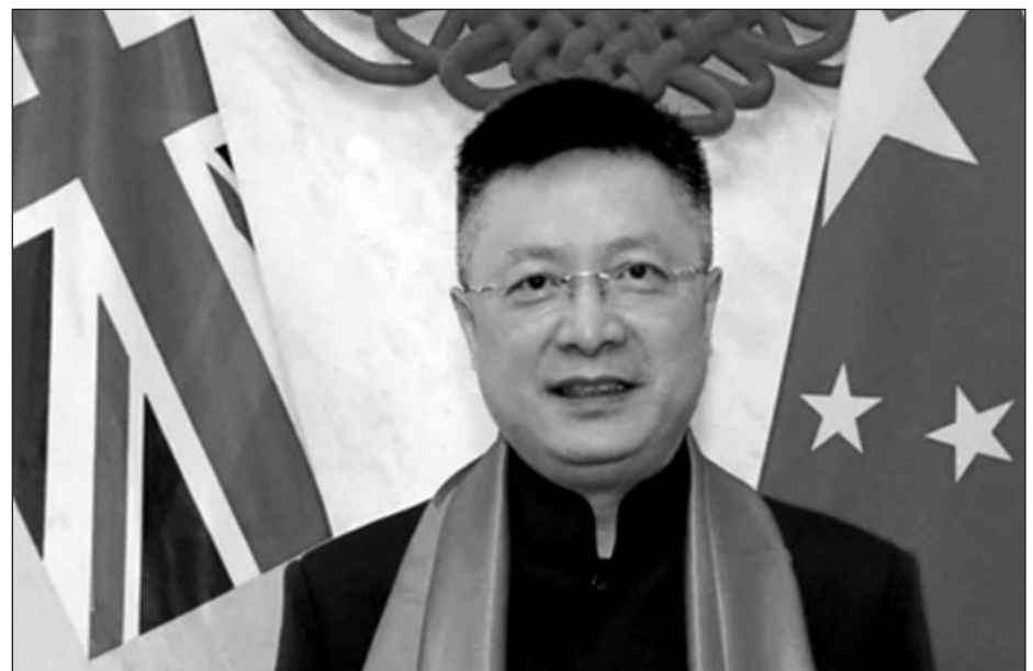
China's Special Envoy for Pacific Island Countries Affairs.