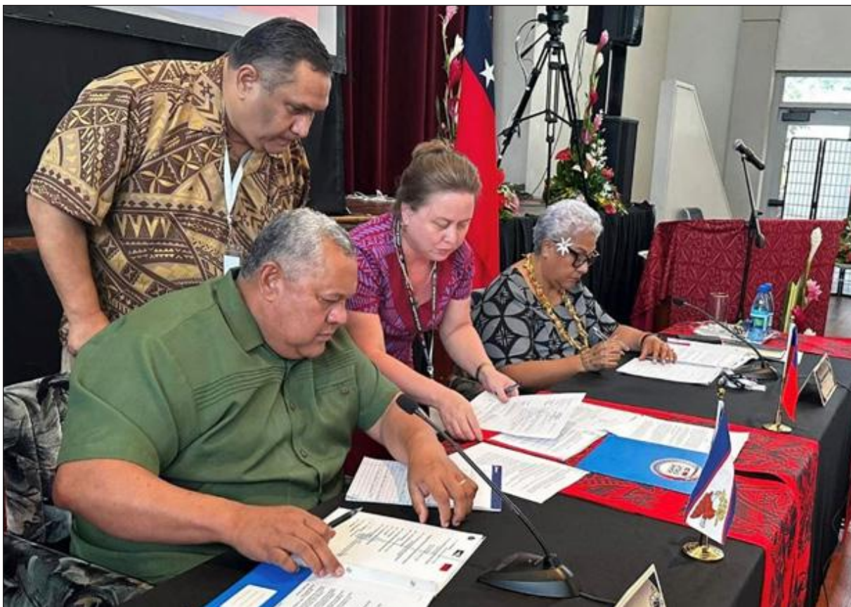
Ta'ita'i o Samoa na lua – afioga i le Kovana Sili ma le Palemia o Samoa i le Fonotaga a le Atoa o Samoa i Tutuila ma Manu'a, ma afioga i Loia Sili o Mālō e lua.

O lenei maliega na sainia ae le'i tauālugaina le Fono a le Atoa Samoa i le Aso 12 o Aperila 2023.