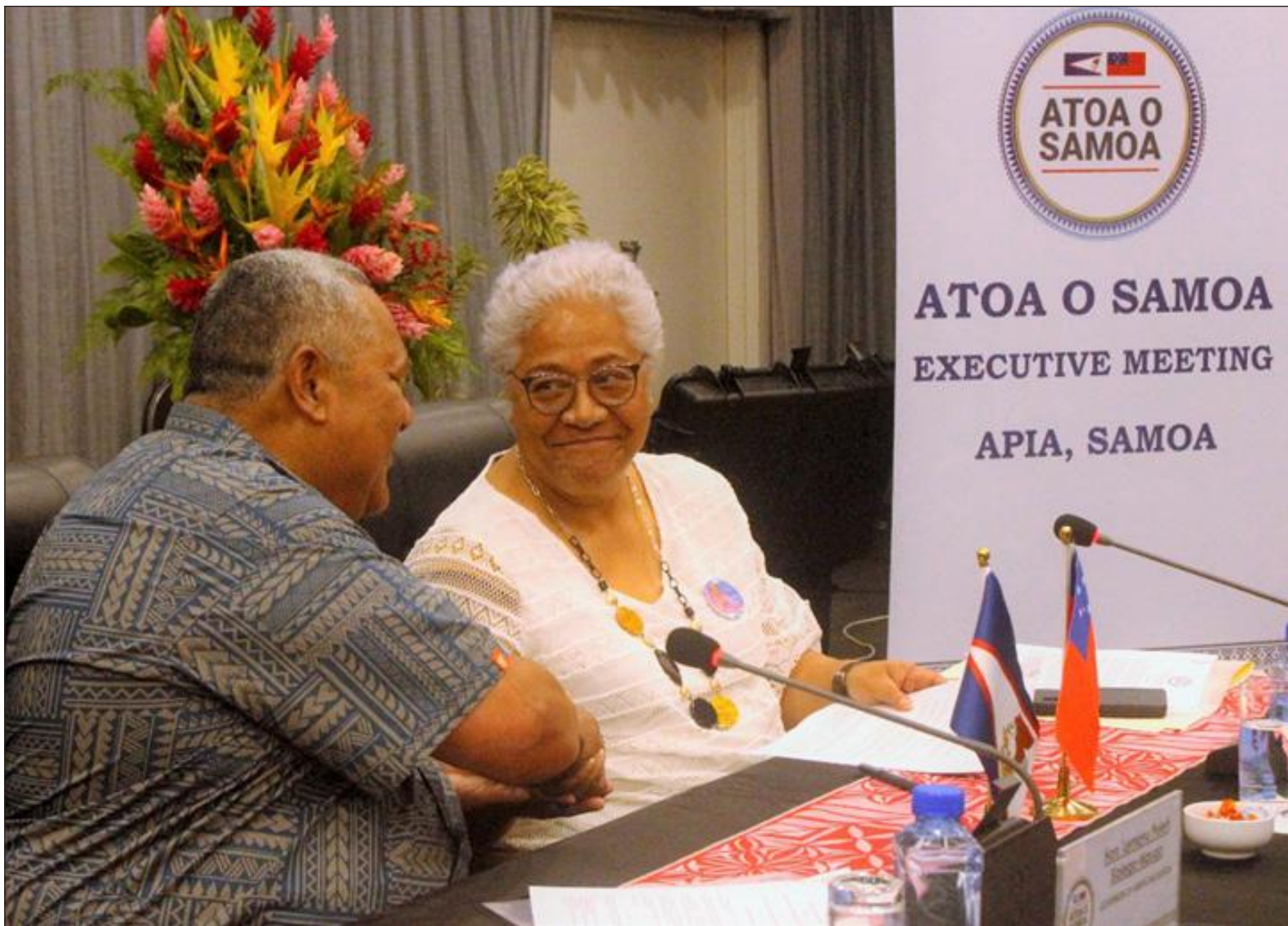
Afioga i le Palemia o Samoa iā Fiamē Naomi Mataafa ma le Kovana Sili o Amerika Samoa iā Lemanu Palepoi Siālegā Mauga i le Atoa o Samoa i le tausaga ua mavae 2022 e pei ona talimālō ai Samoa.

sitiseni Samoa o lo'o galulue i lea falei'a, ma o le suiga fou o le a aga'i sa'o mai lava lea Kamupani i le Mālō o Samoa, ona feso'ota'i lea tu'usa'o i Ofisa o Fono Fa'avae mo Itumālō tā'itasi, auā le sa'ilia o e malaga atu mo ia galuega fa'avaitaimi.