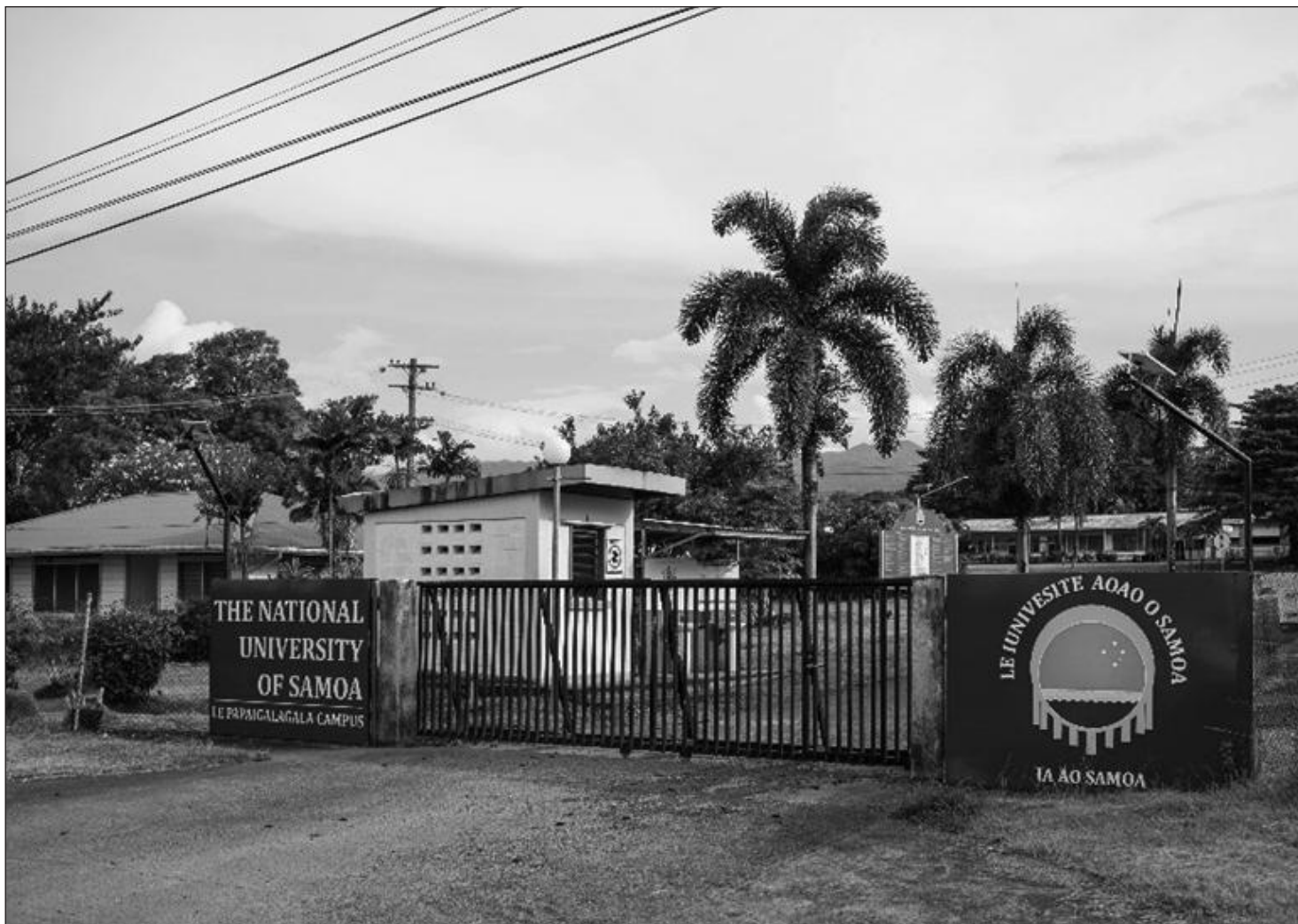
Iunivesite Aoa o Samoa (N.U.S.), o le naunautā'iga o le Mālō ia mautū ma mau'a le ola a'oa'oina o fanau, e tua i ai Samoa ma lona lumana'i, o lona uiga o a'oa'oga e amata mai ai le mapo, sa'o ma maopopo le fa'aāogaina tatau o la tatou Gagana Samoa.

"O se galuega tele, o lo'o silasila lava i ai le Matāgaluega ina ia mautinoa le si'itia o le malamalama o fanau i le fa'aāogaina o le Gagana Peretania e fa'apea fo'i i le Gagana