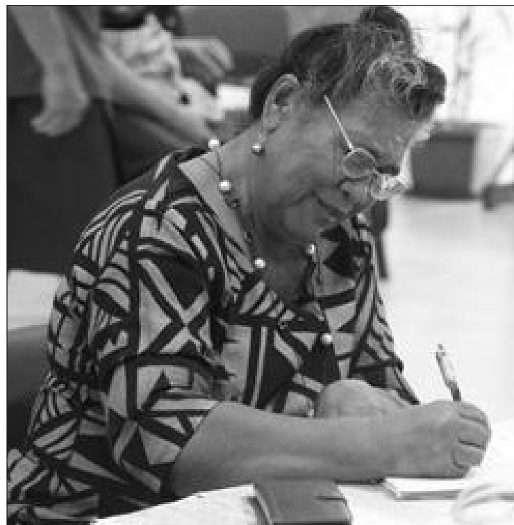
Sainia e le Sui o le Itumālō Palota o Safata #1, le 15% o le Polōketi $1 Miliona mo lo latou Itumālō.

“Ia manatua e 5 aso faigaluega mai le aso e saini ai lea feagaiga, fa'atoā mafai ona fa'amatu'u atu ā outou seleni, ona o lo'o galulue ai le Matāgaluega o Tinā ma Tama'ita'i, Atina'e o Nu'u ma Agafeso'ota'i ma le Matāgaluega o Tupe, e fa'amautū a'o le'i tu'uina atu seleni i