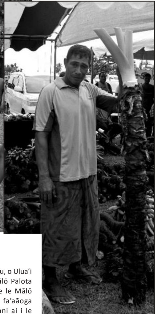
Maao'e fua o fa'a'ele'elega mai fa'ato'aga a tagata galulue o nu'u ta'itasi i totonu o le Itumālō Palota o Anoāma'a #2.

"O le tamāo'āiga o Samoa o le 'ele'ele, o ā uma pisinisi fou ua aga'i mai, e tasi lava lo tatou tofi mai le Atua o le fanua, ia galueā'ina le vao ma fa'asao le gataifale.