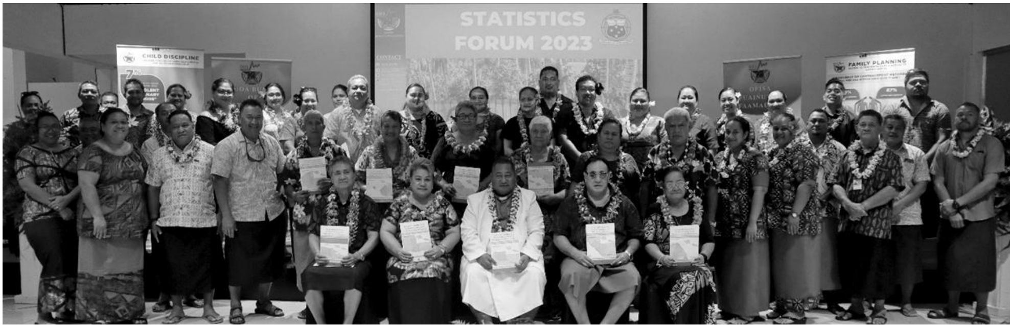
Pāia o le Mālō ma le mamalu o Samoa sa molimauina le tatala aloā'iaina o le Tusi o fa'amaumauga o 'āiga ta'itasi i totonu o Itumālō Palota e 51, ma le va'ai mamao a le Mālō mo atina'e fuafuaina auā nu'u ta'itasi i le atunu'u (Ata Pu'eina: Taunuuga Toatasi).