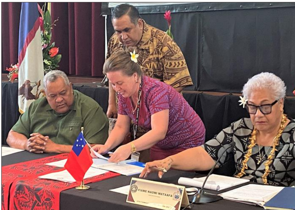
Governor Lemanu Palepoi Sialega Peleti Mauga and Prime Minister Fiame Naomi Mataafa signing the leases to seal the land swap between the 2 Samoas. And still pending is the Outcome Statement under review by the two leaders which will holds the fate of inter-island permit regime between Samoa and American Samoa.