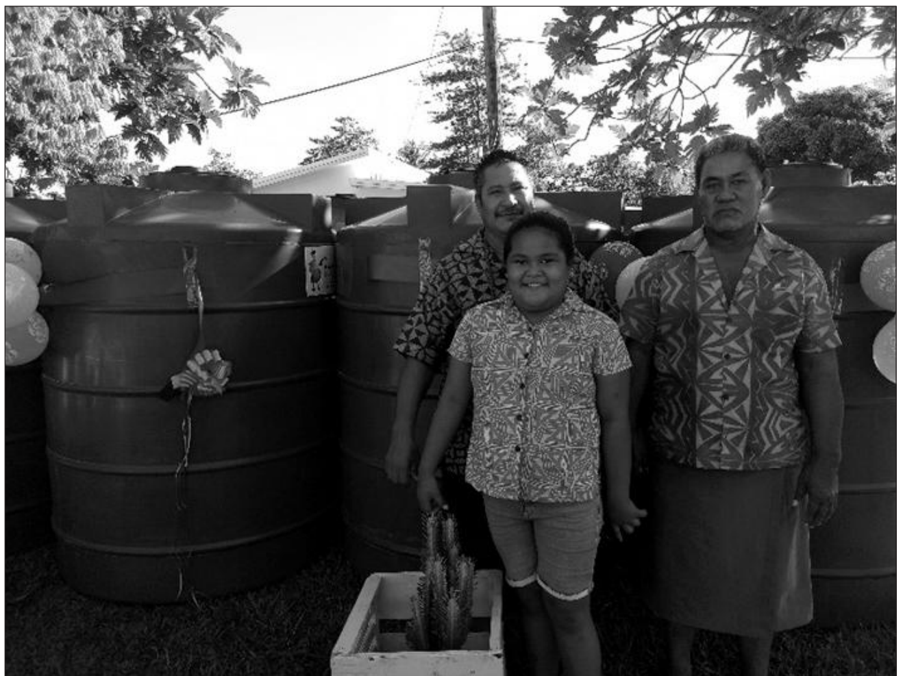
Tane vai fou ta'i 2,000 lita mo 'āiga i le 'Ā'ai o Fiti i le Itumālō Palota o Vaimauga #4 (Ata Pu'eina: Leota Marc Membre).

"O se polokalame e atina'e ai 'āiga, nu'u aemaise