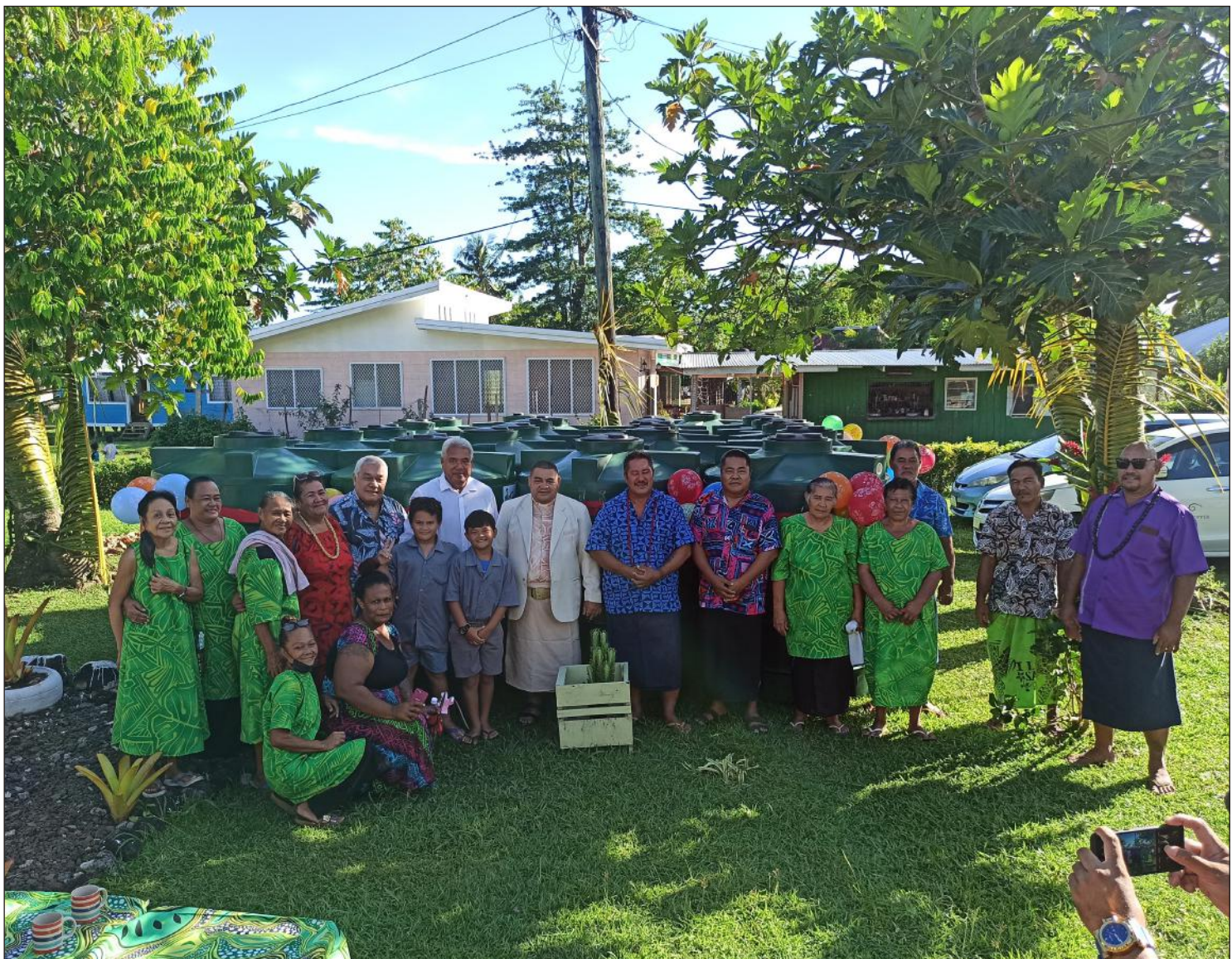
Member of Parliament of Vaimauga 4 and members of the Aai o Fiti village.

He praised the benefits of the $1 million project and said the funds are given directly to the people in the Constituency for the development of families and communities.