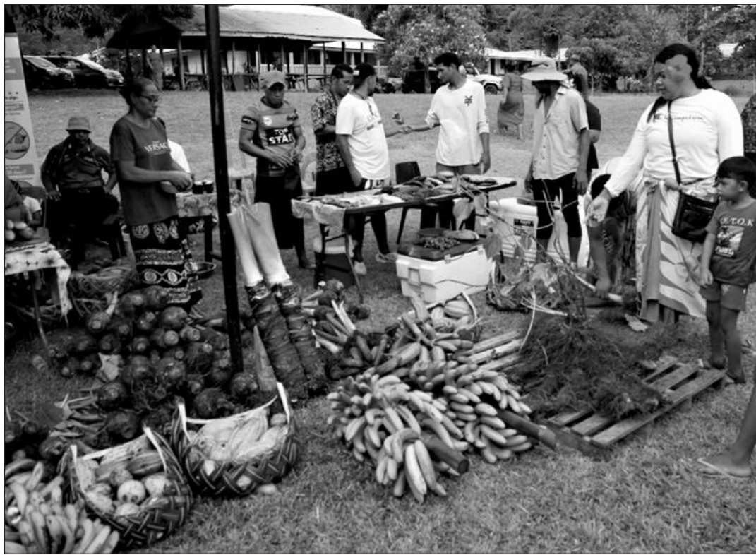
Fua o fa'ato'aga mai le aufaifa'ato'aga a le Itumālō Palota o Anoāma'a #2.

"Ua tatou i ai nei i taimi faigatā, o suiga o le tau, o fa'ama'i, si'itia o le tau o oloa, o ogāsami sa mafanafana ua mālūlū, o ogāsami sa mālūlū ua mafanafana.