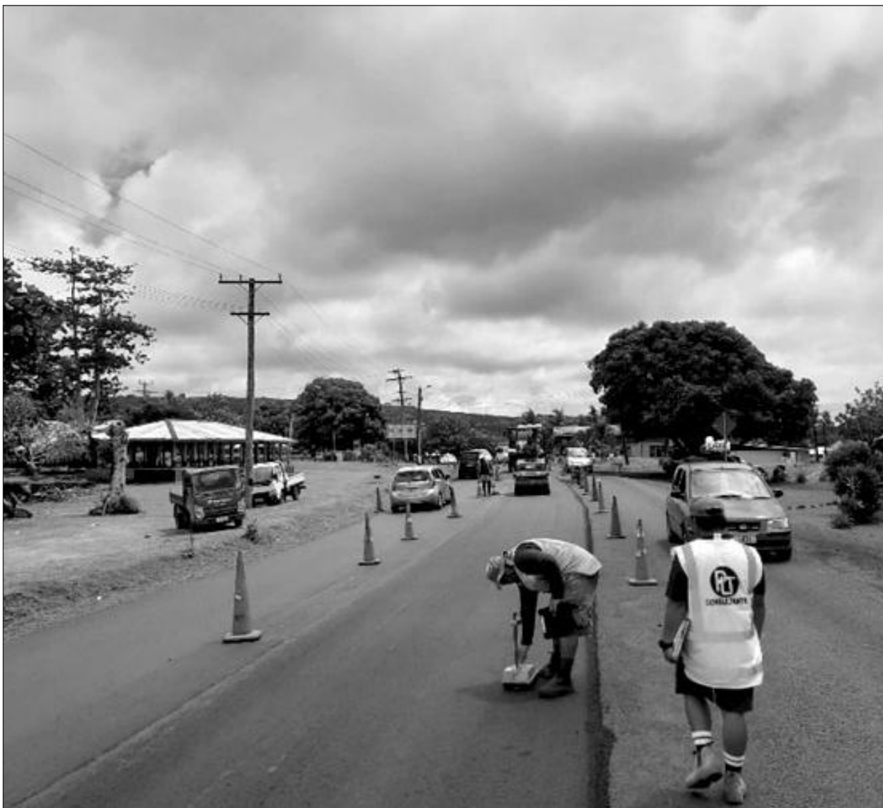
Galuega tele mo le auala fou mai Vaitele i Faleolo (Ata Pu'eina: LTA).

"O vaega lava o lo'o lauāluga i fonotaga o tulaga tau i le soifua mälölöina, a'oa'oga, si'osi'omaga ma punaoa fa'alēnatura, atina'e tau fa'ato'aga ma faigāfaiva, atoa ai ma tulaga tau i le puipuiga o le saogālēmū."