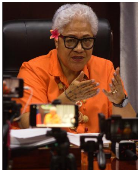
Prime Minister Fiame Naomi Mataafa

Cabinet had the opportunity to discuss the National ID Bill which will now be presented for Parliament's consideration. Although it has