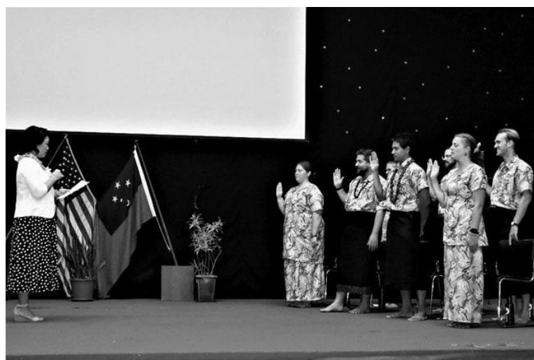
Chargé d'Affaires of the United States (U.S.) Noriko Horiuchi takes Pledge of Service for members of Group 92.