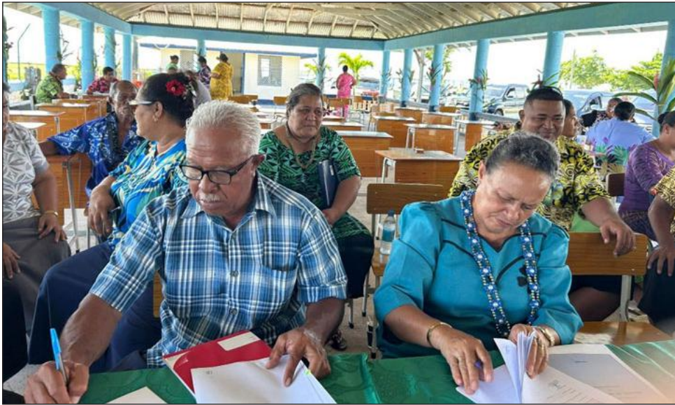
Representatives from the different schools that signed contracts for receiving of OGG funding in Savaii at the start of this week.