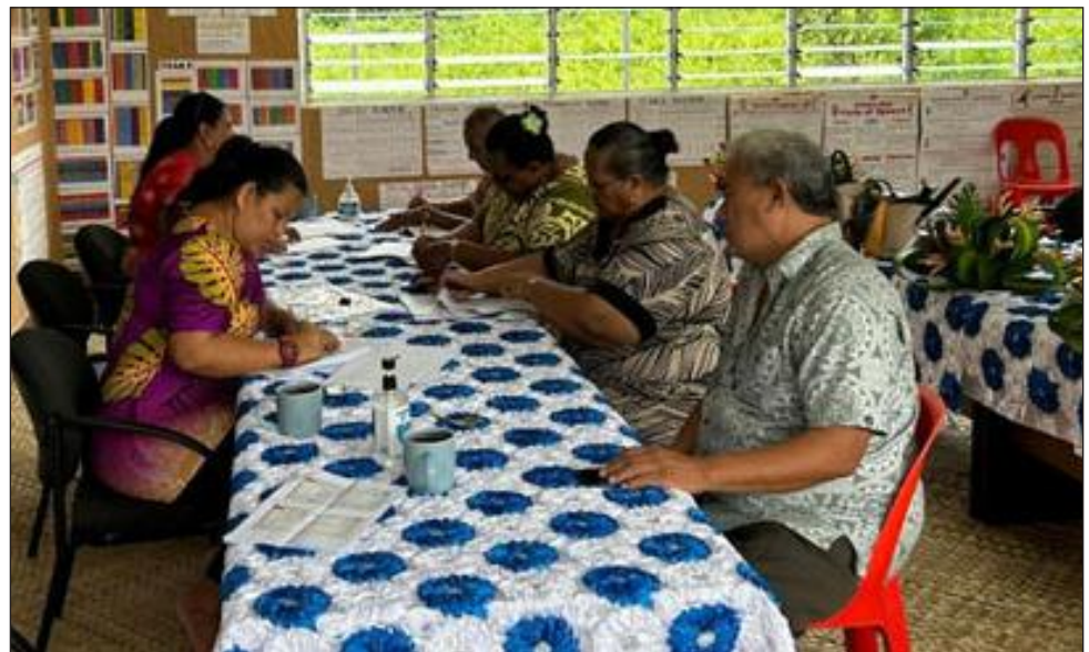
MESC Staff and representatives from schools in Upolu. (Photo: Ministry of Education, Sports and Culture (MESC) Facebook).

The Ministry's Facebook Page has informed however that all schools that have failed to come in over the allocated days for signing their agreements to please visit the MESC Headquarters next week Monday.