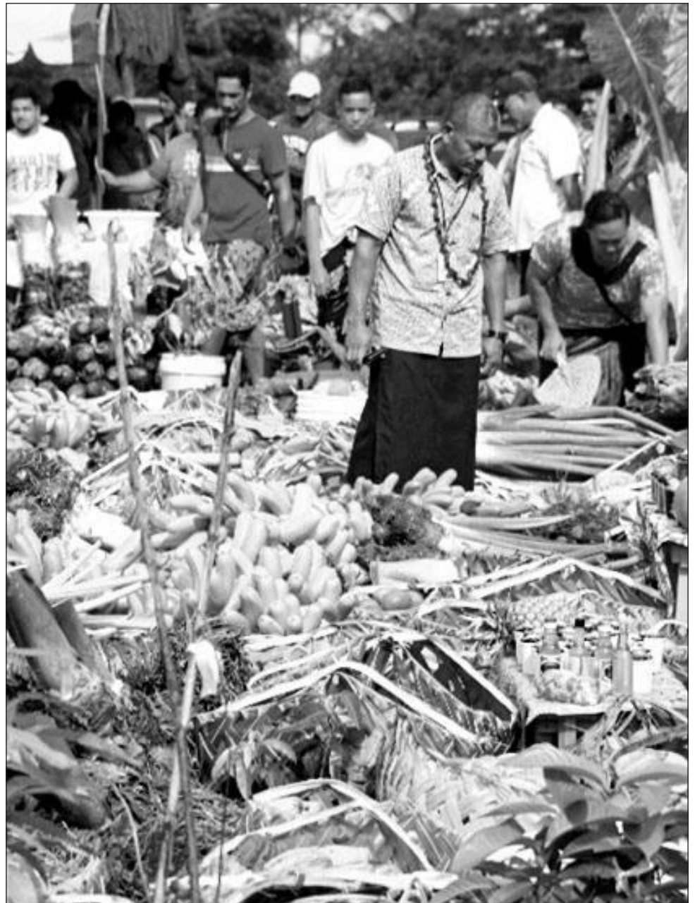
Mau meaai afio'aga ta'itasi o le Itumālō Palota o Ālataua i Sisifo mai fua o ā latou fa'ato'aga, o e tali fa'aaliali lea, e le'o oga taumafa Samoa.

O le Ulua'i Seleselega, o le fa'amamafa a le Mālō ia toe fo'i o tatou tagata e gagau le vao, e tua i ai mo a taeao, ae fa'apea fo'i i seleni mo le tausiga o 'āiga, tautuaina o nu'u, ekalesia fa'apea Samoa.