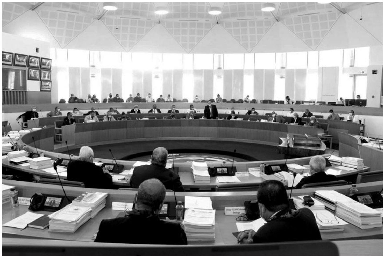
O le a tagofia e le Fono Aoaō Faitulafono, le Tulafono Tau Fa'aofi mo le Faia o le tatou National ID po'o le card e tu'uina atu i tagatānu'u o Samoa, e faigofie ai ona iloa fa'amaumauga o lona aso soifua, ma isi tulaga tāua (Ata Pu'eina: Ofisa Fa'afailautusi o le Fono Aoaō Faitulafono a Samoa).

mo le aga'i atu i le lumana'i, e mafai ai ona maua fa'amaumauga o tagata uma mai lava i le taimi fa'atoā soifua mai ai, ma fa'afaigofie ai ona tūpā auaunaga tau falema'i,