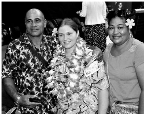
Se tasi o 'āiga Samoa sa fa'amautū ai pisikoa Amerika ma a'oa'oina ai le olaga Samoa moni a'o le'i amatalia la latou tautua i fanau lalovaoa o le atunu'u e ala i a'oa'oga. (Ata Pu'eina: Taunuuga Toatasi).