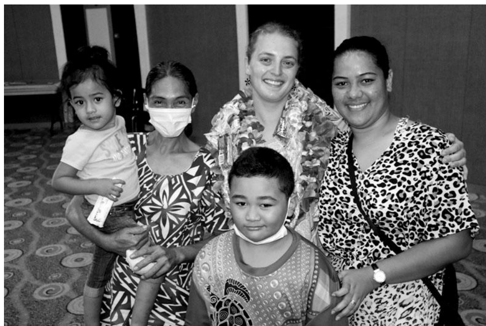
It's all smiles from proud members Samoan family members who were part of the event.

For more information, please contact the Senior Executive Services Division of our Office on telephone 22123 or email ses@psc.gov.ws