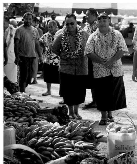
Fa'afafaiaina le Mālō i fua fa'aaliali o le soifua galulue o le pāia o 'āiga ma le Itumālō o Gaga'emauga #2 e ala i la latou Ulua'i Seleselega.

E tele ma anoanoa'i 'ele'ele e le'o fa'ato'aina i totonu o Samoa, o se itu sili lea ona silasila toto'a i ai Ta'ita'i, ina ia mafai ona taofiofi le so'ona malaga o tatou tagata i galuega fa'avaitaimi i isi atunu'u, ae mua'i gagau o le vao i tuāfale, e maua ai seleni e tele auā le tausiga o 'āiga ma le tautuaina o ekalesia ma nu'u.