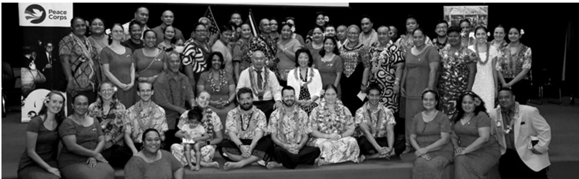
Peace Corps Group 92 is official and ready to serve in schools across the country to build English Literacy.