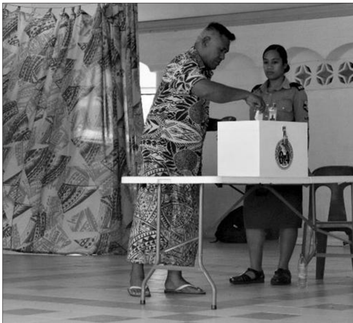
Se tasi o Fale Palota i le atunu'u

O le mae'a folasia ai o le lipoti i luma o le laulauāfono a le Palemene, o le a manino ai fautuaga a le Komisi Su'esu'e ma iloa ai po'o a ni lape sa māua mai le Faigā Filifiliga Tele a Samoa i le 2021.