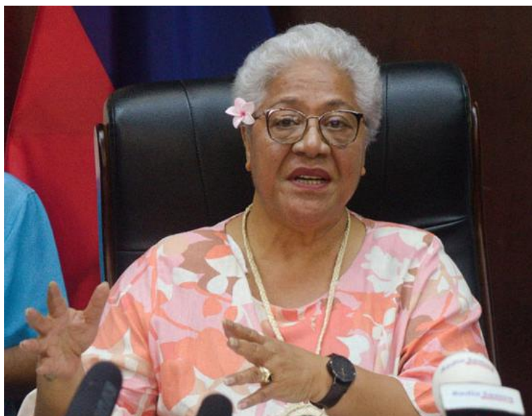
Palemia o Samoa – Fiamē Naomi Mataafa

O le fautuaga a le Palemia, o se lape i e na sa'ilia pepa o lea va'a ma faia isi gaoiga muamua, ae o lona taofiga, afai ua sao fa'asolitulafono mai, loka loa le auva'a ma taofi le va'a.