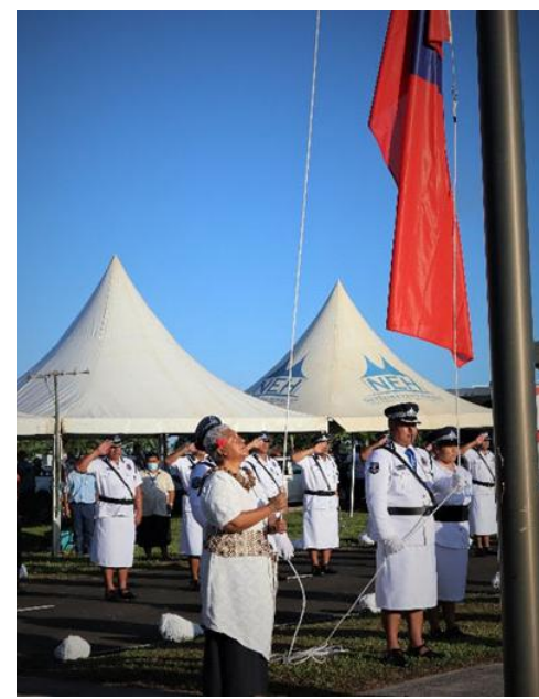
Sisi'iina a'e o le fu'a o Samoa i lona 60 tausaga