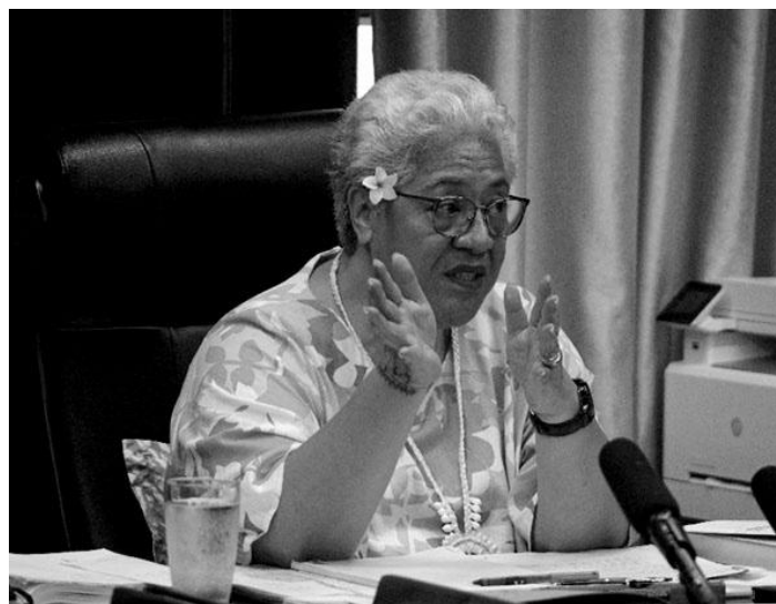
Afioga i le Palemia o Samoa – Fiamē Naomi Mataafa

"O le lē faia o siaki fa'afoma'i i taimi e tatau ai, atoa ai ma le lē fausia o fautuaga e tu'uina atu pea e le tatou Soifua Mälölöina, o mafua'aga ia o le fa'atupulā'ia pea o gasegase lē pipisi.