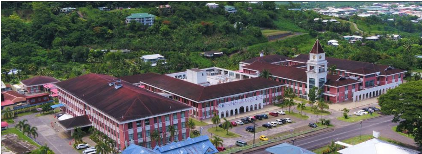
Tusia: Tusiga Taofiga

E le'o mautinoa pe feso'ota'i le maliu fa'afuase'i o se alualutoto 4 masina, ma lona tui puipui sa faia mo puipuiga o fanau mai fa'ama'i.