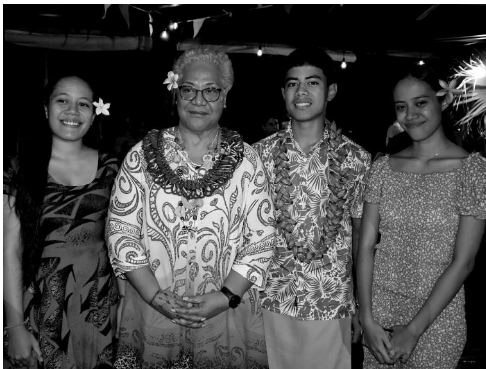
'Quench' with Prime Minister Fiame Naomi Mataafa.