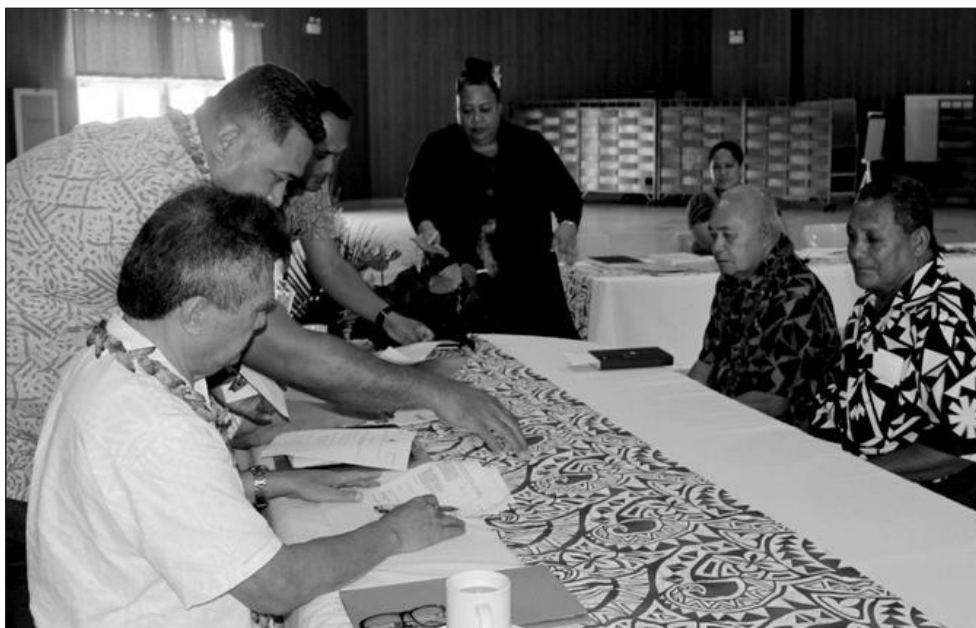
Minister of Finance Mulipola Anarosa Molioo with Minister of Women, Community and Social Development Leota Laki Lamositele Sio.