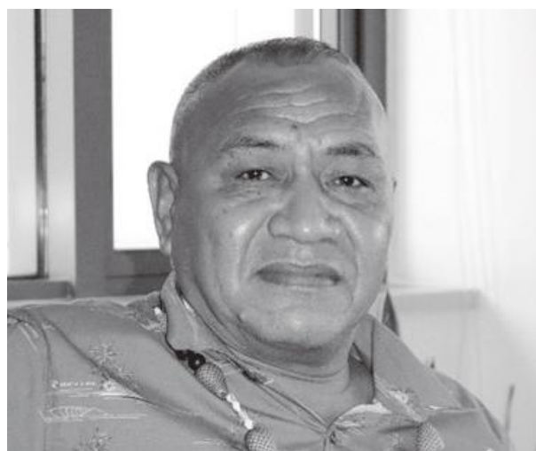
Minister of Works, Transport and Infrastructure (MWTI) Olo Fiti Afoa Vaai following interview with the Savali on Tuesday afternoon.

The airport situated a few minutes’ walk from the Royal Samoa Country Club is an attraction that brings many business people and residents of American Samoa to Upolu.