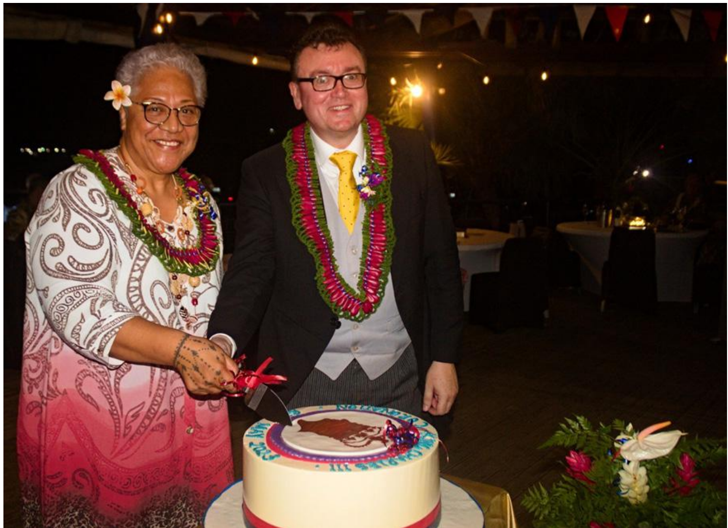
Prime Minister Fiame Naomi Mataafa with outgoing High Commissioner of the United Kingdom to Samoa David Ward at the celebration of his Majesty King Charles III coronation hosted by the High Commission of the United Kingdom in Samoa at the Sails Restaurant.

Mr. Ward, speaking at the celebration on