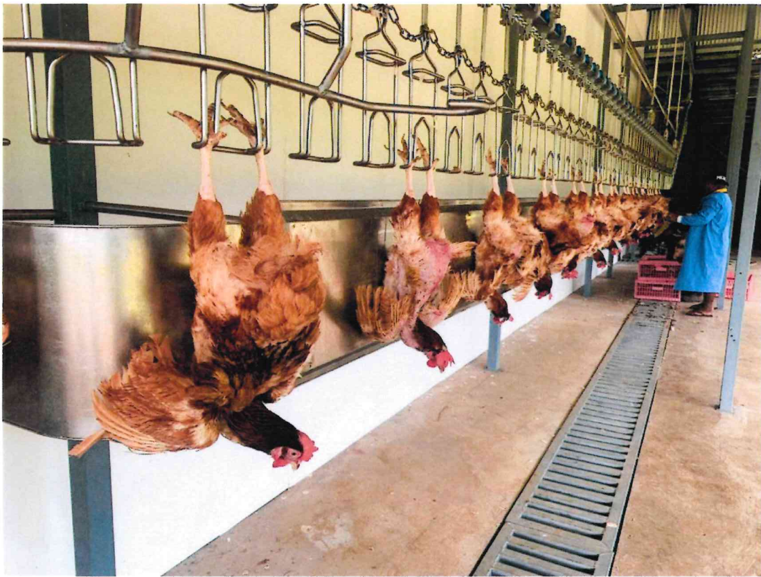
Photos: Broiler chickens at the start of the processing line