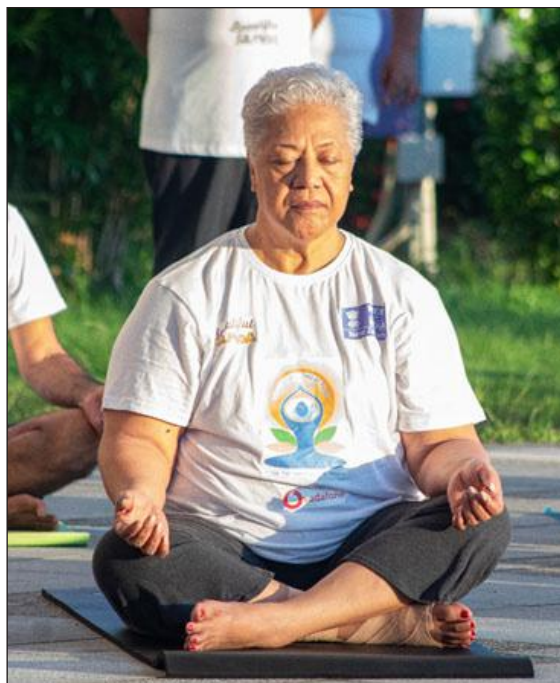
Prime Minister Fiame Naomi Mataafa.