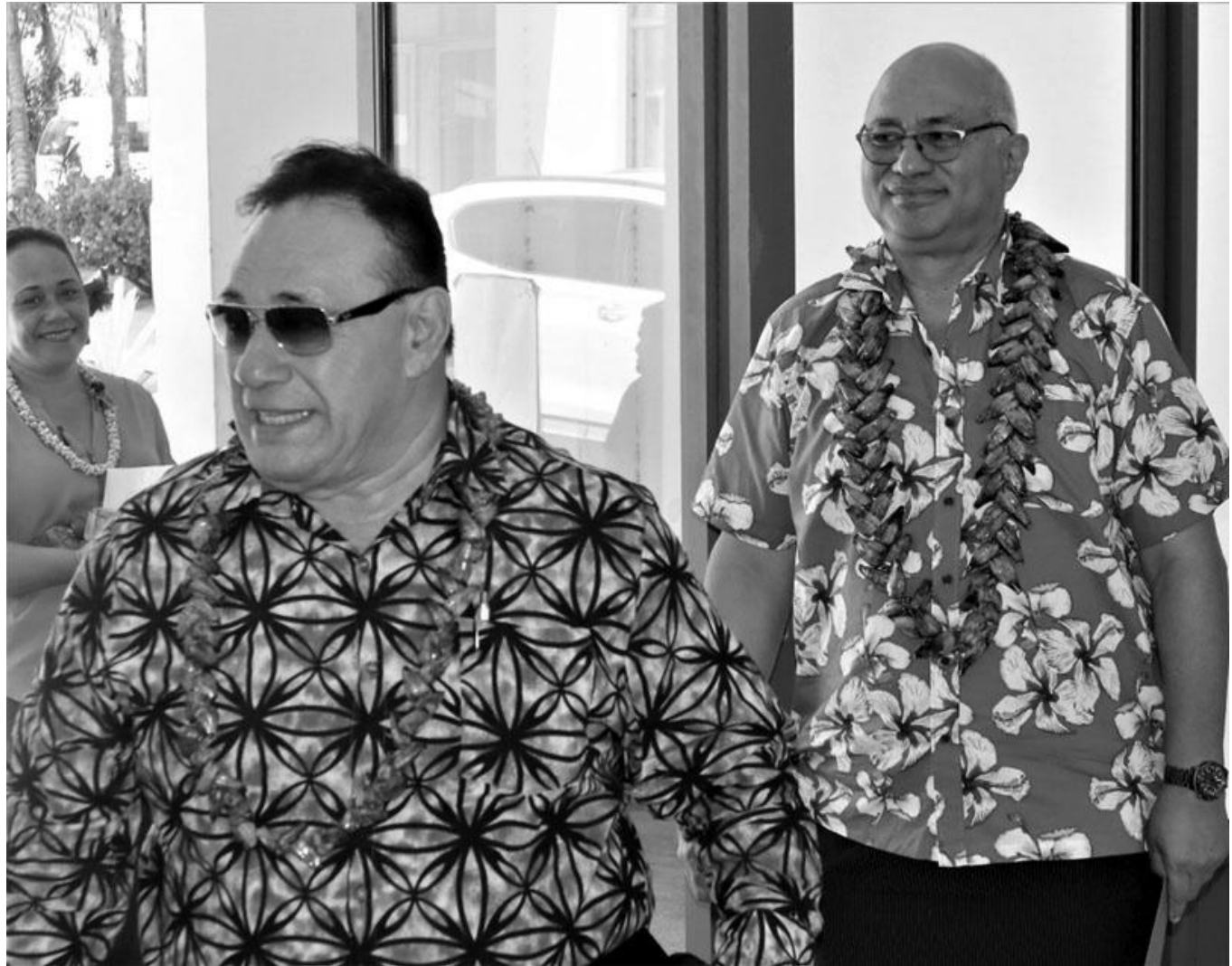
Minister of Health Valasi Luapitofanua To'ogamaga Tafito Selesele and Director-General of Health Aiono Dr. Alec Ekeroma.

Nonu also added that they are also exploring medical voluntary assistance from bilateral partners.