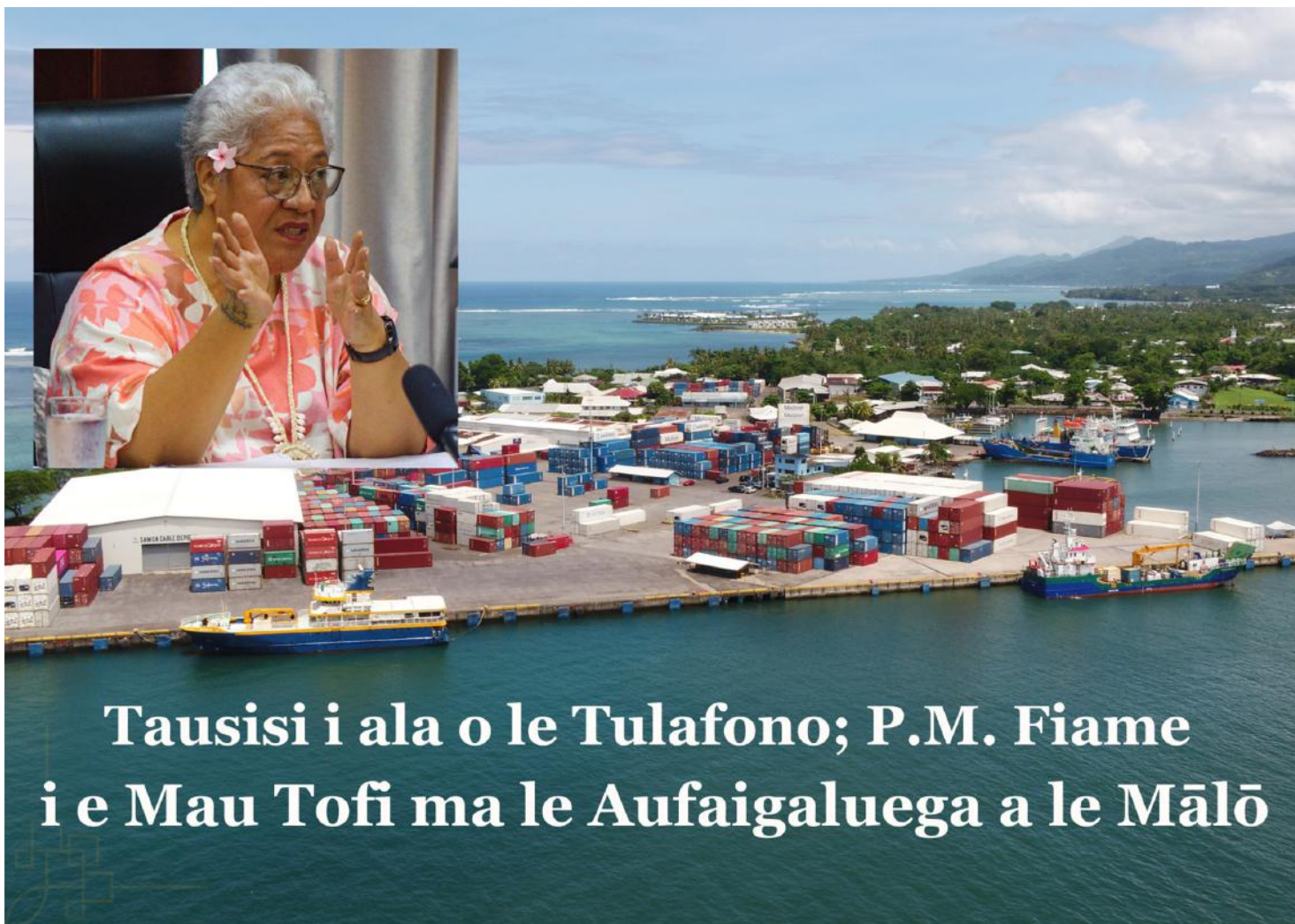
Afioga i le Palemia o Samoa, Fiamē Naomi Mataafa

O iinā na folasia ai lipoti a Pulega 'ese'ese a le Mālō o lo'o aofia i lea matā'upu. Na logoina e le Pulega o Uafu ma Taulaga le Matāgaluega o Tiute ma Tupe auā le fa'atinoga o siaki muamua e aofia ai ma siaki fa'alesoifua mālōlōina