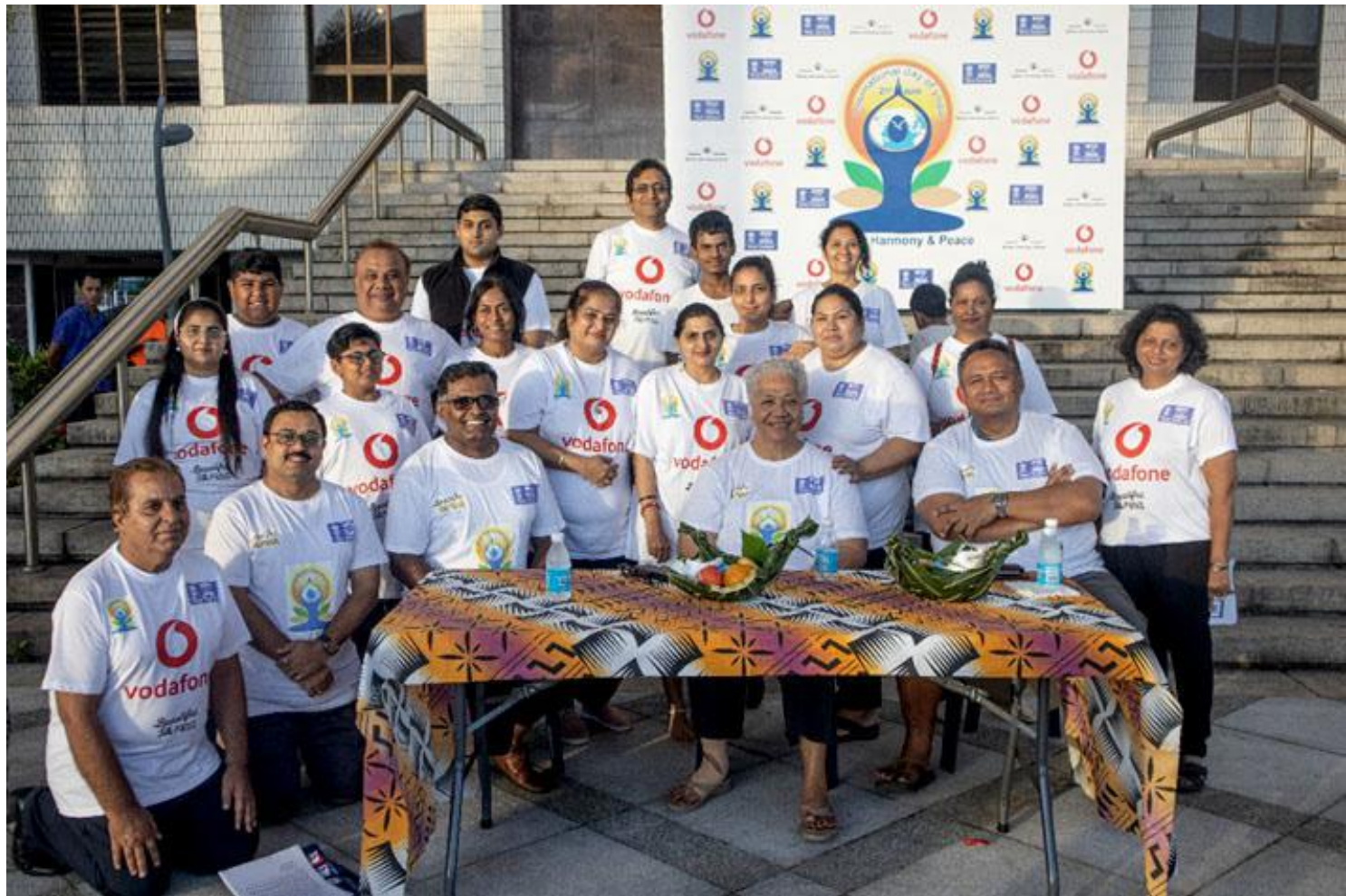
Prime Minister joins in celebrations for International Yoga Day.