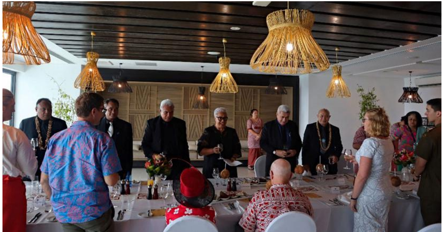
The Luncheon hosted by Prime Minister Fiame Naomi Mataafa that eventuated at the Sina Restaurant at Taumeasina Island Resort.

"I am confident that our friendship will continue to prosper bilaterally as well as through our shared membership in the Pacific Islands Forum."