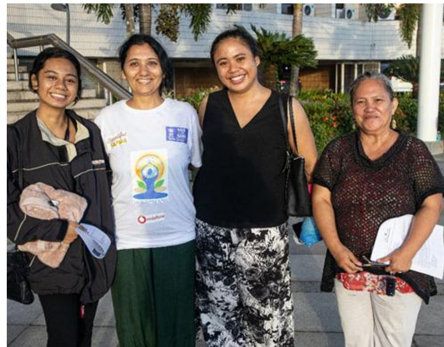
Guests who were at the event.