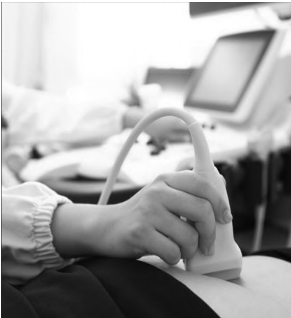
MoH boss recommends referral of ultrasound patients to private clinics due to this department at the TTMH being understaff.