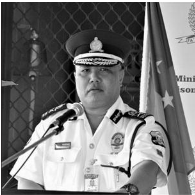
Komesina o le Matāgaluega o Leoleo, Falepuipui ma le Ola Toe Fuatā'ina iā 'Au'apa'au Logoitino Filipino.