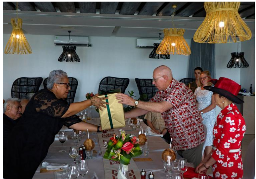
The Prime Minister and Governor - General exchanges gift.