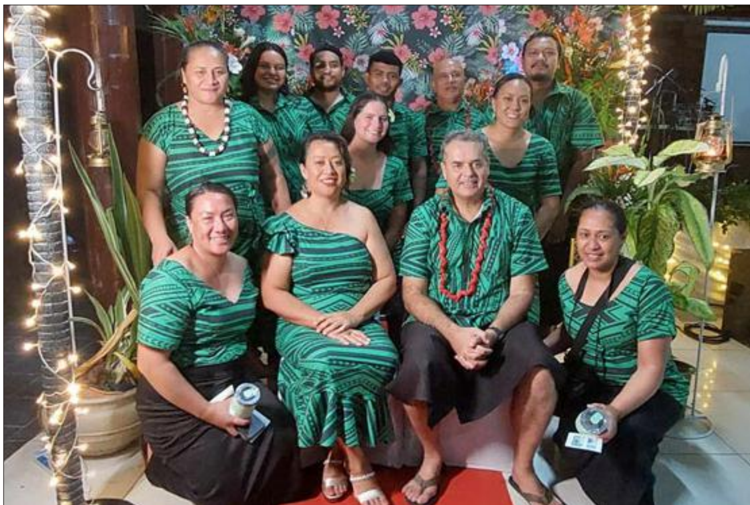
Samoa Conservation Society (SCS).

Feeling grateful for the ten years the Society