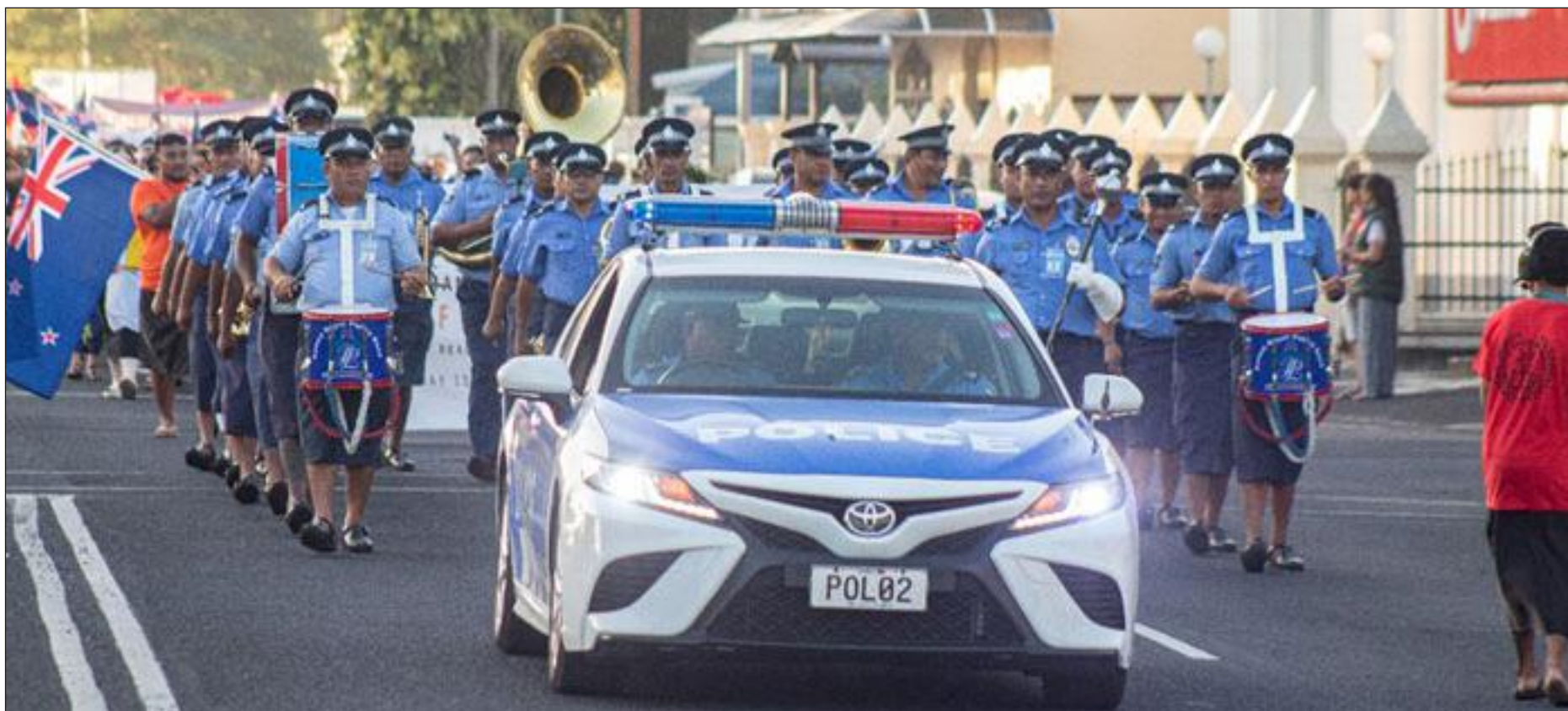
The parade was led by the Police Band.