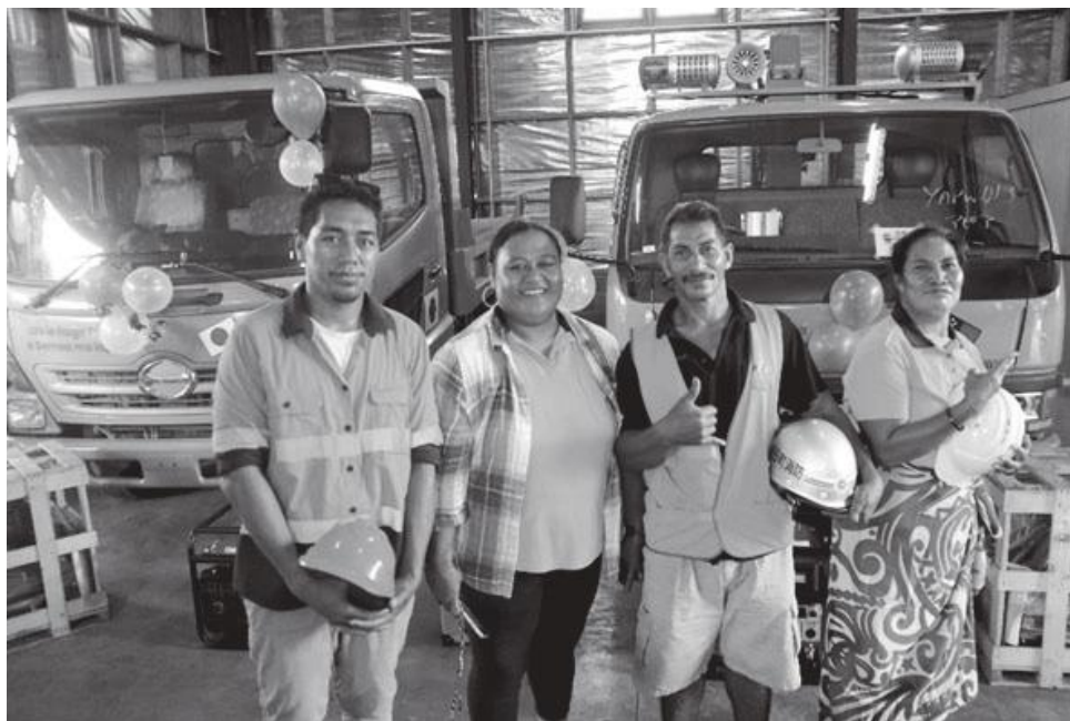
SRWMA staff following the handover ceremony of vehicles.

The first shipment has already left Samoa while two containers are standing on site, one already filled and the second close to being filled up but according to a member of the organisation their society has already over