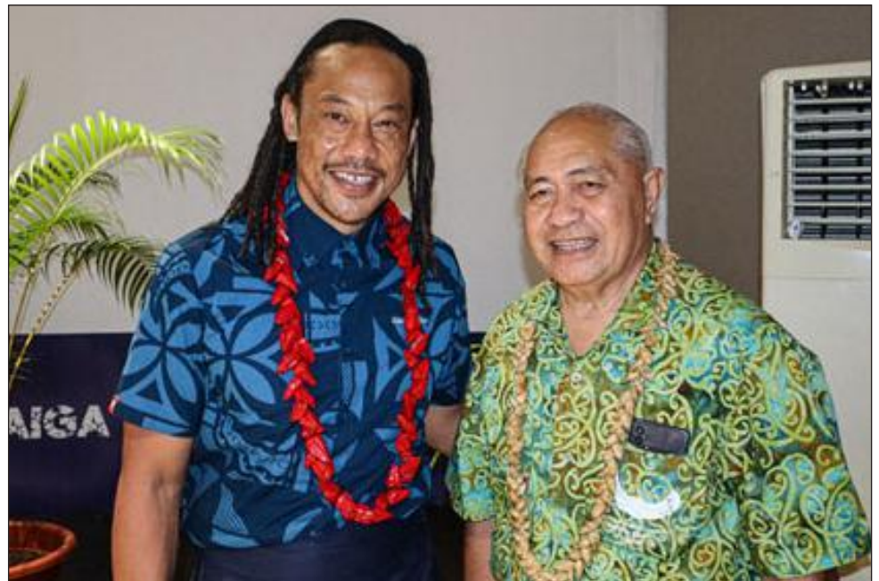
Defence Coach for the Manu Samoa team Tana Umaga with Honourable Minister of Education, Sports, and Culture, Seuula Ioane Taaau.