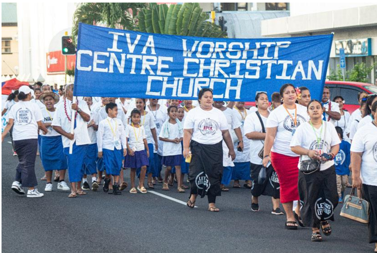
Members of the Worship Centre Christian Church Worldwide who marched the streets of Beach Road last Saturday 01 July 2023 officially opening their conference.

Center Christian Church Worldwide at Sogi soon followed the service.