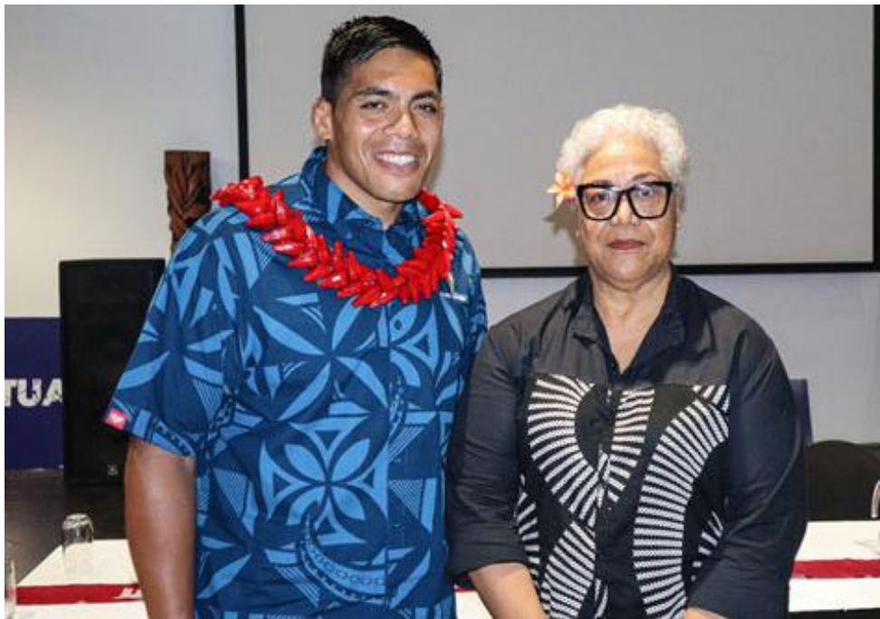
With support from the Prime Minister and rest of the country the team are ready for the Rugby World Cup 2023 in France this September.