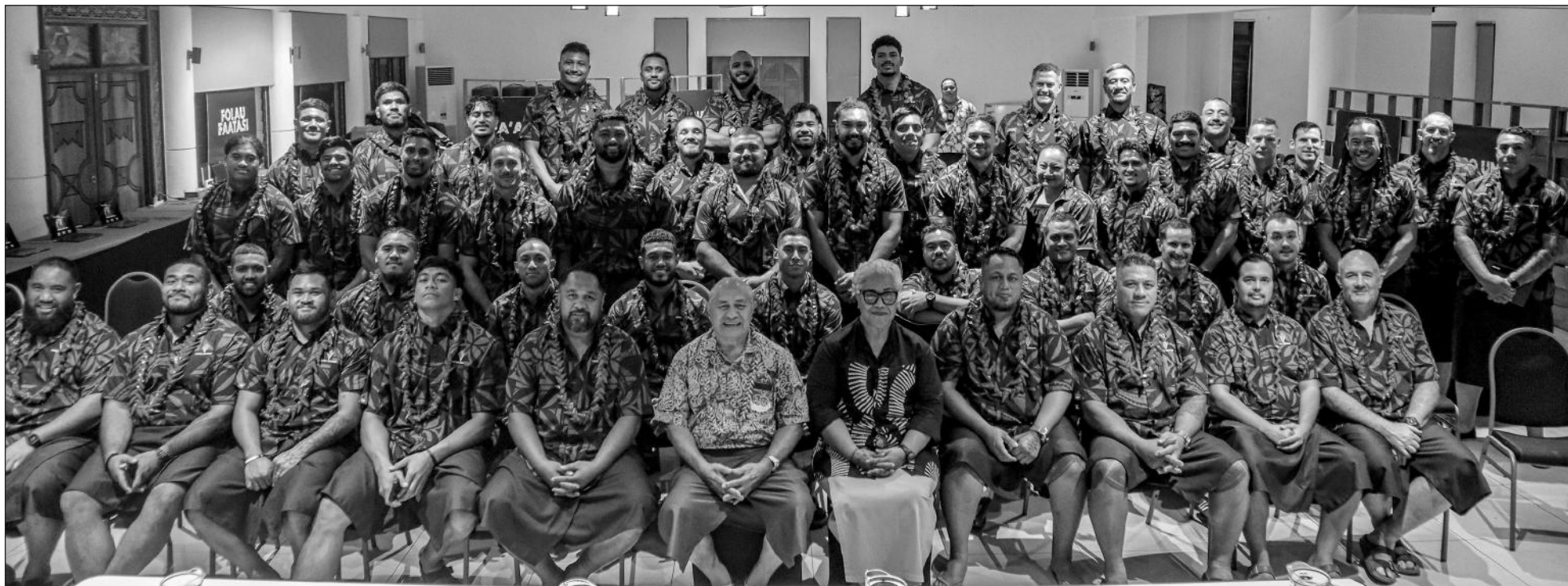
Tusia: Tusiga Taofiga

A'o alo atu le Manu Samoa 15 mo le Ipu o le Lalolagi i lenei tausaga 2023, na maua le avanoa e momoli ai le fa'amalosi'au ma le saunoaga fa'amanuia a le Ta'ita'i o le Mälö iä Fiamē Naomi Mataafa i le Pulega fa'apea le au atoa, auā a latou tapenaga mo lea fa'amoemoe fa'avāomälö.