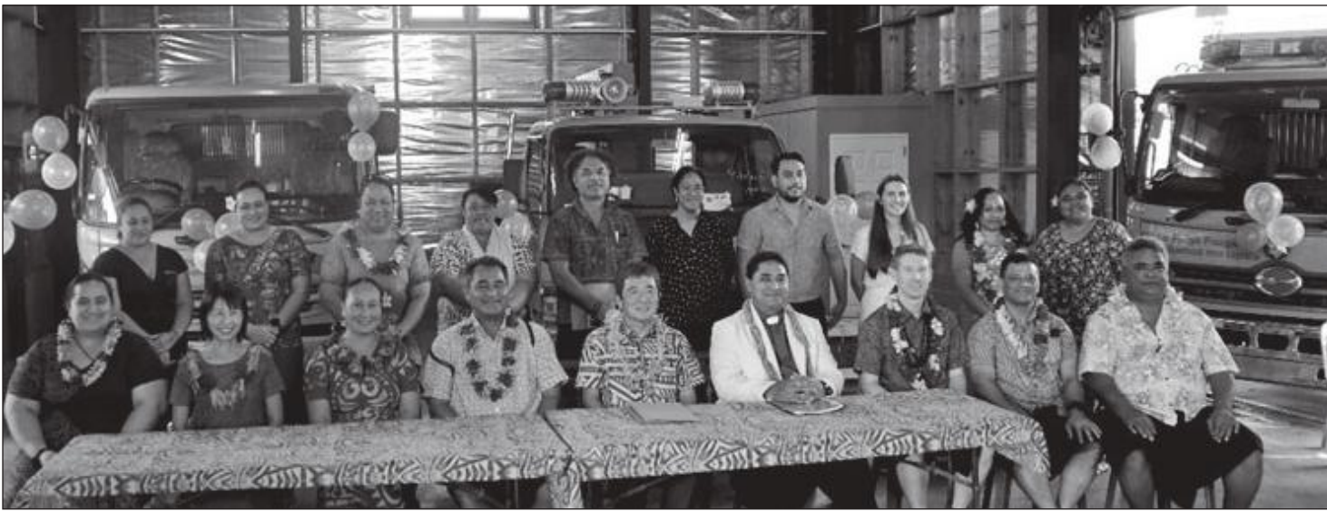
All for sake of Waste Management. Various partners in the environment sector came together to celebrate the continuous work of SRWMA.