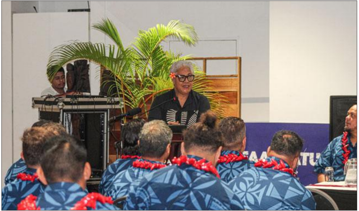
Prime Minister of Samoa Honourable Fiame Naomi Mataafa, "...win or lose, you are our team!"

“I don’t need to tell you as athletes all the benefits that we gain from playing sports, the development of skills, the building of your physicality, the developing of teamwork, learning how to work collectively, build trust