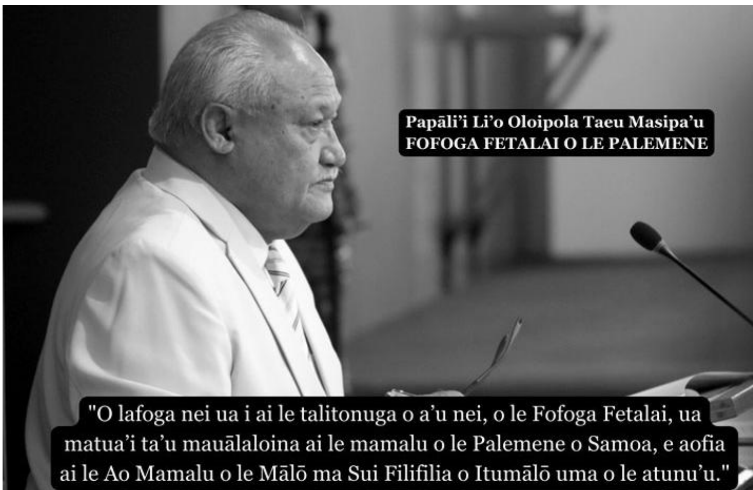
Papāli'i Li'o Oloipola Tāeu Masipa'u FOFOGA FETALAI O LE PALEMENE

"O le Palemene fo'i, e lima ona matāfaioi tūtofa fa'alefa'avae, ae peita'i o le matāfaioi aupito i sili ona tāua, o le Pule e faia ai o Tulafono. O le malosi'aga lea, e na'o le Palemene lava e mafai ona o latou fa'atinoina e tusa ai ma le Matā'upu 43 o le Fa'avae. O i fo'i, e feso'ota'i ai Itutino Fefa'atauagai o le Faigāmālō, e i ai le Palemene, Fa'amasinoga ma