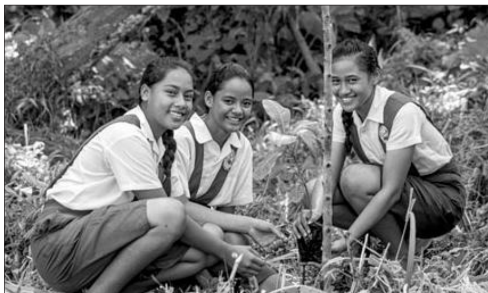
Fanau mai le Kolisi o Faleata mo le totōina o lā'au

E malosi le lagolago a Samoa, i le fa'atino o gaioiga 'ese'ese e fesoasoani ai i le tu'u'itiiti o a'afiaga o le lalolagi mai suiga ogaoga o le tau, auā a tele mala fa'alenua e a'afia ai le