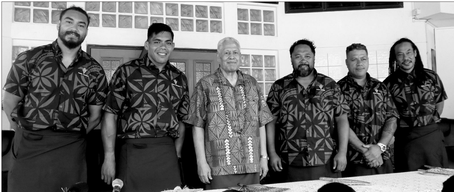
Tusia: Taunuuga Toatasi

“Auā pe afai e ‘au le Atua ma ōtoutu i ā outou taumafaiga uma, po’o a lava fitā ma faigatā o le a feagai ma outou, e lē taumate o le a a’e manuia outou faiva.