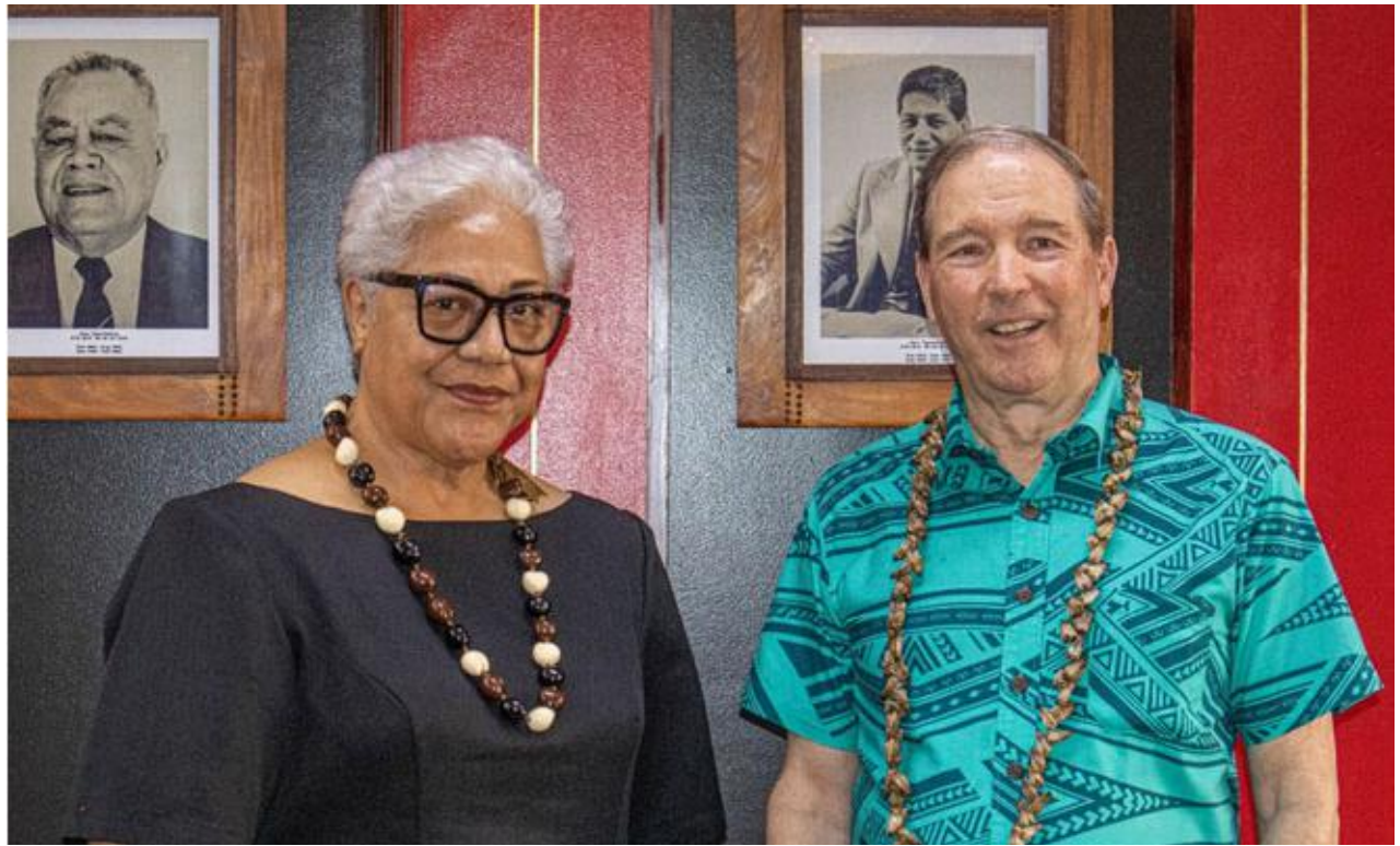
Prime Minister of Samoa, Honourable Fiame Naomi Mataafa and U.S. Ambassador to Samoa H.E. Thomas Stewart Udall.

Ambassador Udall in his current role travels over to Samoa and when he can and spends a month here to cater to the needs directly associated with his portfolio.