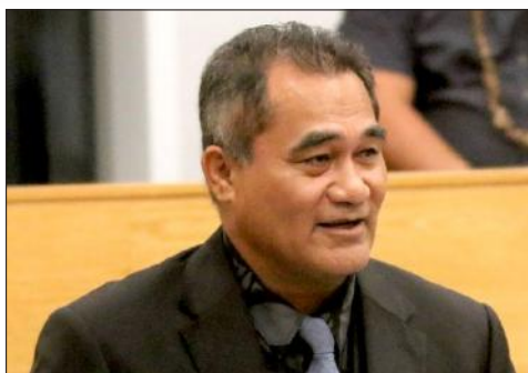
Minisitā o le Matāgaluega o Punaoo Fa’alenatura ma le Si’osi’omaga (M.N.R.E.) iā Toeolesulusulu Cedric Posē Schuster

Na fa’ailoa e Toeolesulusulu o lo’o matuā malu lelei so’o se fanua fa’aleaganu’u i lalo o le Tulafono 1965.