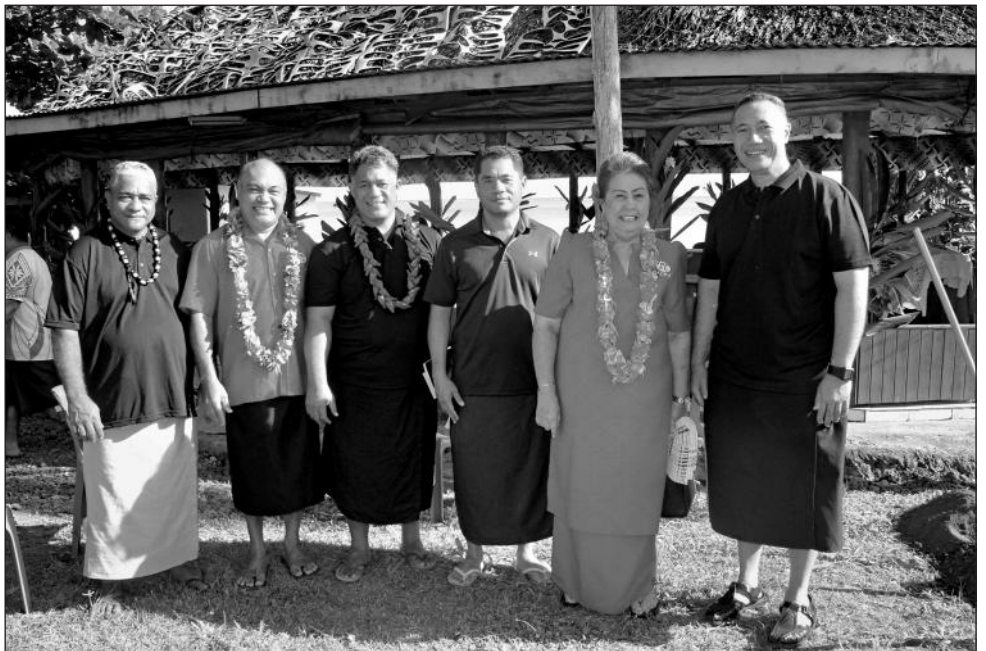
Sui o le A.D.R.A Samoa ma Sui o le Nu'u o Tufulele