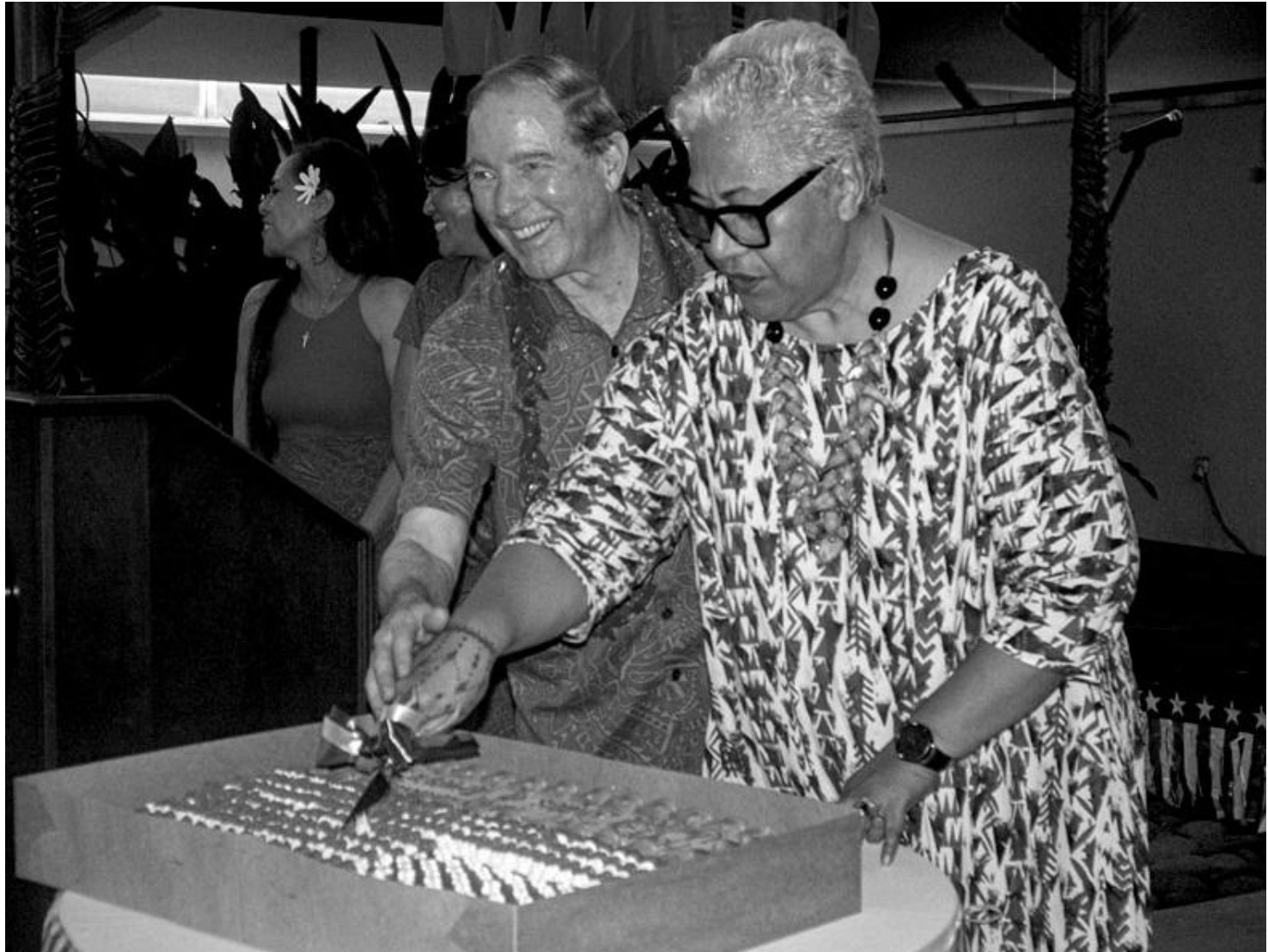
U.S. Ambassador to New Zealand and Samoa H.E. Thomas Stewart Udall with Samoa's Prime Minister Honourable Fiaame Naomi Mataafa at the official cutting of the 4th of July Cake for commemorations of the United States of America's 247 years of Independence.

The Prime Minister also emphasised that the U.S. has been engaged in social infrastructure