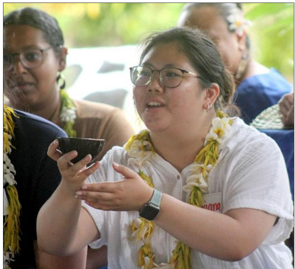
A member of Group 93 accepts her ava during the welcoming ceremony hosted by the Ministry of Education, Sports and Culture (MESC).

The Peace Corps was established by President John F. Kennedy on March 1, 1961. Peace Corps is about promoting world peace