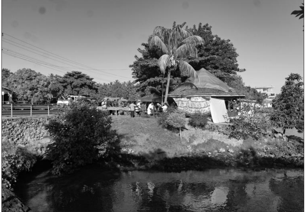
Vai Ta'ele a Tafulele