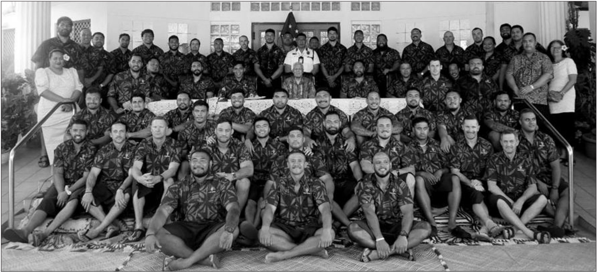
Samoa's Head of State, Afioga Tuimaleali'ifano Va'aletoa Sualauvi II extends his best wishes to the management and team of the Manu Samoa.