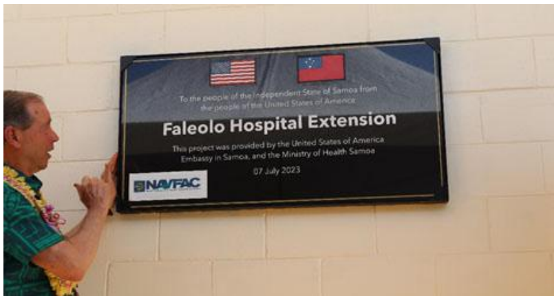
U.S. Government and U.S. Ambassador to Samoa and New Zealand H.E. Thomas Steward Udall unveils the Faleolo Hospital Extension plaque.

Programme for the official handover ceremony of the New Extension of the Faleolo District Hospital last Friday 7th July 2023. The extension was funded by the U.S. Government and U.S. Ambassador to Samoa and New Zealand H.E. Thomas Steward Udall handed over the keys of the new wing to Minister of Health, Honourable Valasi Luapitofanua To'ogamaga Tafito Selesele with unveiling the Faleolo Hospital Extension plaque.