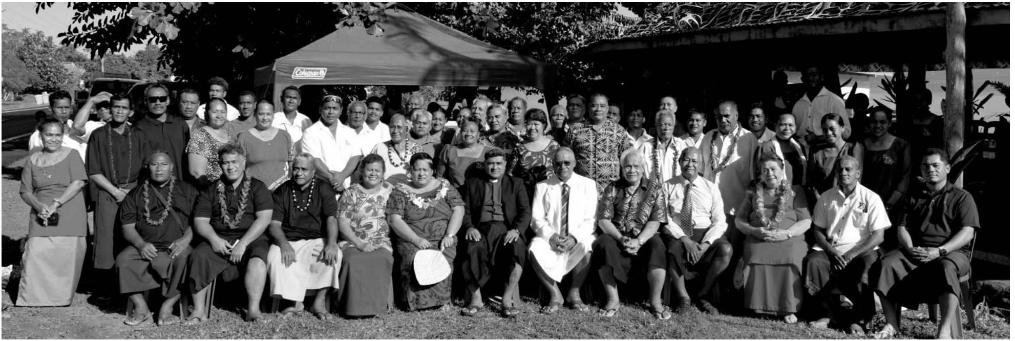
Sui o le A.D.R.A Samoa fa'apea le mamalu o le afio'aga o Tufulele