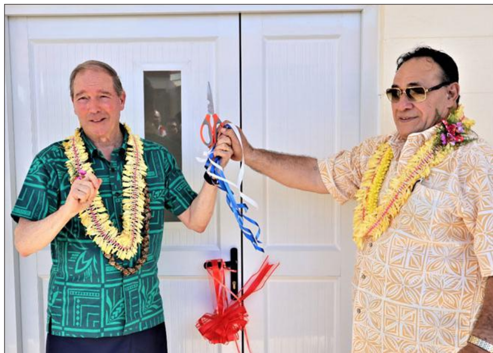
U.S. Ambassador to Samoa H.E. Thomas Stewart Udall with Minister of Health Honourable Valasi Luapitofanua Toogamaga Tafito Selesele after the official cutting of the ribbon declaring the hospital ready for use.

"This project amounting to $1,337,306 million tala was united states military funded - was entirely financed by the United States