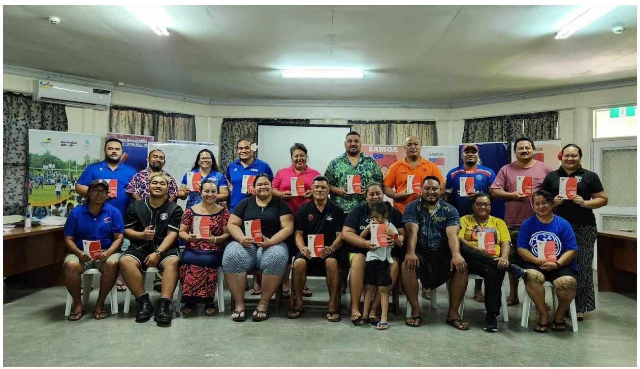
Team Managers receiving First Aid Essential Emergency Care for First Aiders Manuals from Red Cross Facilitators