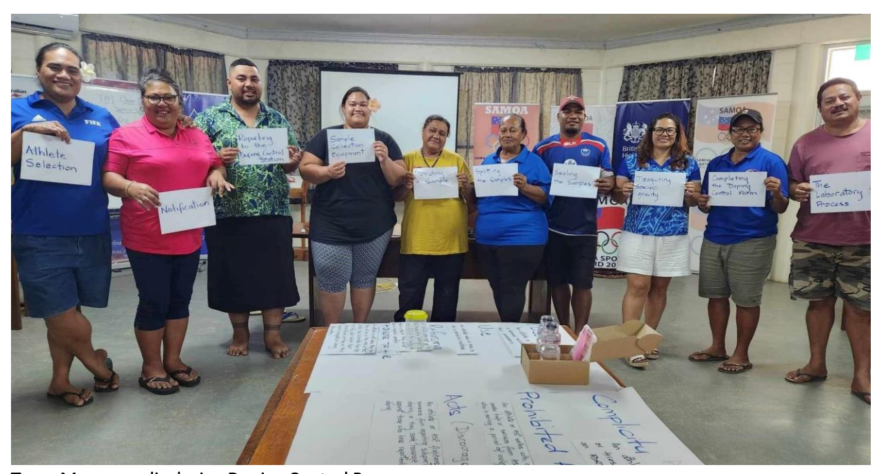
Team Managers displaying Doping Control Process.