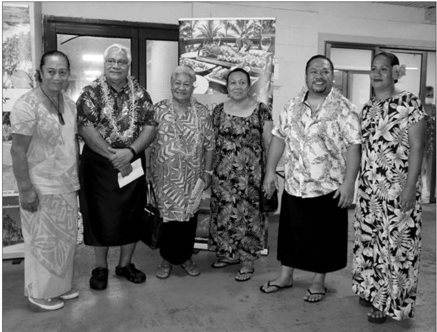
Punialava’a provides financial support to SNKF.

SNKF receives financial support from the Methodist and Congregational Christian Church of Samoa women committees, donations from businesses and the Government.