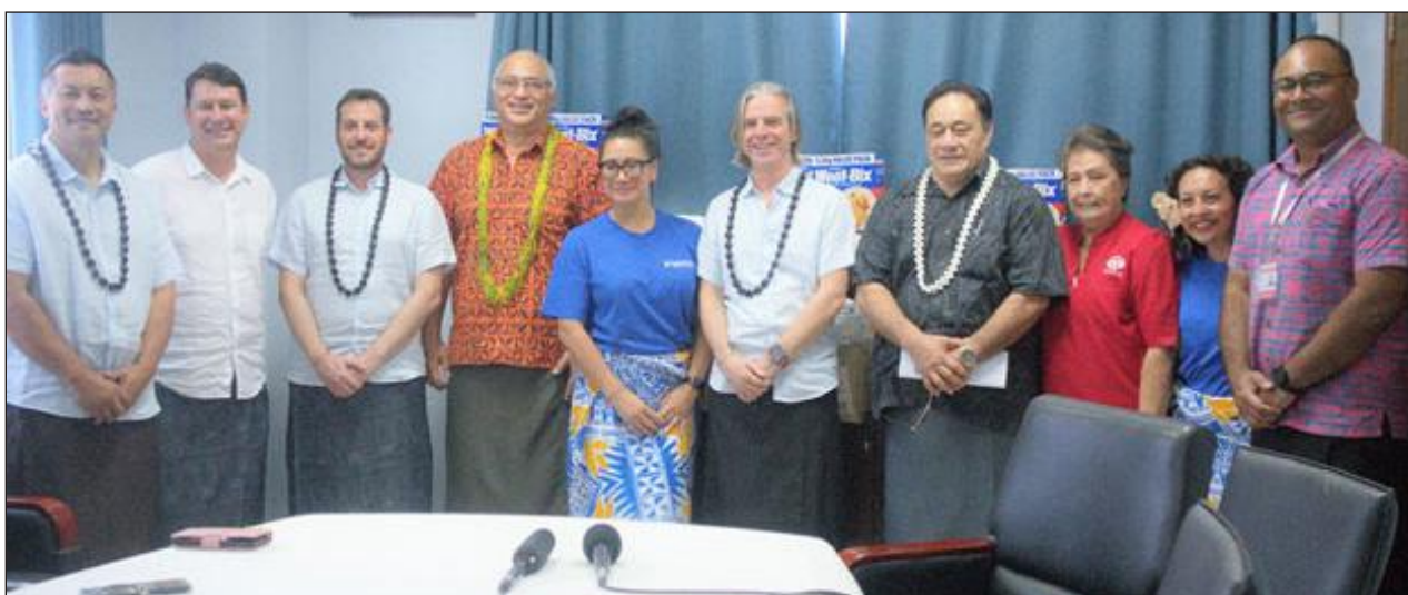
Sui o le Sanitarium mai Niu Sila, Sui o le Fa'alapotopotoga a le A.D.R.A. Samoa ma le afioga i le Minisitā, o le Fa'atunu Sili Aoao ma le Sui Fa'atunu Sili Aoao o le Matāgaluega o le Soifua Mālōlōina i le taulimaina o le foa'i fa'apitoa mai lea samaria agalelei auā le auunaga fa'alesoifua mālōlōina i le atunu'u.