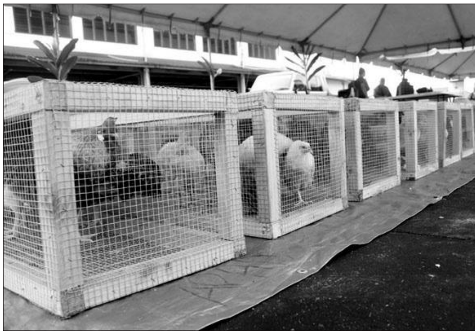
Fa'afai'ele e le Matāgaluega o Fa'ato'aga ma Faigāfaiva ia moa Samoa ma fa'asoa atu i le aufailafumoa o lo'o mana'omia lenei fa'amanuiaga.

O lo'o tapena fo'i e le Matāgaluega nisi o meaai mo moa i le nofoaga a le Matāgaluega i Nu'u. O lea fa'amoemoe ua mafai ona fa'ataunu'u ona o le lagolagosua a le pa'aga a le Matāgaluega le F.A.O.