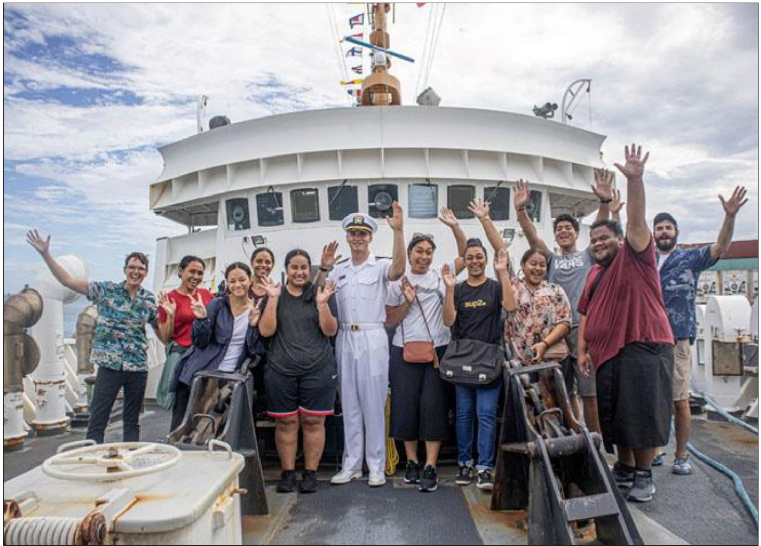
Students from NUS and UPS with NOAA crew members.

Seeing all the students studying in the fields of science their team are working in is inspiring