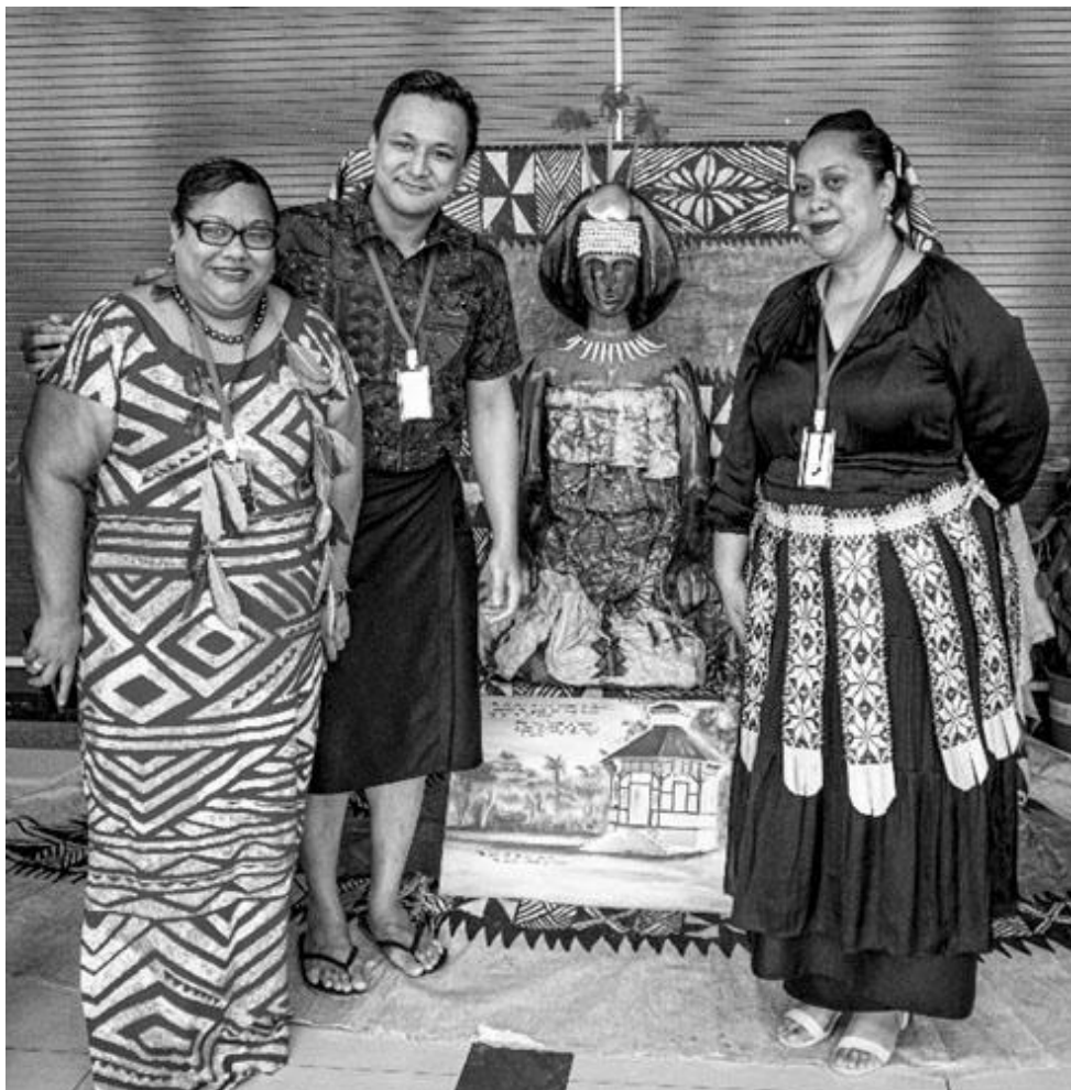
Nisi o loia i Samoa nei ma isi atunu'u o le Pasefika.

“E i ai i latou ua i ai o latou tomai fa'apitoa, e agava'a ai latou te fa'atinoina lea galuega.