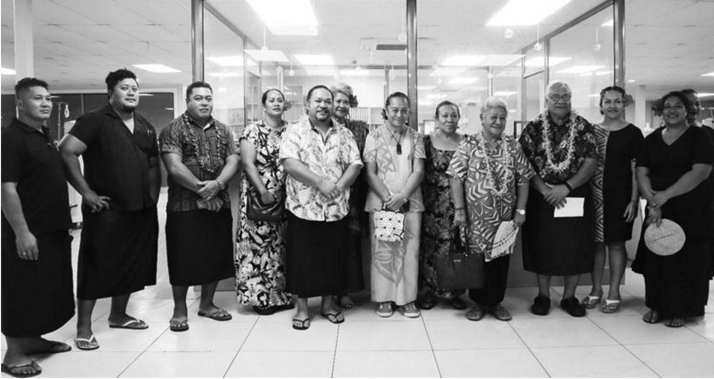
Fesoasoani a le Punialava'a mo le Fa'alapotopotoga Fa'avae Tau Fatuga'o i le atunu'u (N.K.F.) – Ata Pu'eina: Taunuuga Toatasi.