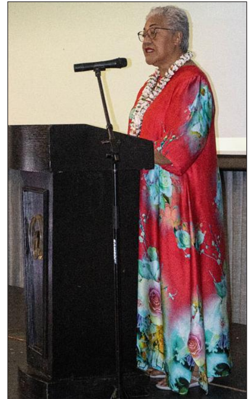
Samoa’s Prime Minister Honourable Fiame Naomi Mataafa during her address at W.H.O.’s 75th Anniversary.

The celebration was held at the Taumeasina Island Resort on Thursday night and was attended by the Prime Minister, Minister of Health Honourable Valasi Luapitofanua Toogamaga Tafito Selesele, Government Officials, W.H.O. representatives and staff, and members of the diplomatic corps.