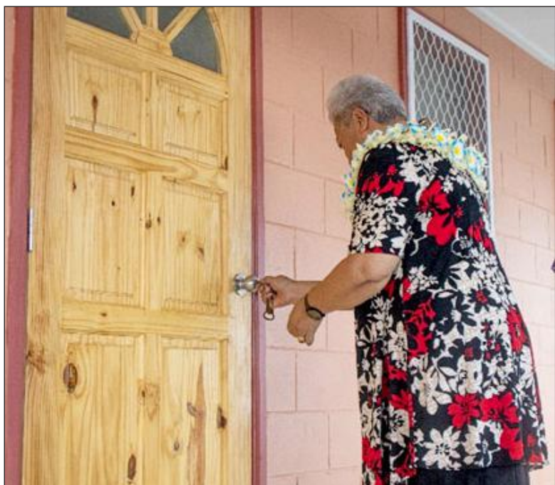
Tatalaina e le afioga i le Palemia iā Fiamē Naomi Mataafa o le Ofisa Autū o le Fono Fa’avae o le Itumālō Palota o ‘Āiga i le Tai.