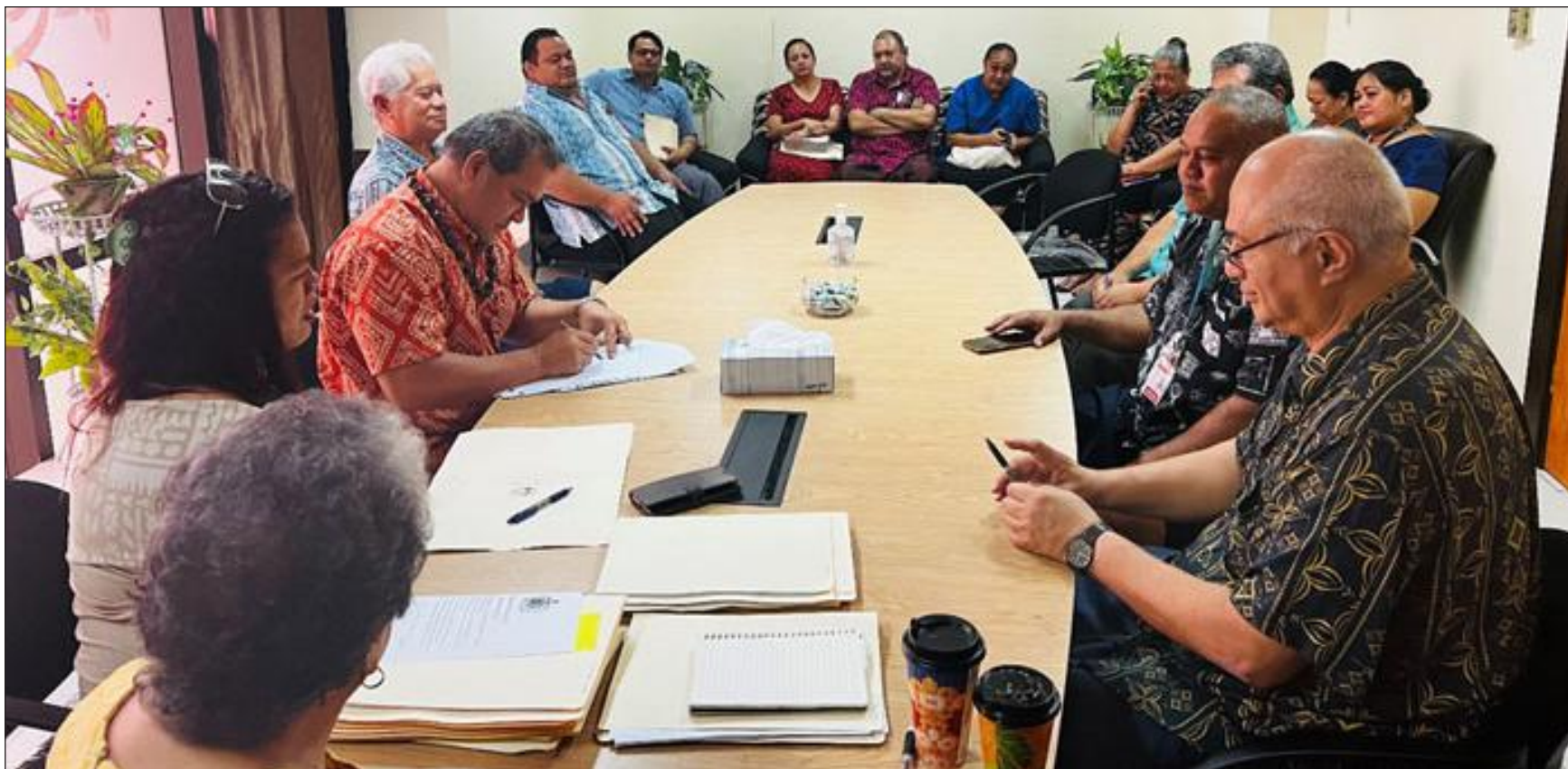
Contract signing for Senior Doctors.

The minister said it was his prayer that the qualifications attained will pave the way for graduates to easily secure jobs to support their families, and their parents to make a small but significant contribution to Samoa's economy.