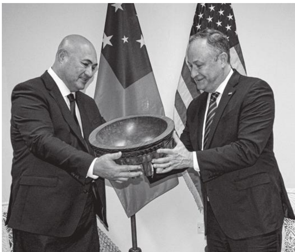
Acting and Deputy Prime Minister Honourable Tuala Tevaga Iosefo Ponifasio with Second Gentleman Douglas Emhoff.

The $2.6 million is from the U.S.A.I.D.'s Bureau for Humanitarian Assistance (U.S.A.I.D.