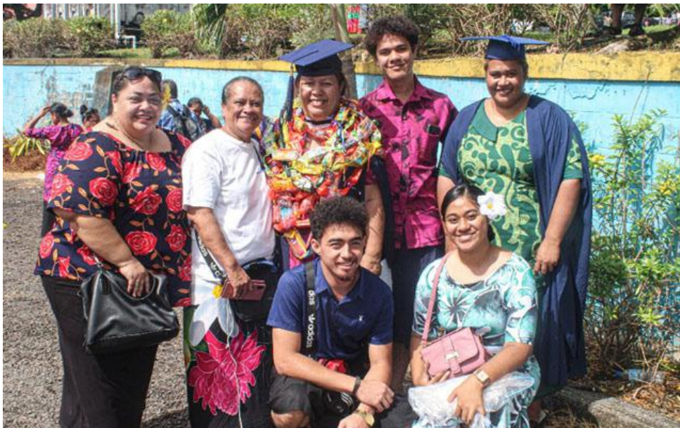
Laufofoga fiafia o le 'āiga i le fa'aeaina o e pele i loto ona ua i'u manuia a'oa'oga sa feagai ai.

o le galuega a le Ofisa o Femalagā'iga, atoa ai ma tapenaga mo le taligāmālō a Samoa i le Fono Tele a Ta'ita'i o le Mālō o le Taupulega iā Oketopa o le tausaga fou.