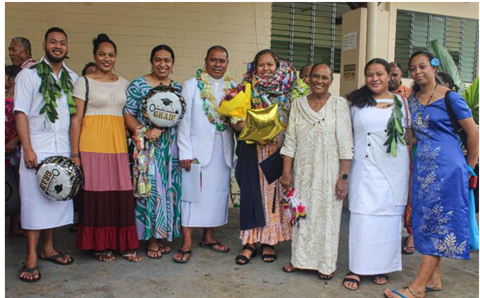
Se tasi o tama'ita'i sa fa'apaleina i se tasi o fa'ailoga tauāloa mai le Lunivesite Aoa o Samoa (N.U.S.) – Taunuuga Toatasi.