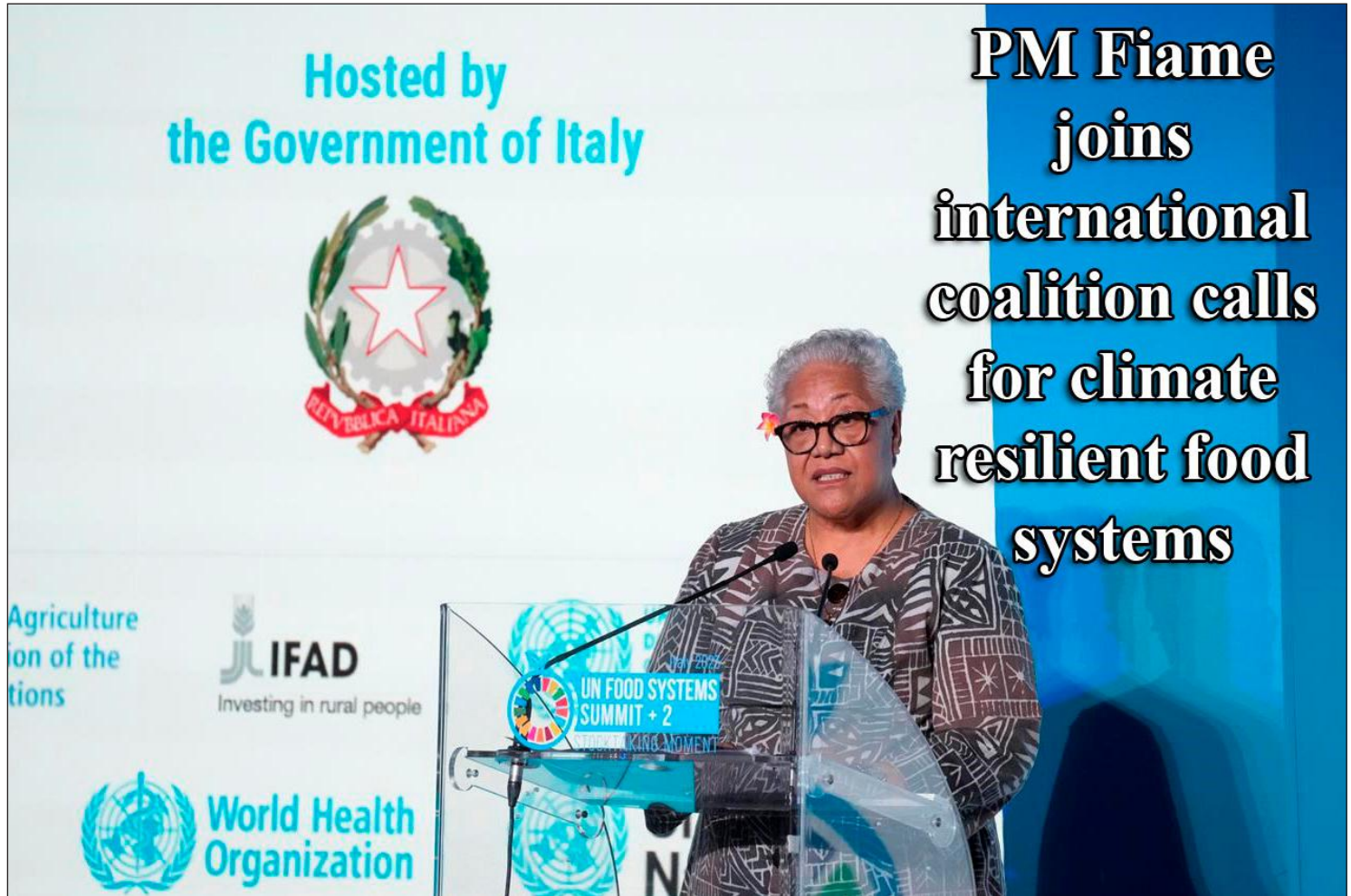
Prime Minister of Samoa, Honourable Fiamē Naomi Mataafa addresses the assembly during the opening session of a three-day U.N. Food and Agriculture Agency's summit on food systems in Rome, Monday, July 24, 2023.