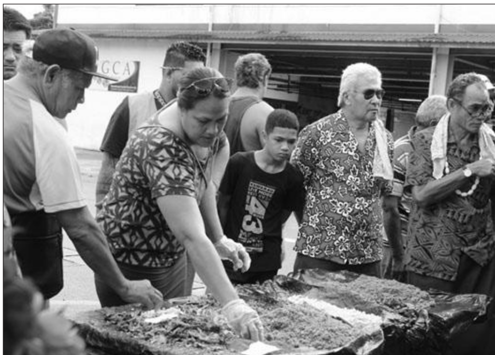
Meaai a Moa (Ata Pu'eina: Leaosa Fa'aifo Fa'aifo / Matāgaluega o Fa'ato'aga ma Faigāfaiva).