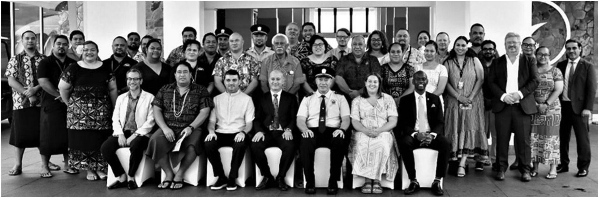
Participants of the national consultations.