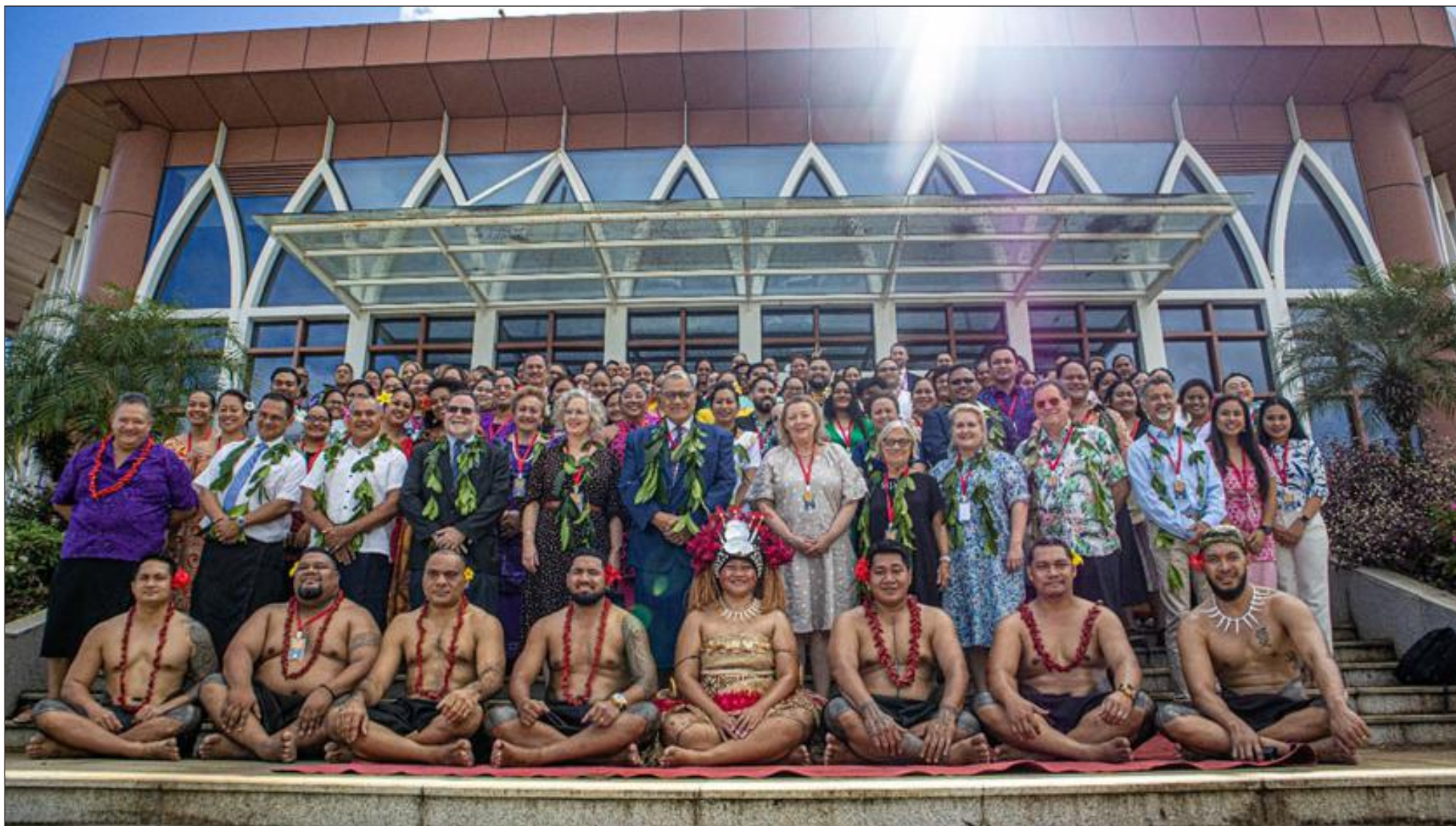
Participants at the Pasefika Lawyers Collective Continuing Professional Development Conference.