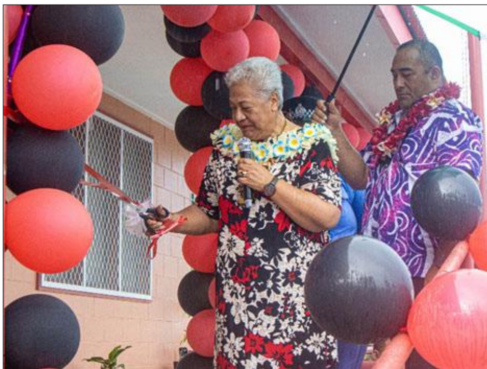
‘O’otina o le lipine e le afioga i le Palemia, Fiamē Naomi Mataafa mo le Ofisa o le Fono Fa’avae a ‘Āiga i le Tai.