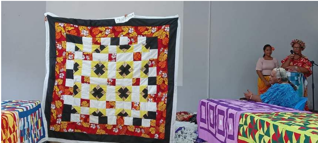
Sheet Design: Using pieces of wasted fabric.