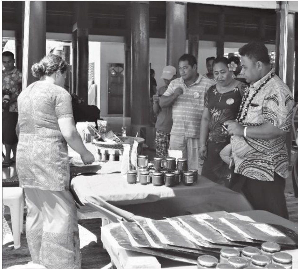
By-products created from Cocoa (Koko) on show at the event.

"So, let today be a call to action – a call to revive the cocoa industry in Samoa through innovation, development, and a renewed sense of purpose. Together, we can build a brighter future filled with vast business opportunities and sustainable growth."