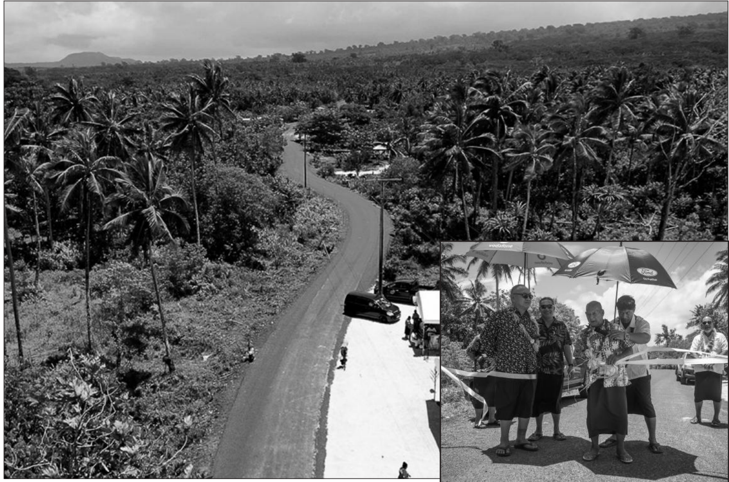
before extending another thanks to the Chief Executive Officer (C.E.O.) of the L.T.A.