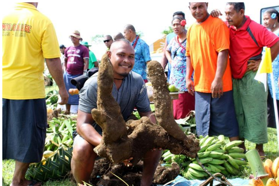
Tulaga 'ese fua o fa'ato'aga mai 'ele'ele o Falealupo. (Ata Pu'eina: Matāgaluega o Fa'ato'aga ma Faigāfaiva).