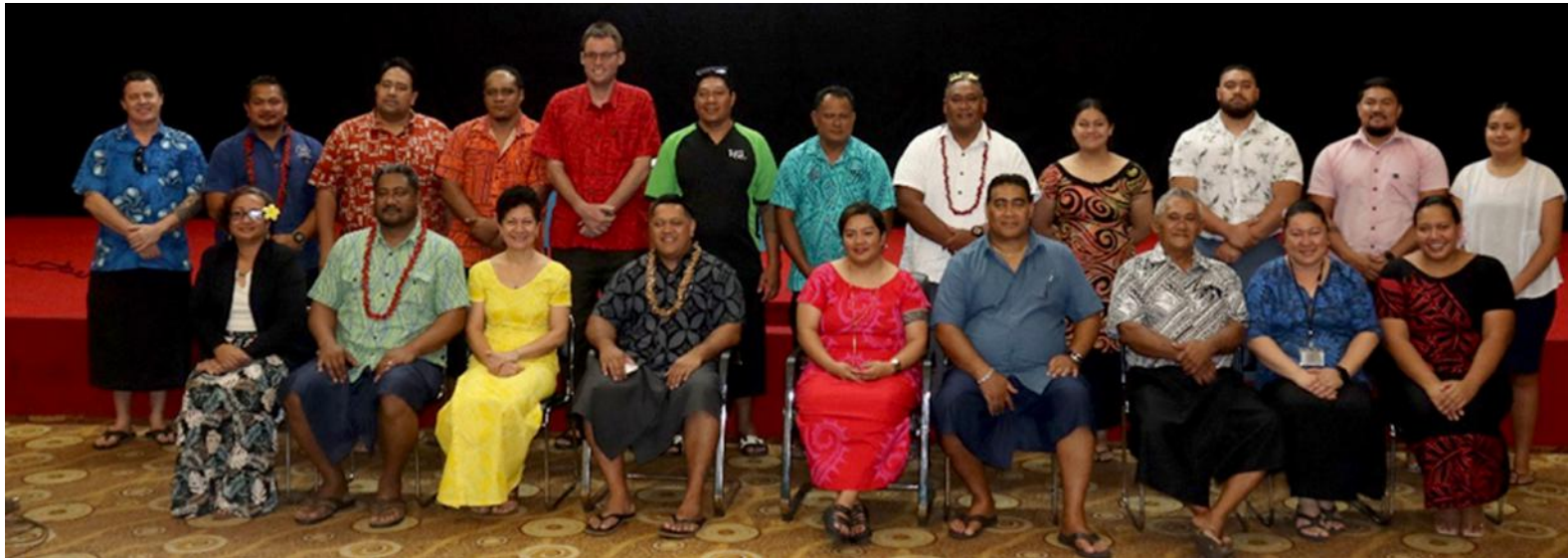
Stakeholders and representatives from Ministries and staff of the Ministry of Finance (M.O.F.).