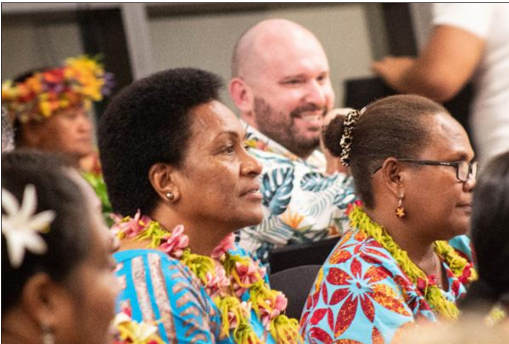
Participants from across the Pacific at the meeting.