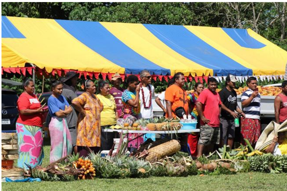
Ulua'i Seleselega mo le Itumālō o Falealupo.