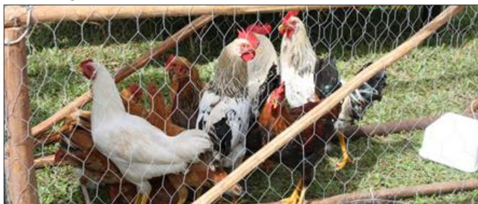
Moa Samoa, o lo'o fafagaina e tagata o le nu'u o Falealupo auā le lo latou fofoga taumafa ma fa'atau atu e maua ai fo'i se seleni e tausi ai le 'āiga ma fa'atupe ai mea fai i le nu'u ma ekalesia.

Na aga'i asiasiga mo le āsia o fua o fa'a'ele'eleaga na mafai ona fa'alauiloa i lea aso.