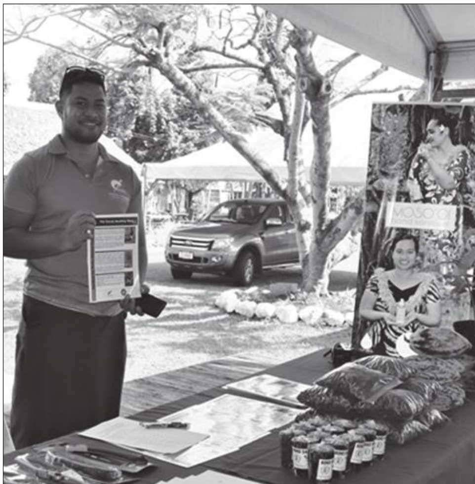
Information about possibilities for creating, marketing by-products were made available at the event.