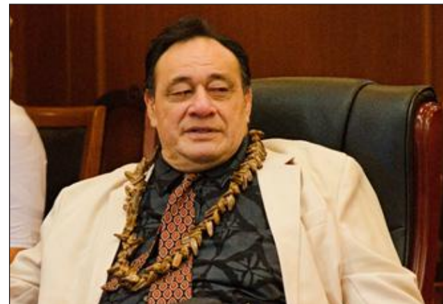
puipuga o le soifua mālōlōina lautele.

Tau Soifua Mālōlōina Fa'avāmālō 2005, ina ia mafai ona puipuia, vave ona iloa aemaise le lelei ma atoatoa le tali vave atu i le tele o fa'ama'i fa'apea ma fa'alavelave fa'afuase'i matuiā. O se tasi o fautuaga o le fono sa tauaofia a le Soifua Mālōlōina mo le lalolagi atoa (World Health Assembly) i le tausaga e 2021, na soālaupule ai le fa'aāogaina o metotia po'o le fa'ava'a o iloiloga i lalo o le Tulafono Fa'atonutonu tau Soifua Mālōlōina ina ia toe iloilo ai galuega fa'atino a atunu'u. O le avanoa lea e mata'itū ai po'o a vaega o lo'o mana'omia le fa'aleleia ma fa'amausalina ina ia mautinoa le lelei o le puipuga ma saogālēmū se atunu'u i taimi o fa'alavelave fa'afuase'i ma fa'ama'i e alia'e mai.