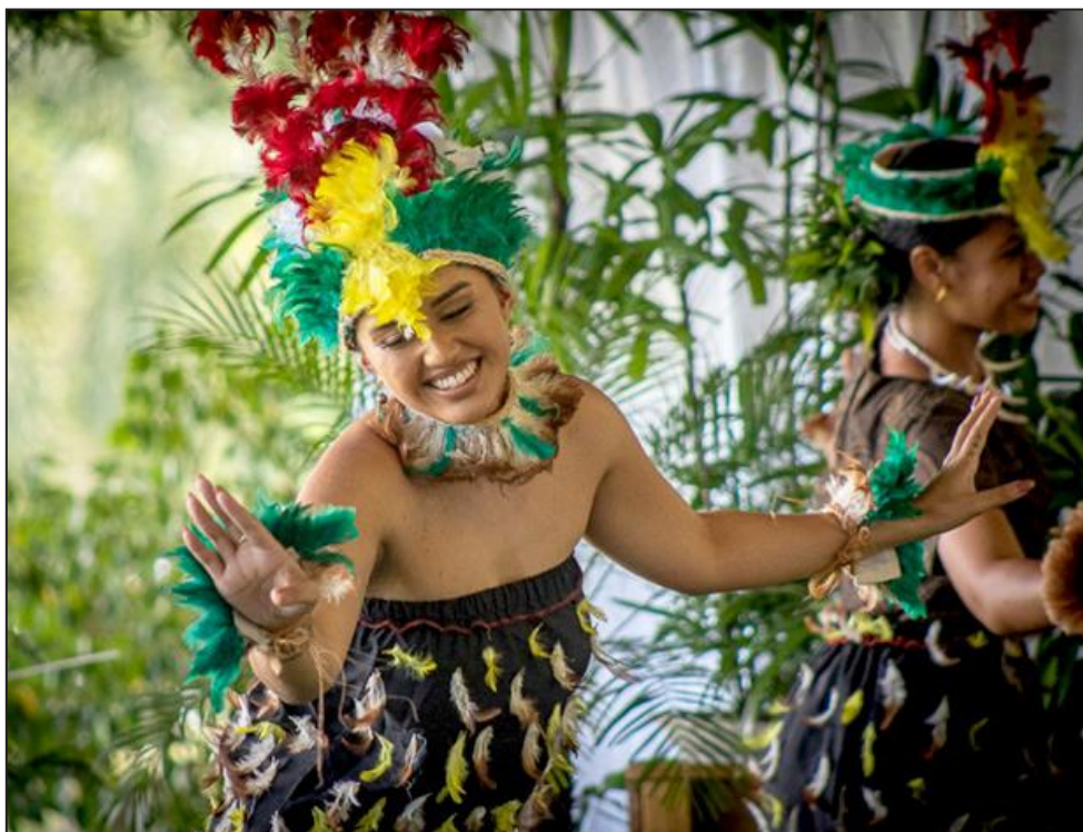
MOEMOANA: The very first siva Samoa I learnt was when I was five years old and is about the Manumea bird, Samoa's national bird the rare tooth billed pigeon which is sadly on the brink of extinction.

For more information, please contact the Senior Executive Services Division of our Office on telephone 22123 or email ses@psc.gov.ws