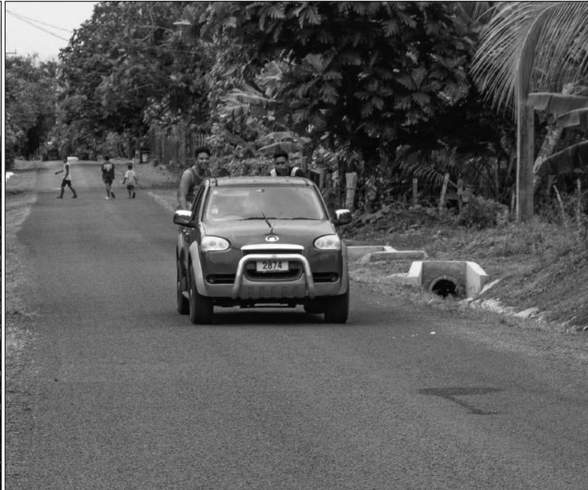
The new 2km road constructed by Lucky Construction Ltd