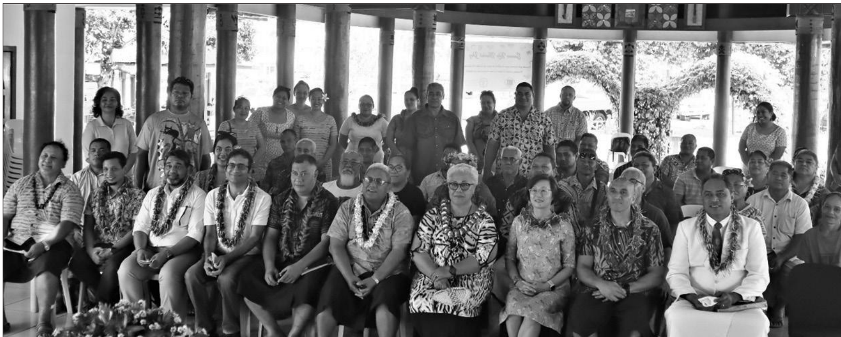
Mamalu o le Mālō ma ana pa'aga fa'avāomālō ma le aufaifa'ato'aga koko i Samoa, sa auai i le Aso Fa'apitoa mo le Maketiina o le Koko Samoa.

O nei koko sa fa'afaiilele mai ai le tele o koko ua maua i Samoa nei.