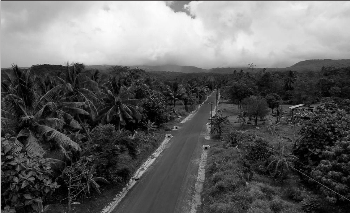
The new Fagali'i road.