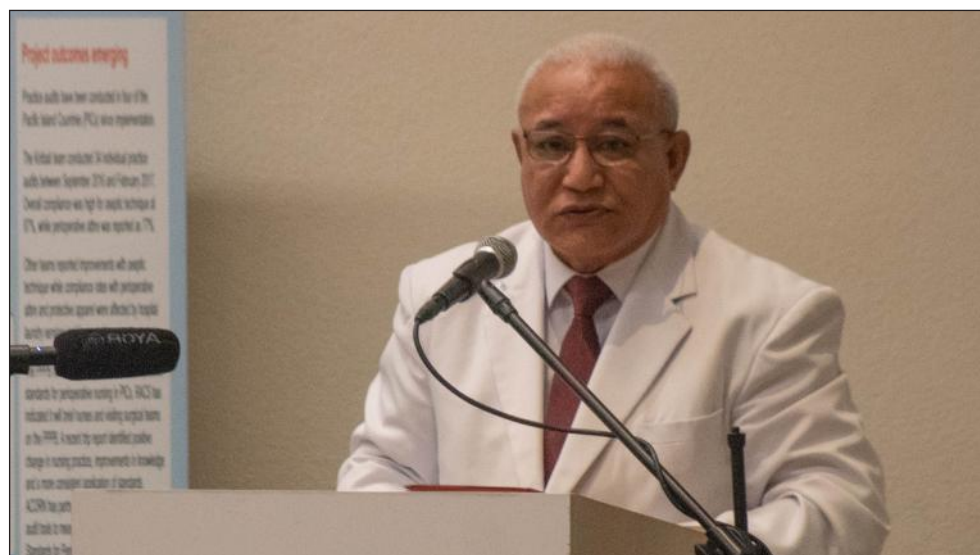
mai le itulau muamua

For more information, please contact the Senior Executive Services Division of our Office on telephone 22123 or email ses@psc.gov.ws