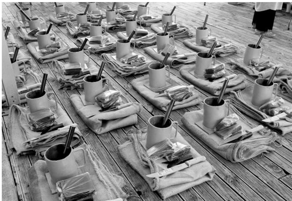
O tanoa tu'i koko ma meafaigaluega mo le gaosia o le koko Samoa, sa tufatufaina atu mo le aufaifa'ato'aga koko i le atunu'u.