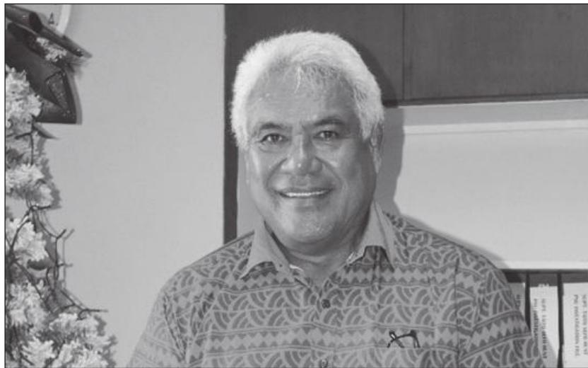
Minister of Police, Prisons and Corrections Services.

According to the minister, when the parole