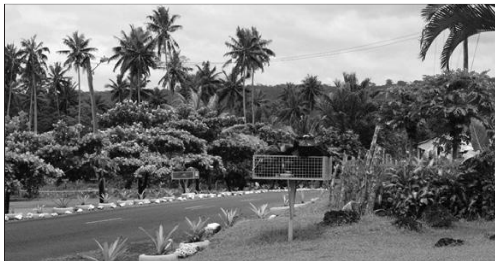
Mae'a fa'atutūina fata lapisi fou mo le afio'aga o Lotofagā, Safata.