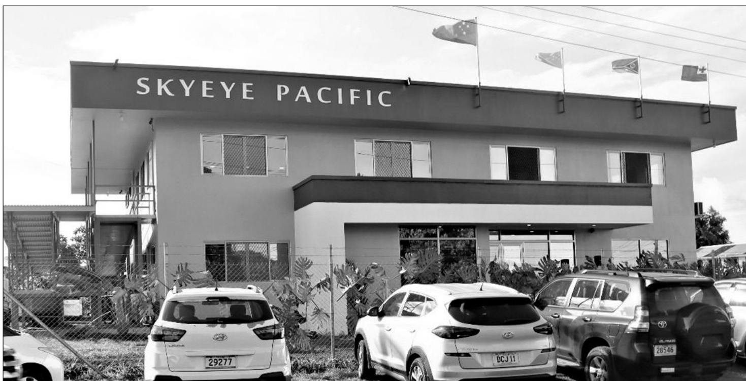
Ofisa Autū Fou a le Kamupani o le SkyEye Pasefika o lo'o i Lotopā.

"O le manuia ma le la'asia e so'o se pisinisi o se isi la'asaga fou, e ala mai i le galulue fa'atasi ma