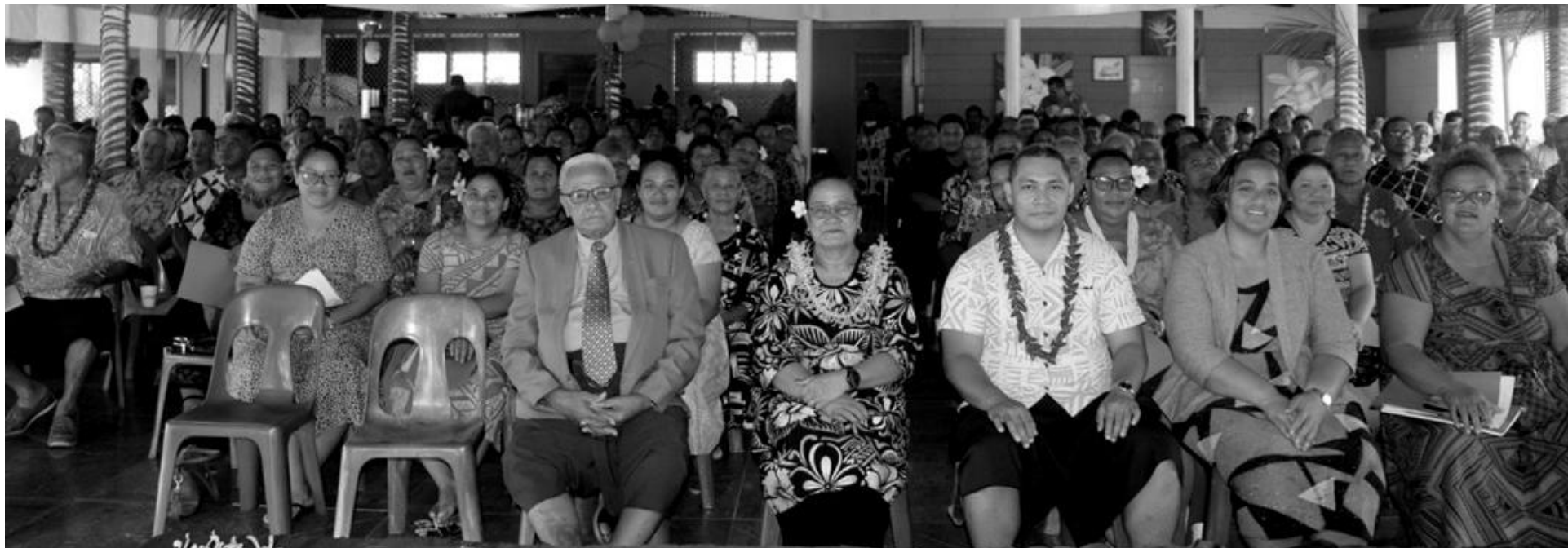
Ata o le mamalu o le atunu'u lautele sa potopoto fa'atasi e soālaupule ma iloilo Tulafono o le Saogālēmū o 'Āiga 2023 fa'atasi ai ma Tulafono e patino tonu lava i le lotoifale o 'āiga.

Pepa o Fa'amatalaga: Matāgaluega o Fa'amasinoga ma Matā'upu Tau Fa'amasinoga