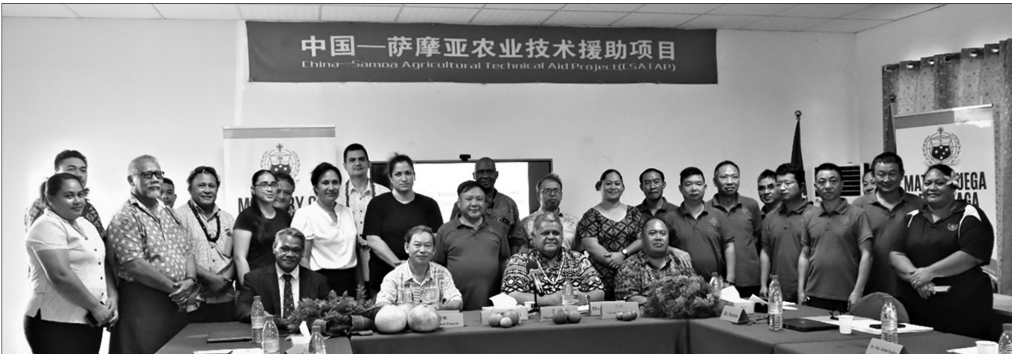
Sui o le Mälö o Saina ma le Mälö o Samoa o lo'o galulue fa'atasi i le taumafaiga ia olaola pea le Polöketi o le S.C.A.T.A.P. auä le soifua atia'e o tagata Samoa mo nei ma le lumana'i.