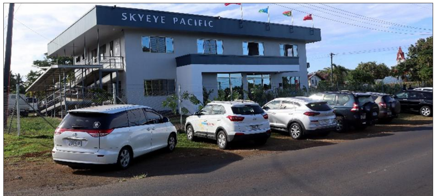
The new premises at Lotopa.

"This is an achievement not just for SkyEye but also for Samoa as not many of our Samoan businesses have spread as far as other Pacific