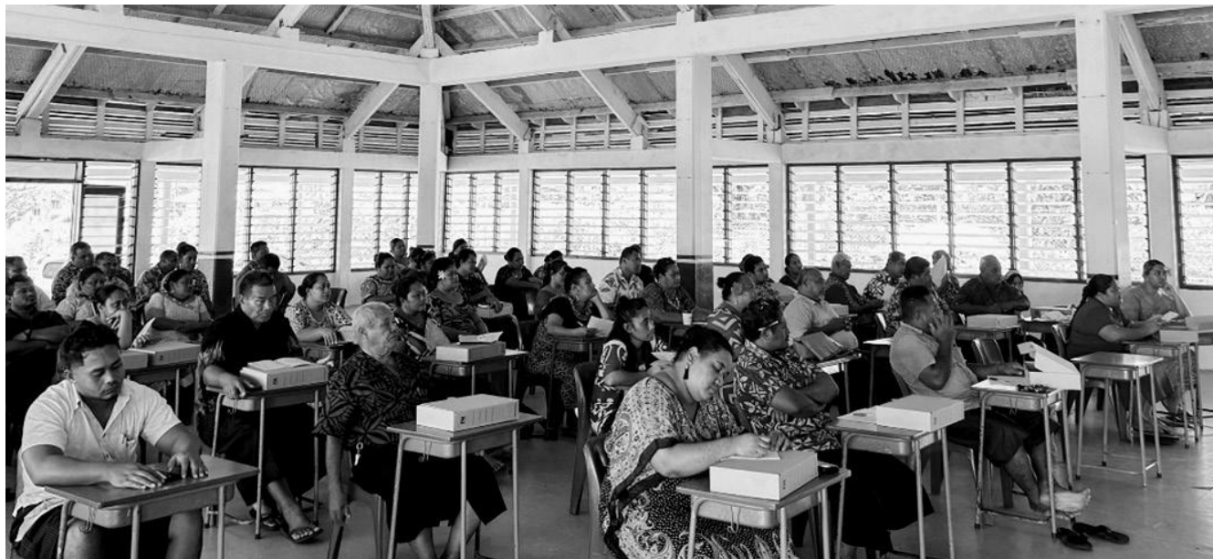
Nisi o faiā'oga o lo'o galulue i ā'oga i Salāfai.