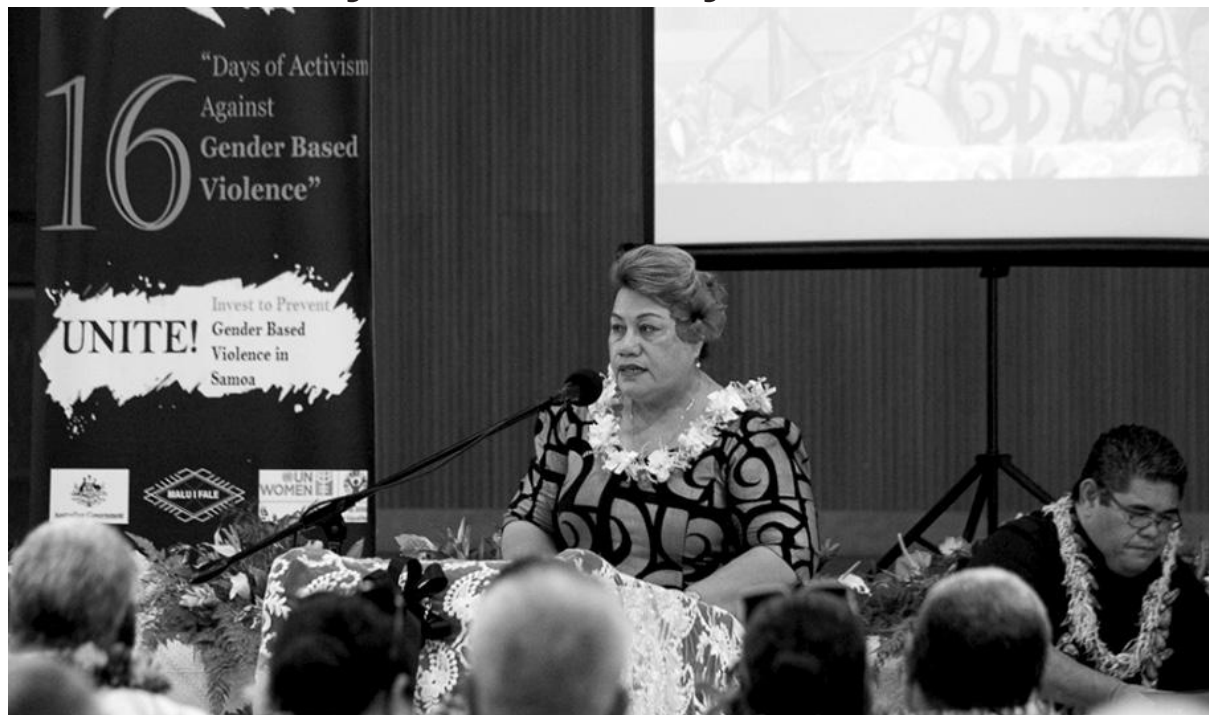
Minister of Women, Community and Social Development Mulipola Anarosa Ale-Molio'o.

The main goal is to, "Make significant tailwinds to propel actions to End Violence against Women and Girls beyond the 16 days campaign of Activism"