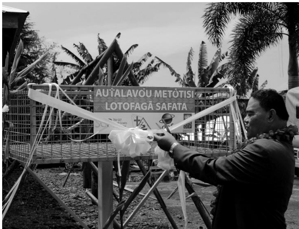
O'otiina o le lipine e le susuga i le Fa'afeagaiga o le Ekalesia Metotisi i Lotofagā, Safata auā le fa'aāogaina o fata lapisi e lo latou afio'aga.

Na fa'afetaia e Lilomaiava le finau ma le silasila mamao a le ekalesia, o se 'ai lea auā le soifua atia'e.