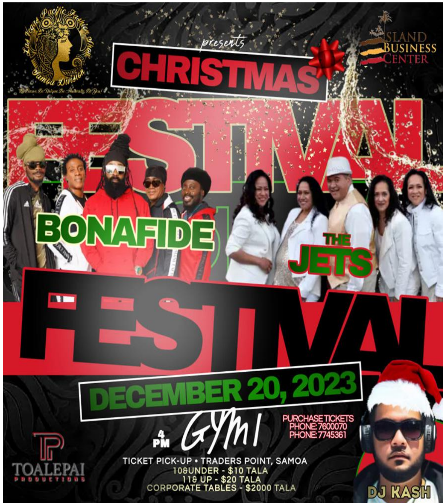
The promotional material for the festival.

So the December festival is a chance for the community to witness international performers, local unknown talents but also to help fundraise opportunities for those signed