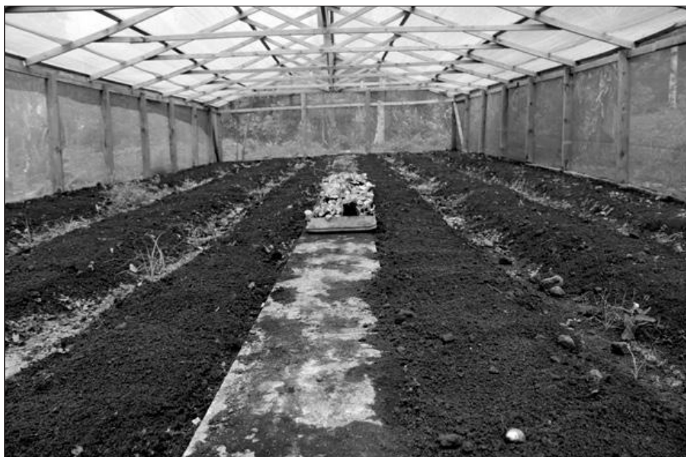
Fale Lā'au (Green House) mo fuālā'au 'aina.