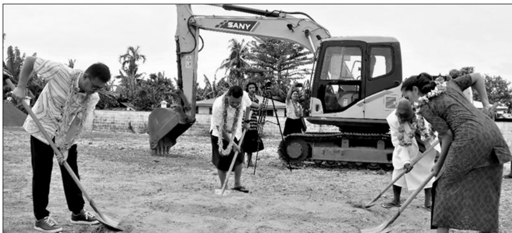
Suatia o le 'ele'ele mo le amatalia o le galuega tele i le faleä'oga a le Ä'oga Tulagalua a le afio'aga o Vaigaga e pei ona fa'atupeina e le Faletupe o le Lalolagi po'o le World Bank.

"O le Faleä'oga lenei, o se tasi o atina'e muamua lea i totonu o Samoa, ua fausiaina i lalo o fesoasoani a le Faletupe o le Lalolagi (World Bank). O se galuega na afua mai i