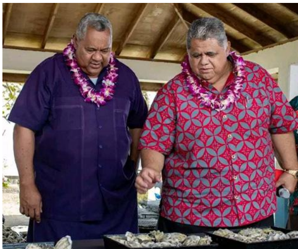
500 faisua sa auina atu i Samoa auā Tutuila ma Manu’a e pei ona silasila i ai le Afioga i le Kovana Sili o Amerika Samoa fa’apea le Minisitā o le Matāgaluega o Fa’ato’aga ma Faigāfaiva a Samoa.