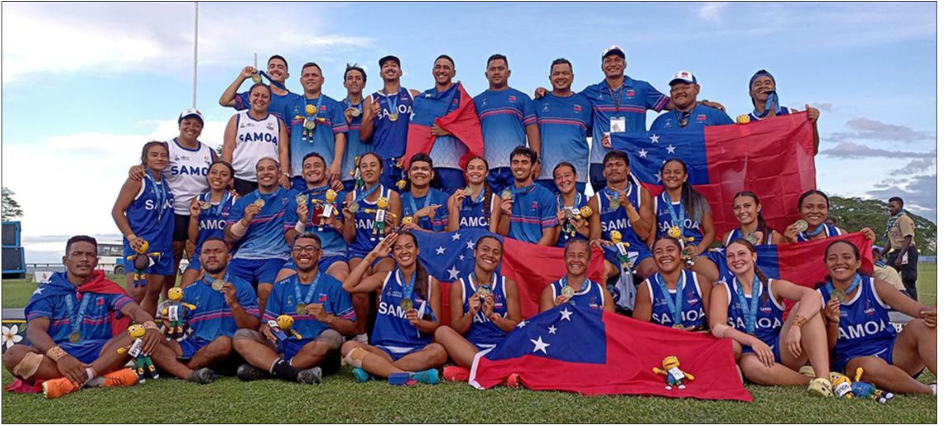
Samoa Men and Women's Touch Rugby Teams.