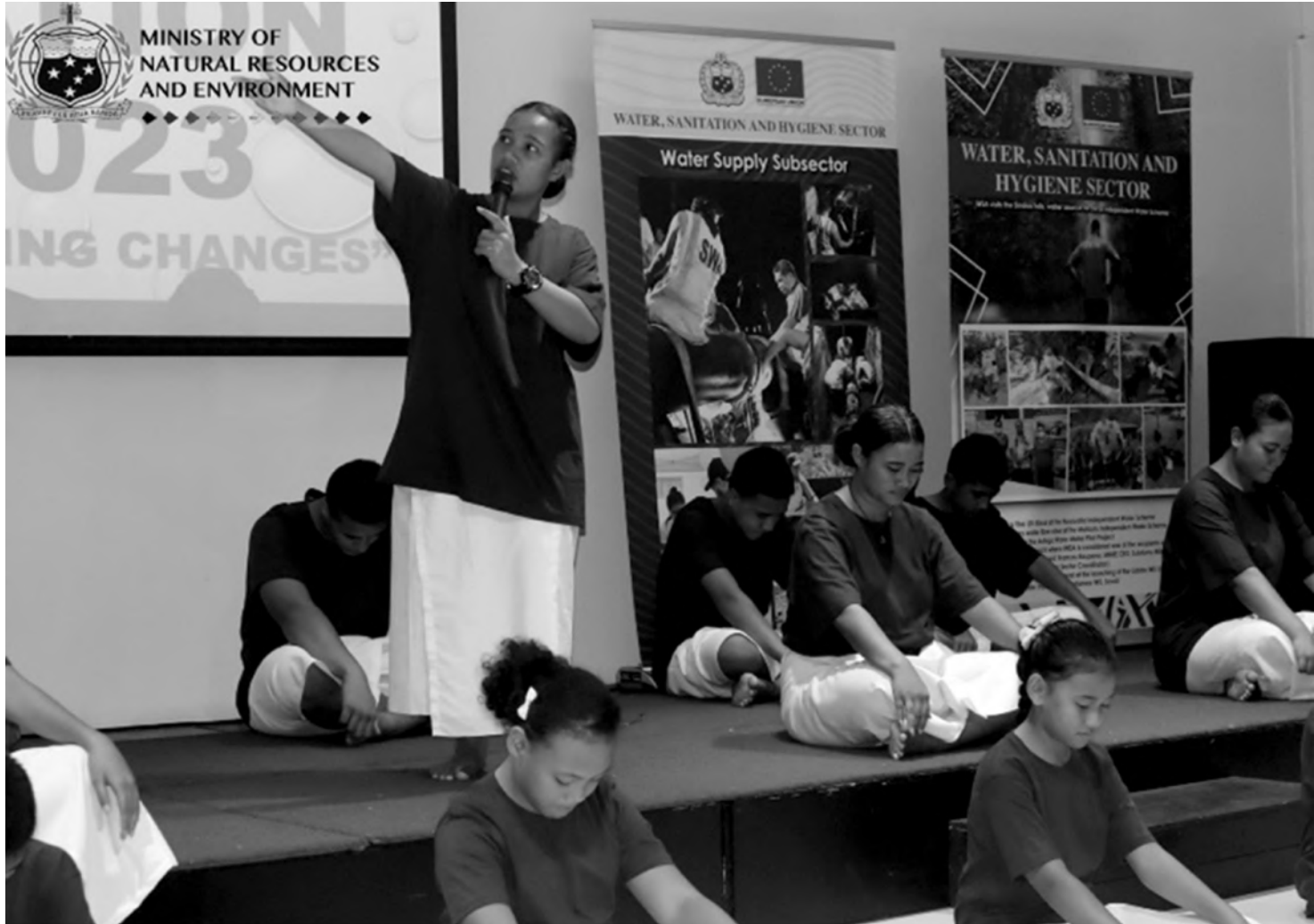
Siva ma Solo a nisi o Autalavou a Ekalesia i le atunu'u, na lagiina ma fatu, e fa'amanatu ai le tāua o le Aso Fa'apitoa mo le Tumamā Lautele o tagata Samoa, e le gata o so'o se vaega o lo tatou si'osi'omaga aemaise lava i faleui (tulou).

"Fa'afetai atu i le Matāgaluega ma ana pa'aga