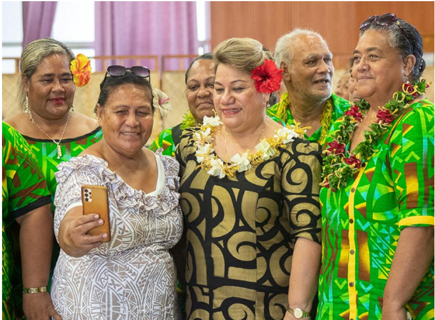
O se Samoa manuia ma fiafia, e leai ni sauaga ma uiga matagā e a'afia ai tinā, tama'ita'i ma fanau mai totonu o 'āiga, ekalesia ma Samoa aao.

"O le Pasefika o se tasi lea o itulagi o lo'o mauālugā ai Sauaga o Tinā ma Tamaiti i le lalolagi. E tusa ma le 2 mai le 3 fafine e a'afia i sauaga o feusuaiga i lo latou olaga. O le su'esu'ega sa fa'atino i le 2018, o lo'o manino ai e telē le fa'afitauli o lo'o feagai nei