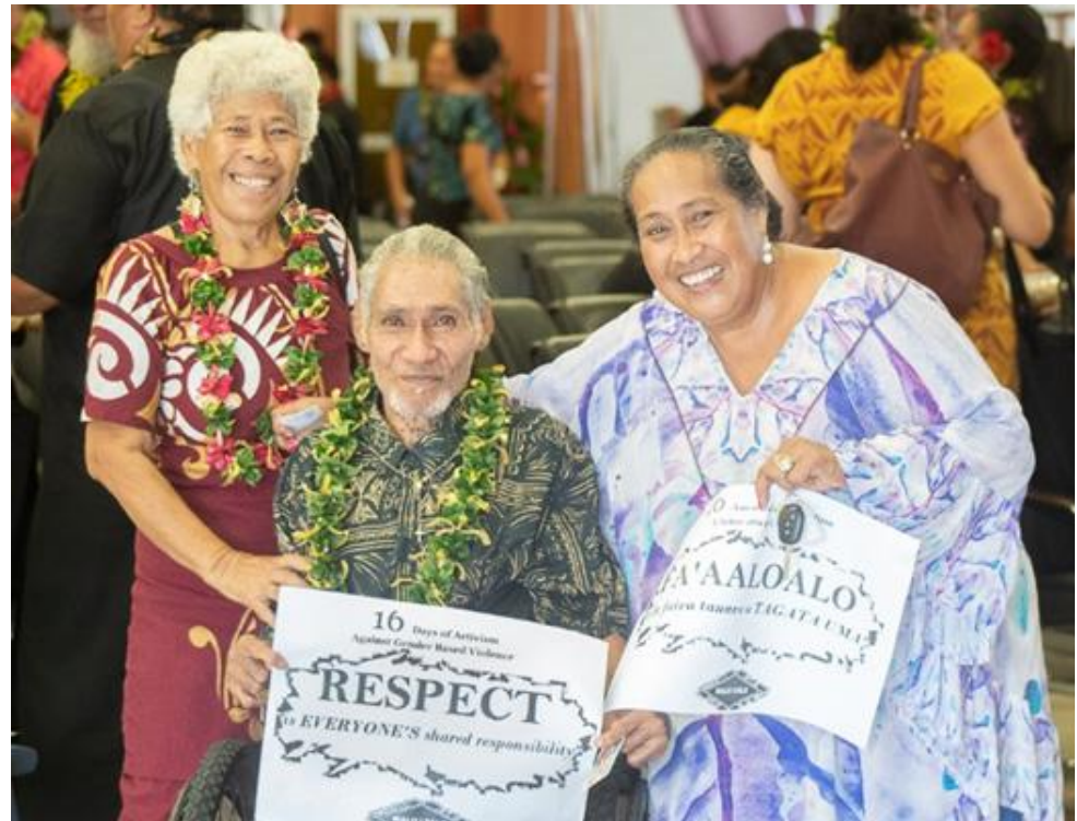
Ia amanaia tagata uma ma fa'aaloaloga o latou tamāli'iaga, aemaise i nai tinā, tama'ita'i ma fanau e aofia ai ma i latou e i ai a'afiaga tumau o le soifua.

"I le lagolagoina o Faiga Fa'avāe, Tulafono ma Aiaiga fa'avāomālō ua mae'a ona sainia e Samoa e uiga i sauaga. O le a unā'ia e le Matāgaluega o Tinā ma Tama'ita'i, Atina'e o Nu'u ma Agafeso'ota'i i le malosi e gata ai le