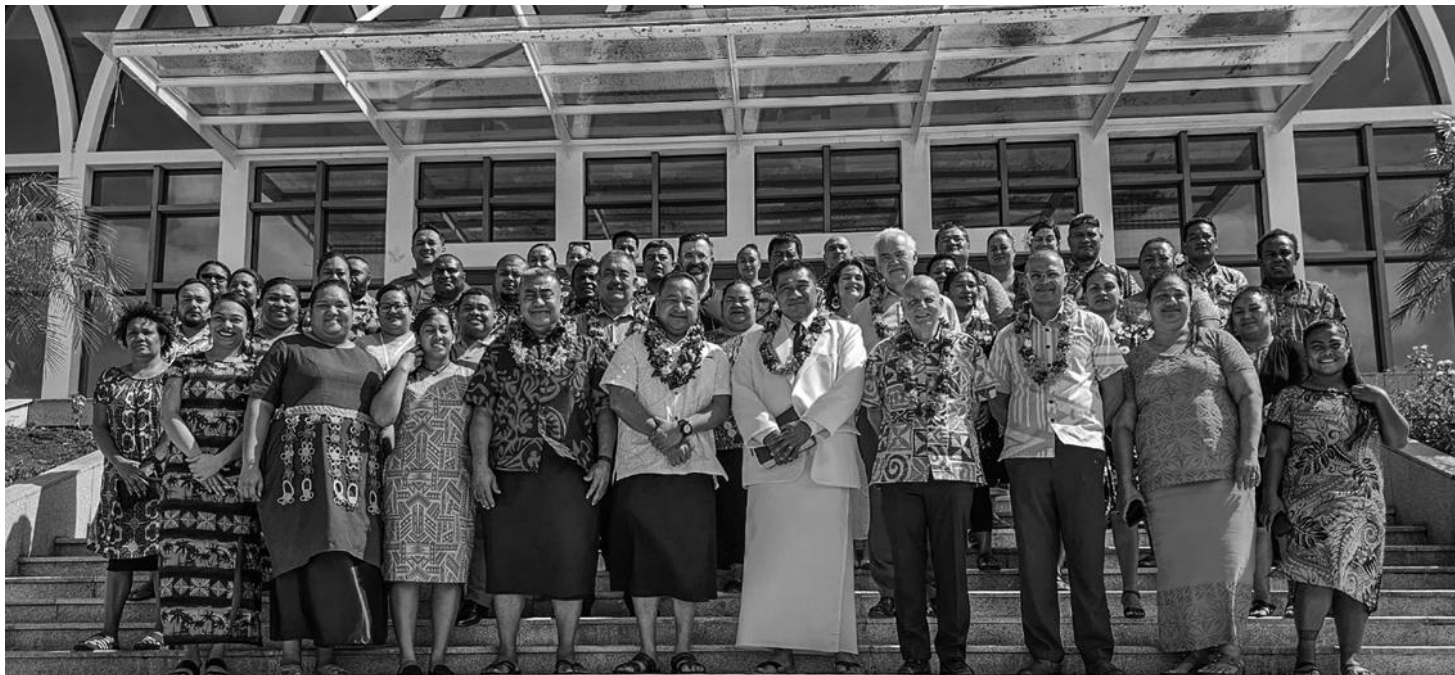
5-day Regional Workshop on Strengthening Public Investment Planning and Management in the Pacific at TATTE.